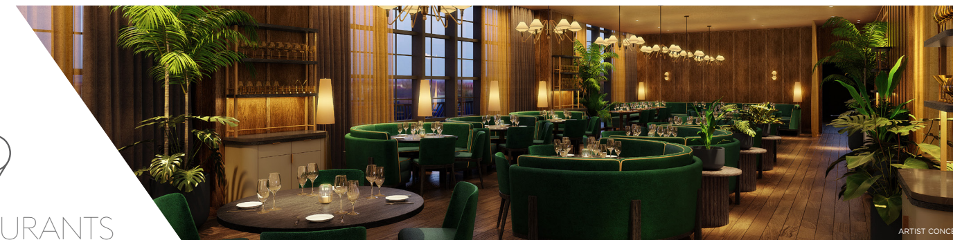
24,000 SQ FT OF INVIGORATING FOOD & BEVERAGE OFFERINGS FOCUSED ON LOCAL FARE