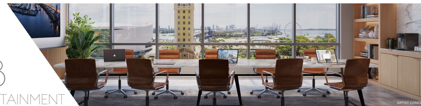
30,000 SQ FT PRIVATE EVENT AND MEETING SPACES