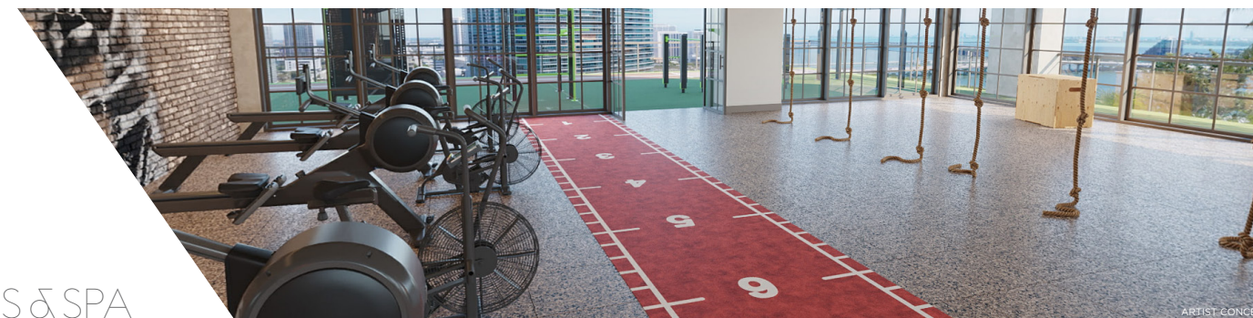
HEALTH AND FITNESS CENTER, AIMED AT NOURISHING BODY & SOUL.