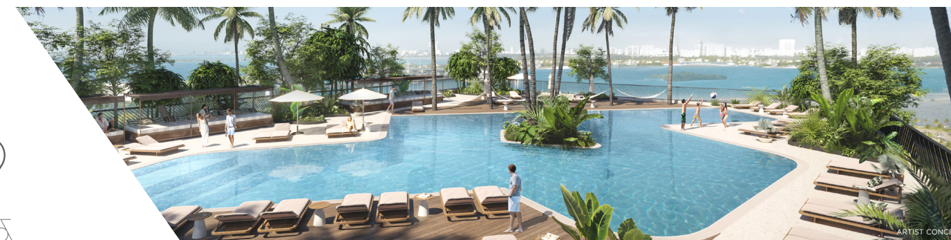
16,000 SQ FT POOLSIDE RETREAT ELEVATED ABOVE THE HUM OF DOWNTOWN