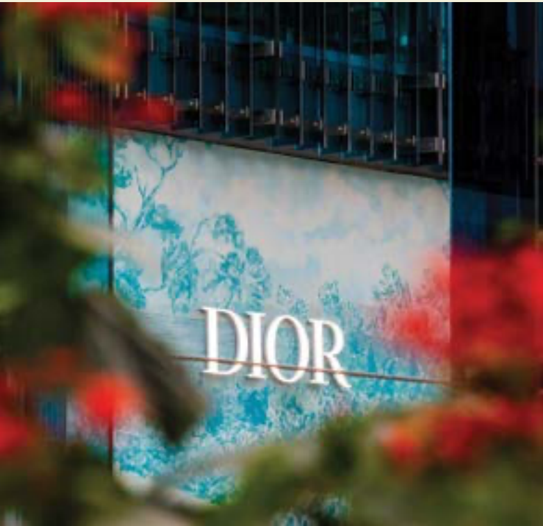
DIOR, DESIGN DISTRICT