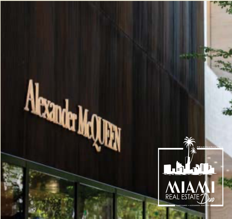
ALEXANDER MCQUEEN, DESIGN DISTRICT