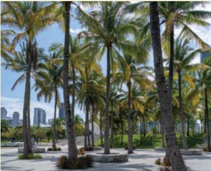
TOP: Miami Beach Golf Club; MIDDLE: South Beach; BOTTOM: Maurice A. Ferré Park Baywalk