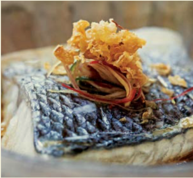
SEXY FISH MIAMI