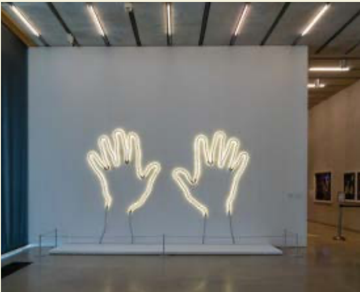
TOP: Wynwood Walls; MIDDLE: Penetrável Macaléia by Hélio Oiticica at Pérez Art Museum Miami; BOTTOM: Notes for a Poem on the Third World, Glenn Ligon, Pérez Art Museum Miami