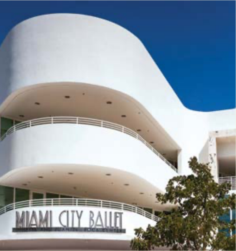
MIAMI CITY BALLET, MIAMI BEACH