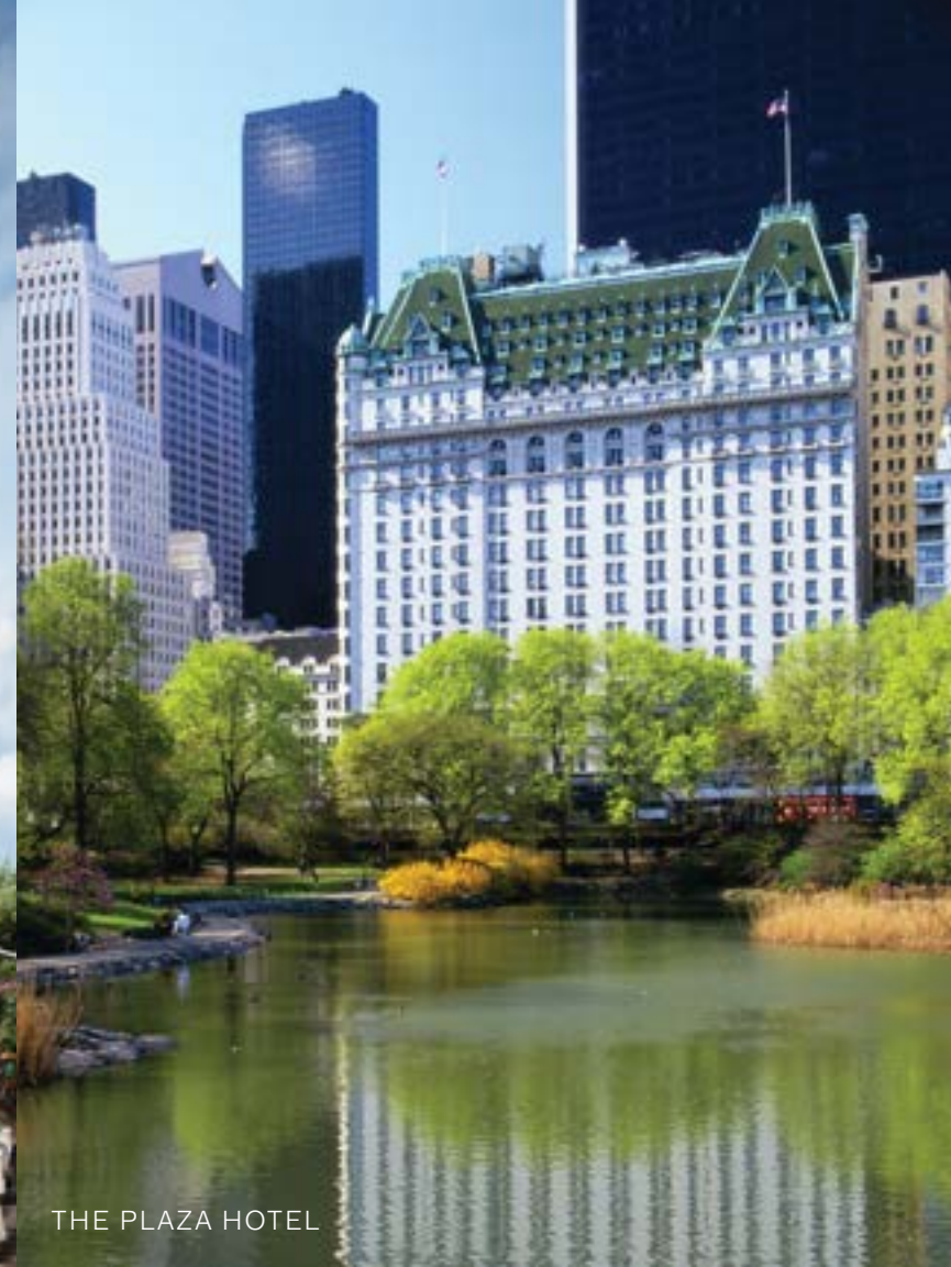
THE PLAZA HOTEL