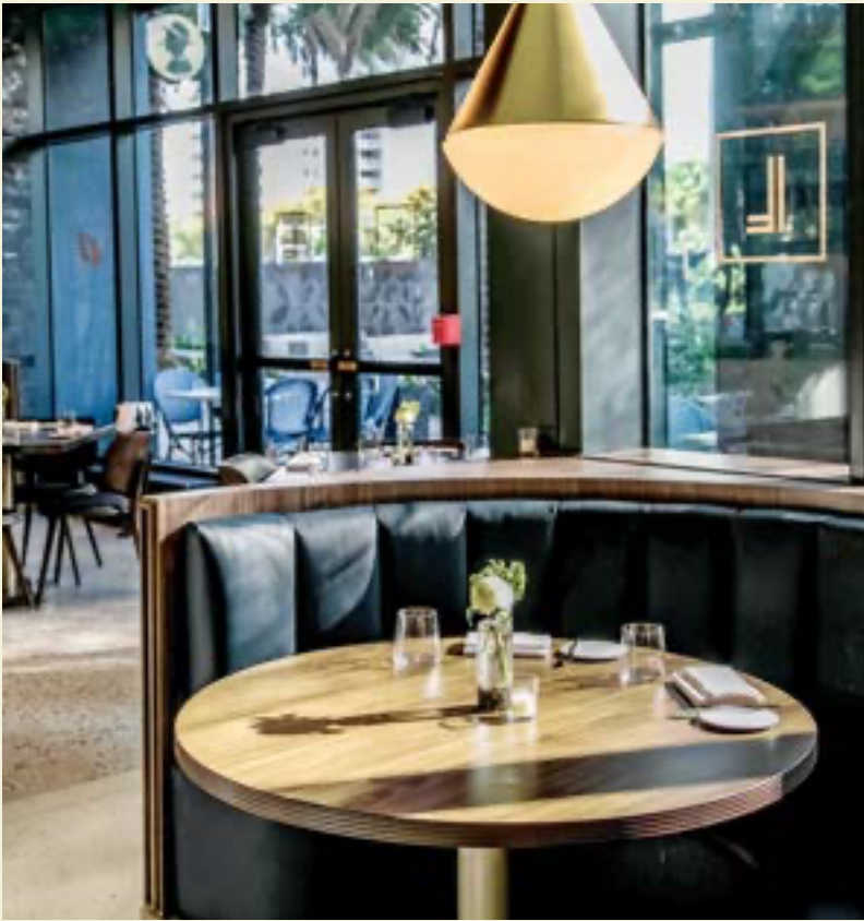
BRASSERIE LAUREL, MIAMI WORLDCENTER

Miami's ever-evolving dining landscape runs the gamut from local spots to acclaimed restaurants, serving cuisines as diverse as the people who flock to the city. Over a dozen Michelin-starred restaurants are within striking distance of JEM. When completed, Miami Worldcenter will be home to over 30 restaurants, including several from world-renowned chefs.