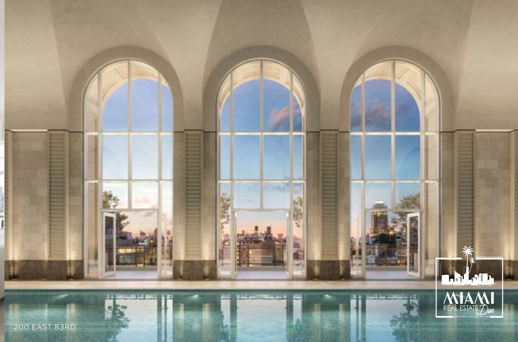
200 EAST 83RD