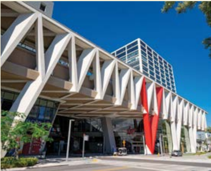
TOP: Miami Metromover; MIDDLE: Brightline; BOTTOM: MiamiCentral Train Station