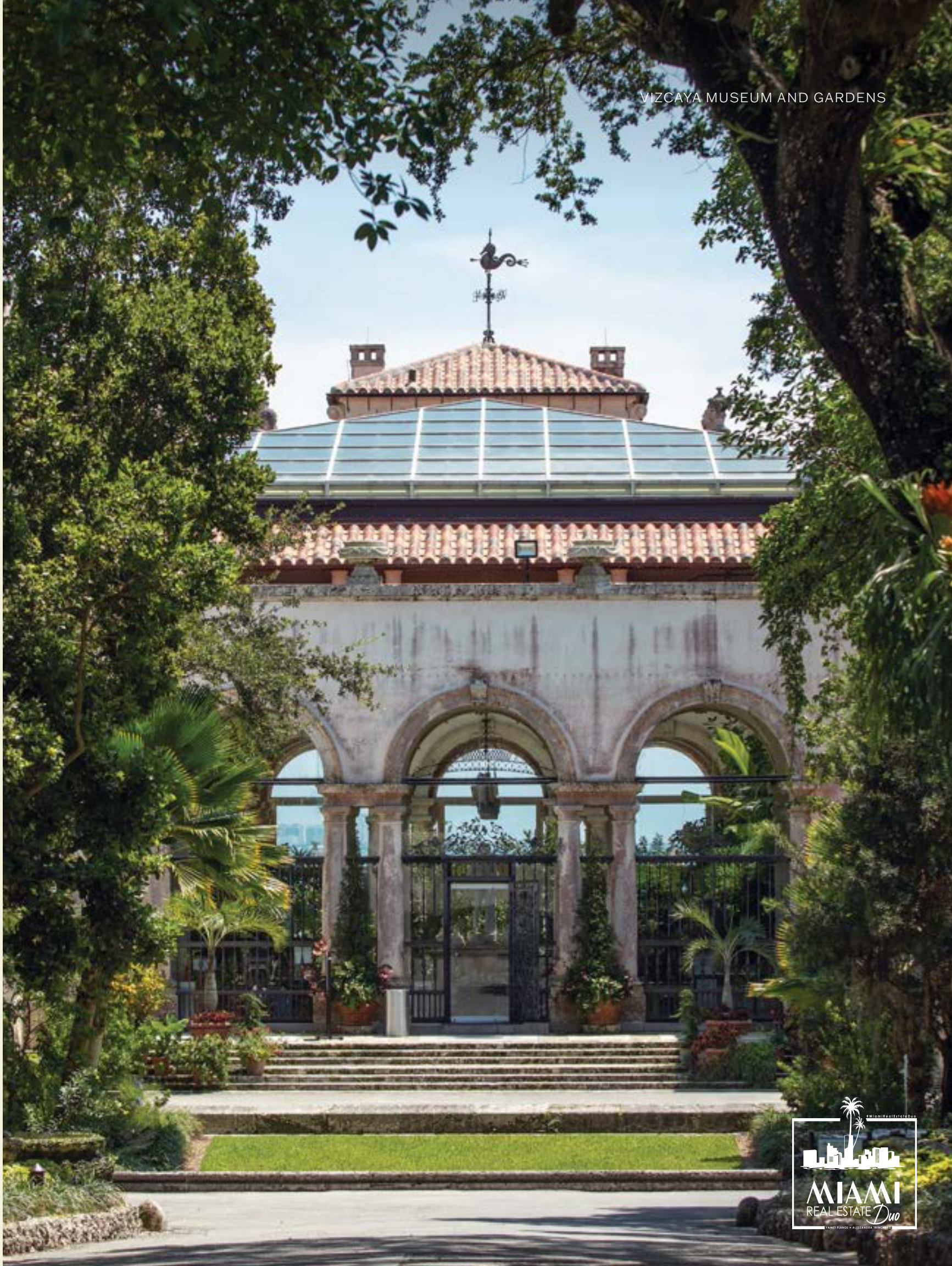
VIZCAYA MUSEUM AND GARDENS