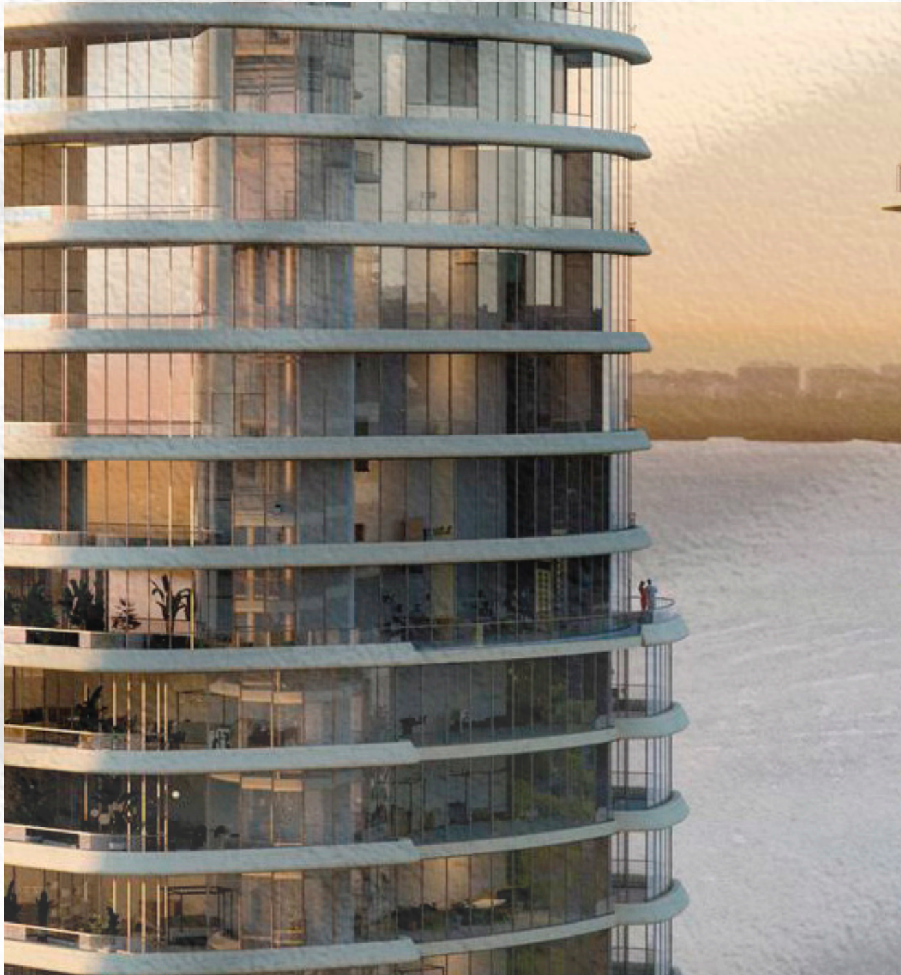
St. Regis Miami Residences epitomize elegant living.