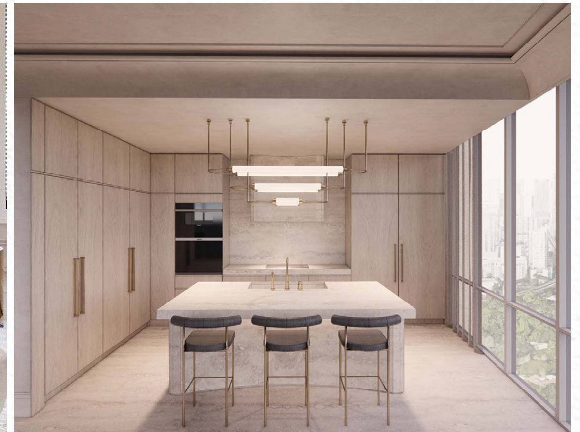
Two-to-Four Bedroom Residences Starting From $2.7M