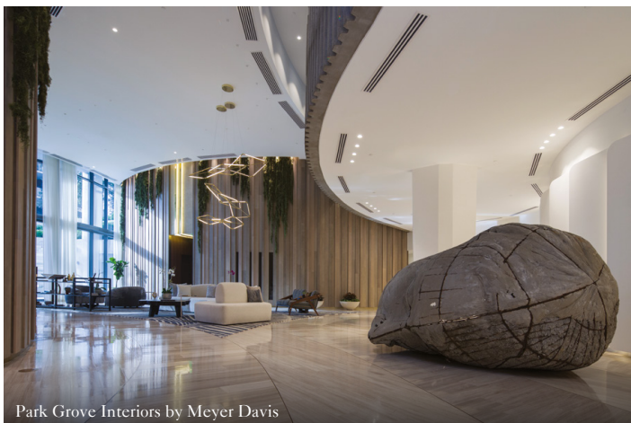
Park Grove Interiors by Meyer Davis