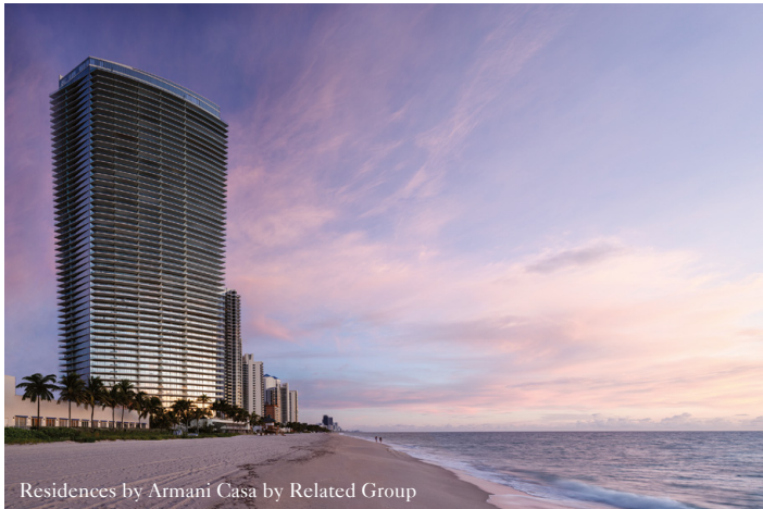
Residences by Armani Casa by Related Group

Renowned Swiss landscape architect Enzo Enea of Zurich-based Enea Garden, is one of the leading landscape architects in the world. A hallmark of Enzo Enea's work is the fusion of indoor and outdoor spaces, the creative intertwining of the soul of the residence with its surroundings.