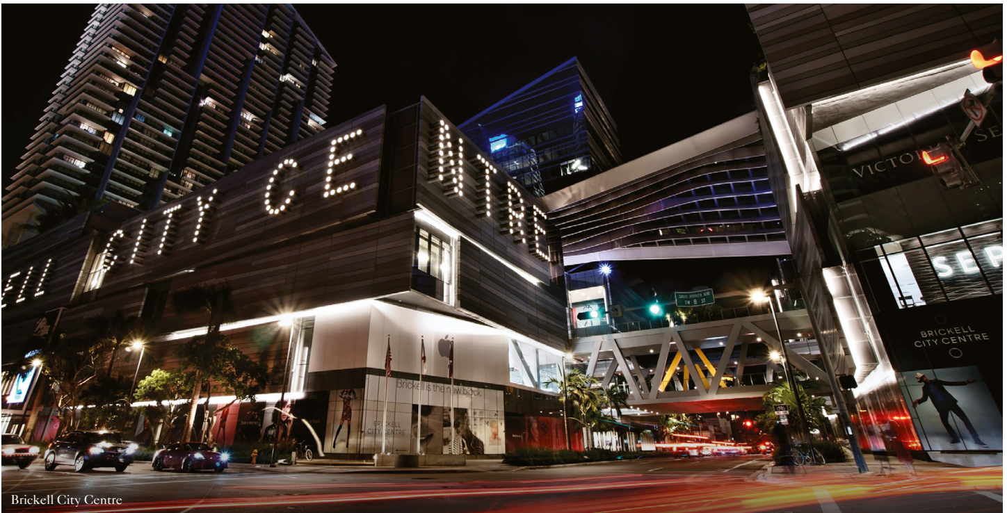
Brickell City Centre

Perfectly positioned at the entrance of Brickell Avenue, where the Miami River meets the beautiful blue waters of Biscayne Bay, and the bustling financial district blends with high-end shopping, top restaurants, cultural hot spots and exiting nightlife – this iconic neighborhood is an all-day all-night lifestyle destination, aptly named the Manhattan of the South.