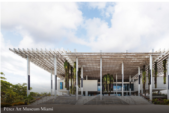
Pérez Art Museum Miami