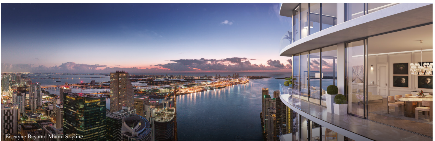
Biscayne Bay and Miami Skyline