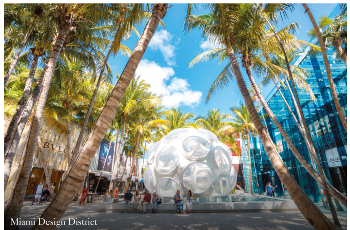
Miami Design District