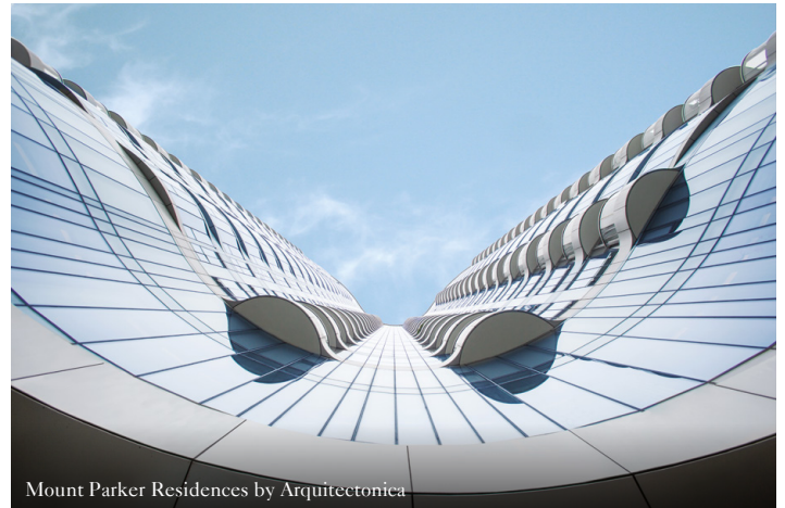
Mount Parker Residences by Arquitectonica