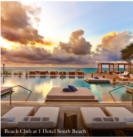
Beach Club at 1 Hotel South Beach

The private marina, planned riverside restaurant and lushly landscaped river promenade invite residents to spend hours and days luxuriating in the infinite energy and organic sparkle of life by the water. Watch the superyachts come and go, take a sunset stroll towards the bay, or head to a number of chic waterside restaurants courtesy of our private water taxi service. Residents can enjoy private membership and exclusive access to the Beach Club at 1 Hotel South Beach, SH Hotels & Resorts sister property. With loungers, beach towel services, cabanas, and seaside snack and beverage services, this waterfront community will cater to leisurely hours under the sun. Take a break from the hustle and bustle of the city and unwind with a cool drink in hand and the sand between your toes.