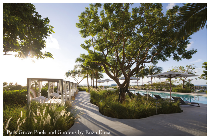
Park Grove Pools and Gardens by Enzo Enea