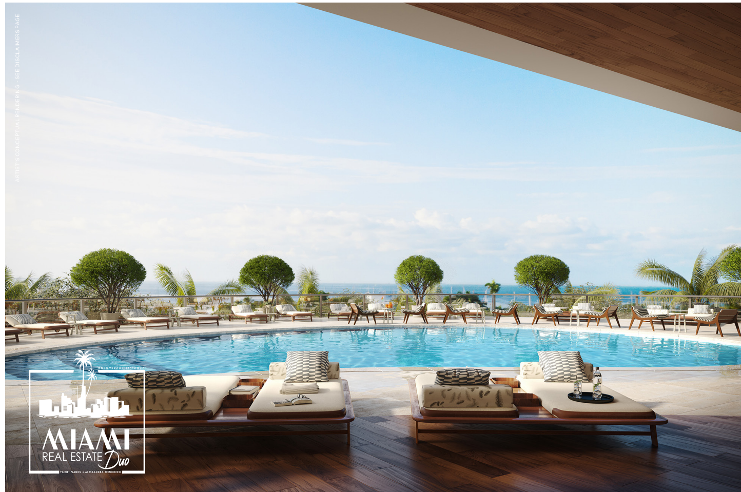
Bayshore Club Pool Deck

Personalized services, including a 24-hour concierge, are complemented by a host of amenities at Mr. C Residences Coconut Grove.