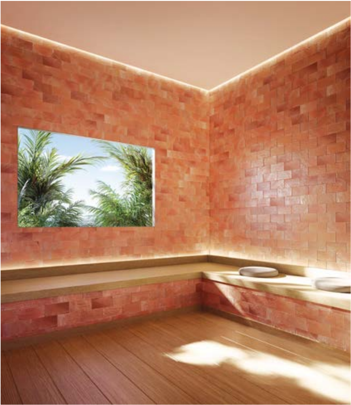
Composed of rare pink Himalayan sea salt, the salt room is inspired by a healing tradition rooted in natural salt caves in Europe, which are known for their healing and detoxifying properties.