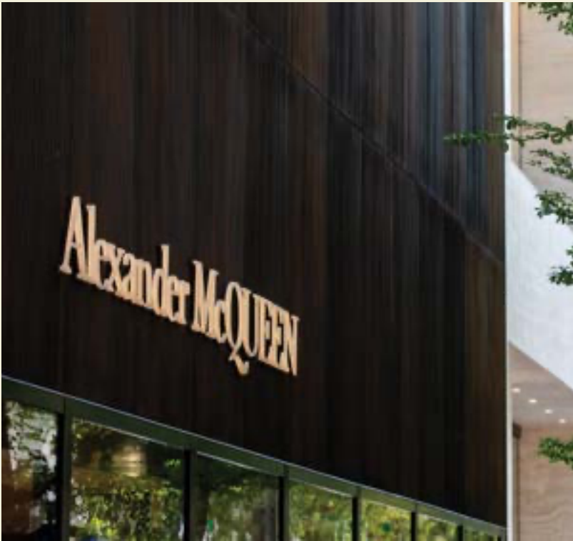
ALEXANDER MCQUEEN, DESIGN DISTRICT