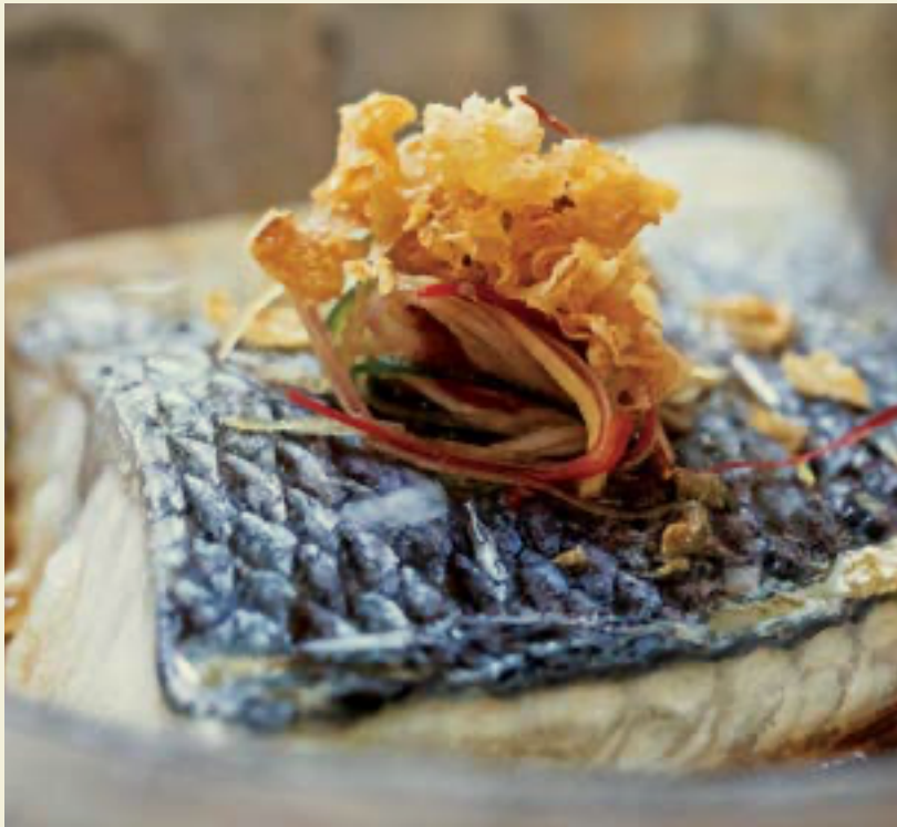
SEXY FISH MIAMI