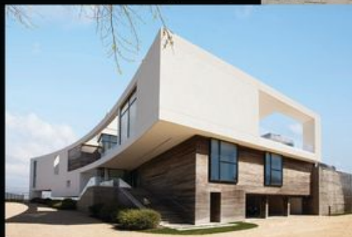
Hamptons Residence - NY