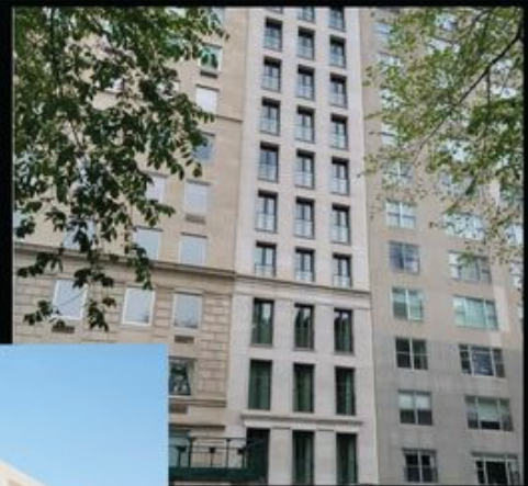
Fasano Hotel - NYC