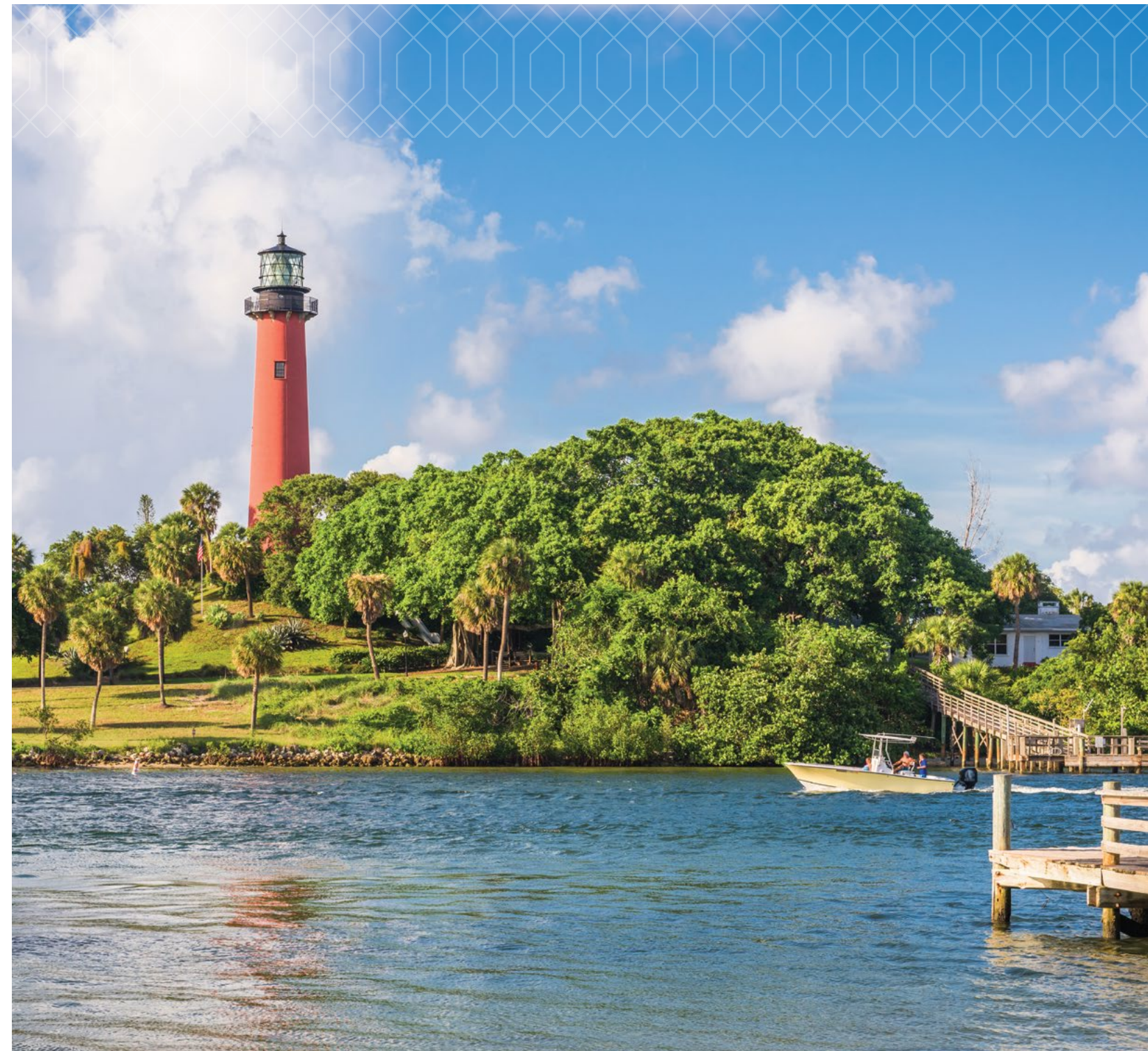
Jupiter Inlet Light House: An icon of Jupiter's Intracoastal Waterway since 1860