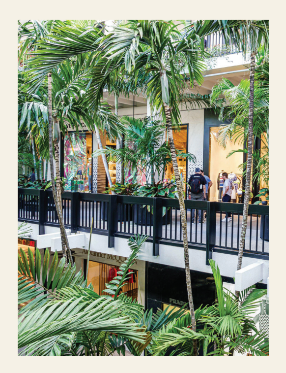
The Bal Harbour Shops are just 10 minutes away and filled with the highest concentration of luxury boutiques and exclusive brands in Miami, as well as fine dining, all surrounded by lush tropical landscaping.

Located between Bal Harbour and the Faena District on Miami Beach, this beachfront neighborhood is packed with attractions for the outdoor enthusiast, from the long stretch of sandy beaches to Oceanside Park.