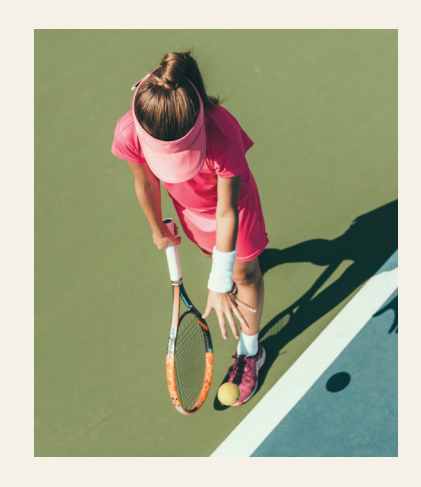
Also nearby are the Miami Beach Tennis Center and the Normandy Shores Golf Club.