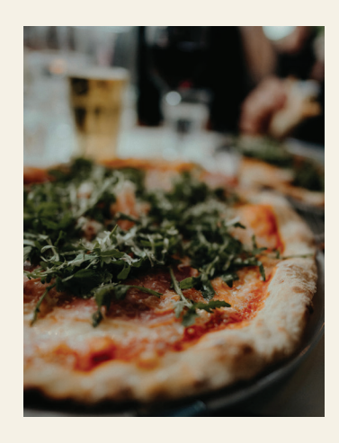
Restaurants, cafés, bars, parks, and more can be found by bike or stroll through the palm tree-lined streets.