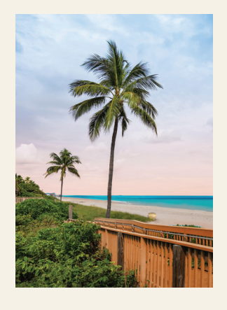
The Miami Beach Boardwalk stretches from 87th Terrace all the way to South Pointe Park.