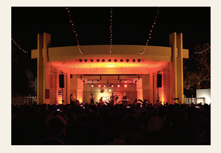
Take in live music under the stars at the Miami Beach Bandshell and visit the farmer's market centered around the historic Normandy Fountain.