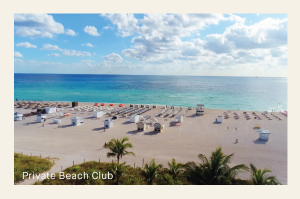
A hidden coastline gem packed with attractions for the outdoor enthusiast.