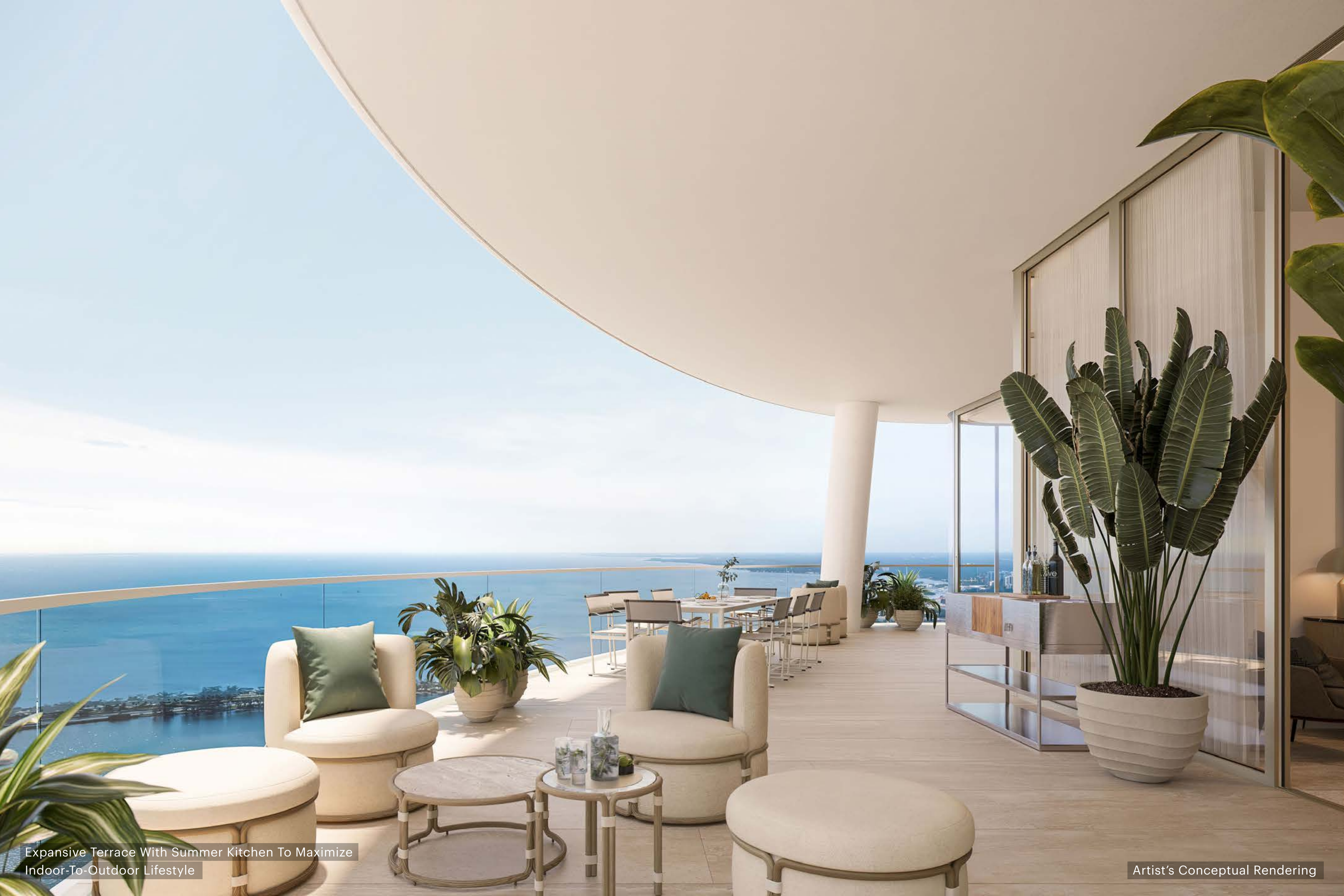
Expansive Terrace With Summer Kitchen To Maximize Indoor-To-Outdoor Lifestyle