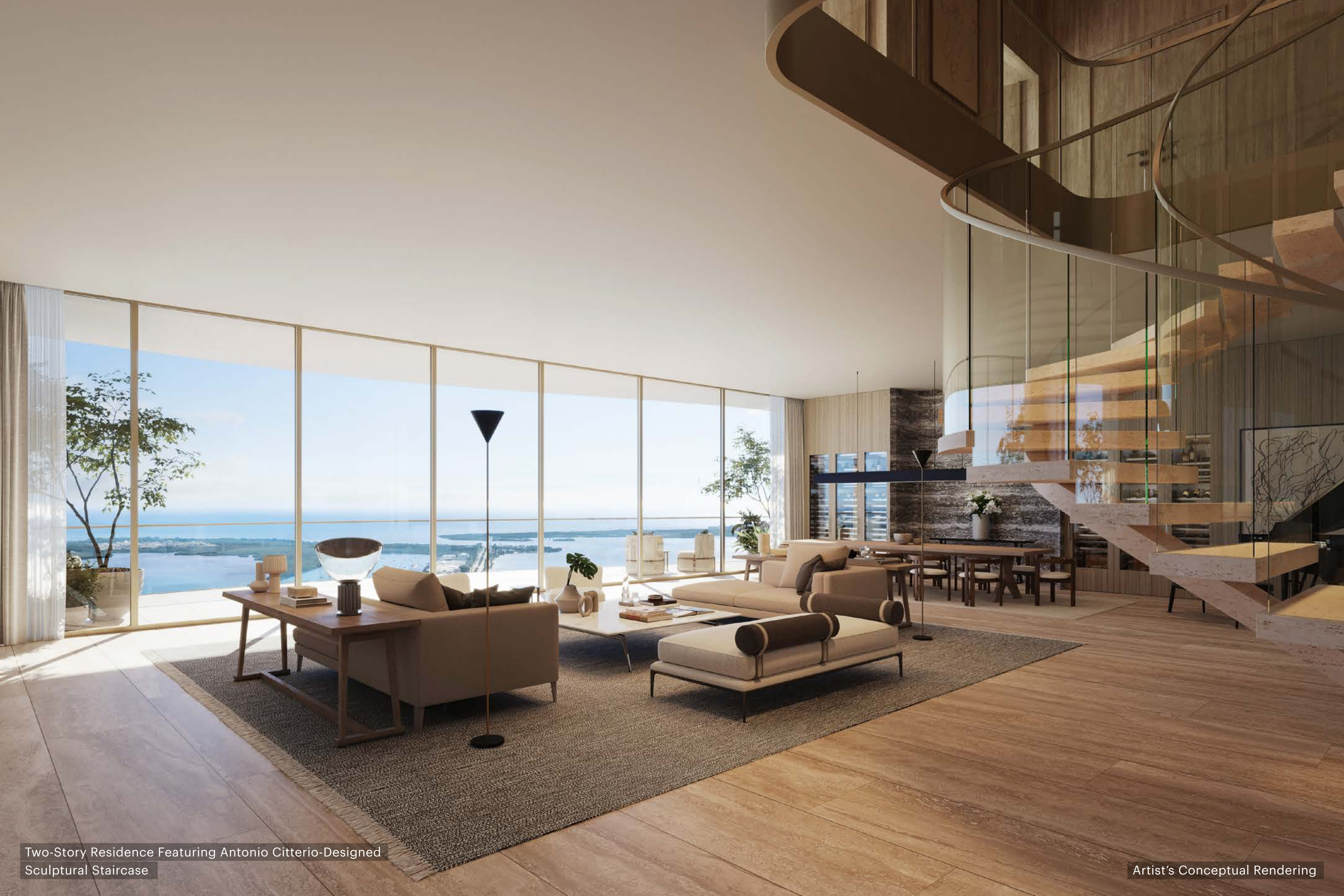
Two-Story Residence Featuring Antonio Citterio-Designed Sculptural Staircase