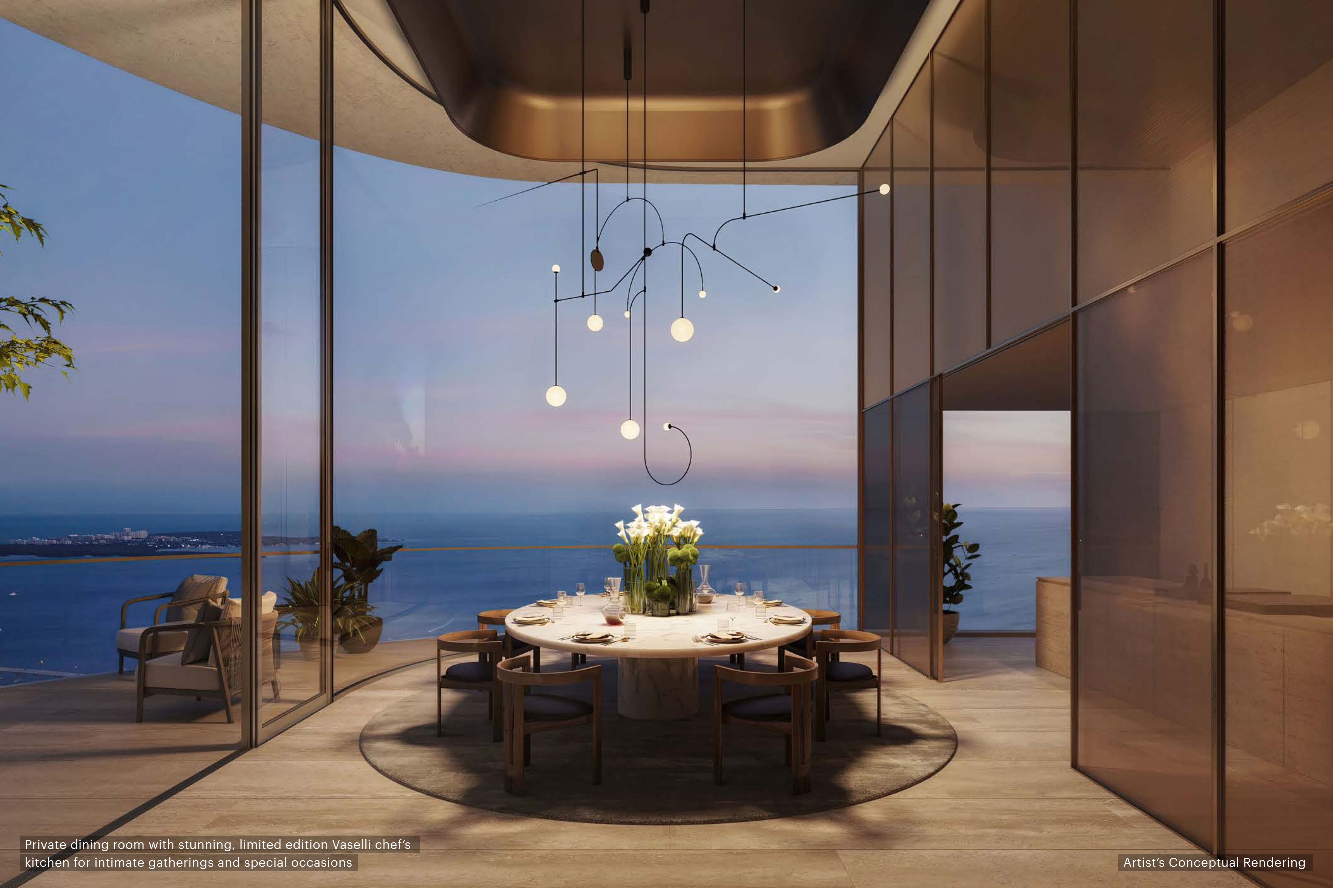
Private dining room with stunning, limited edition Vaselli chef's kitchen for intimate gatherings and special occasions