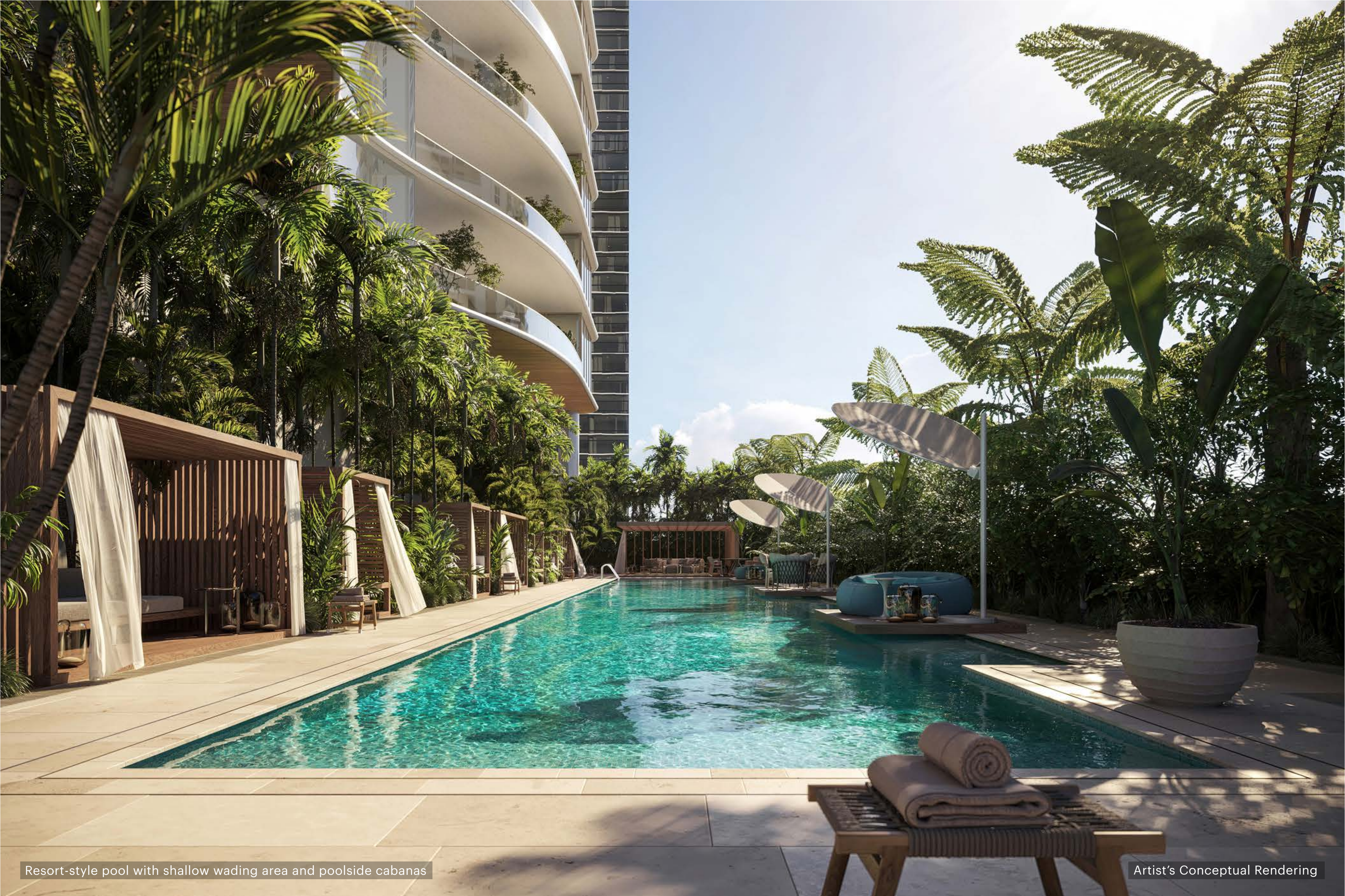
Resort-style pool with shallow wading area and poolside cabanas