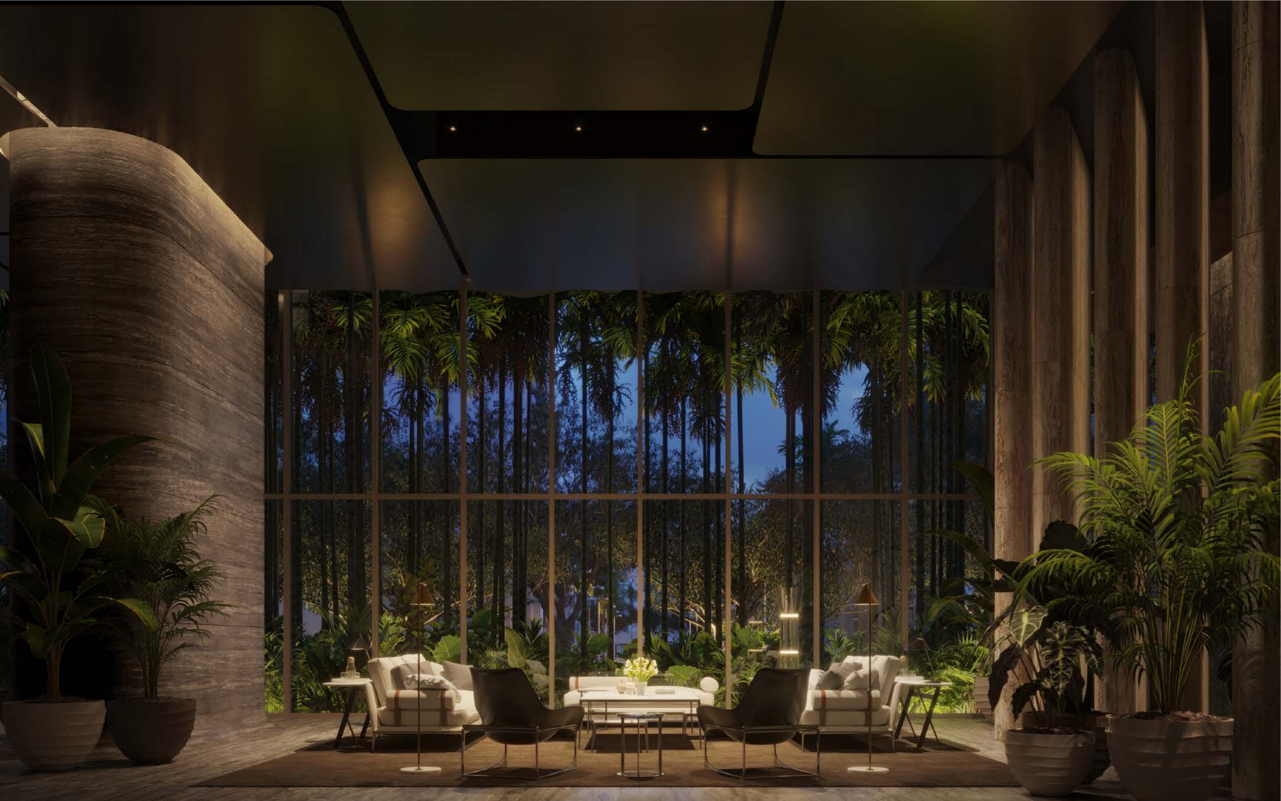
Residents And Guests Enter Through A Stunning Lobby With A Series Of Unique Spaces Including A Library Lounge And Aperitivo Bar