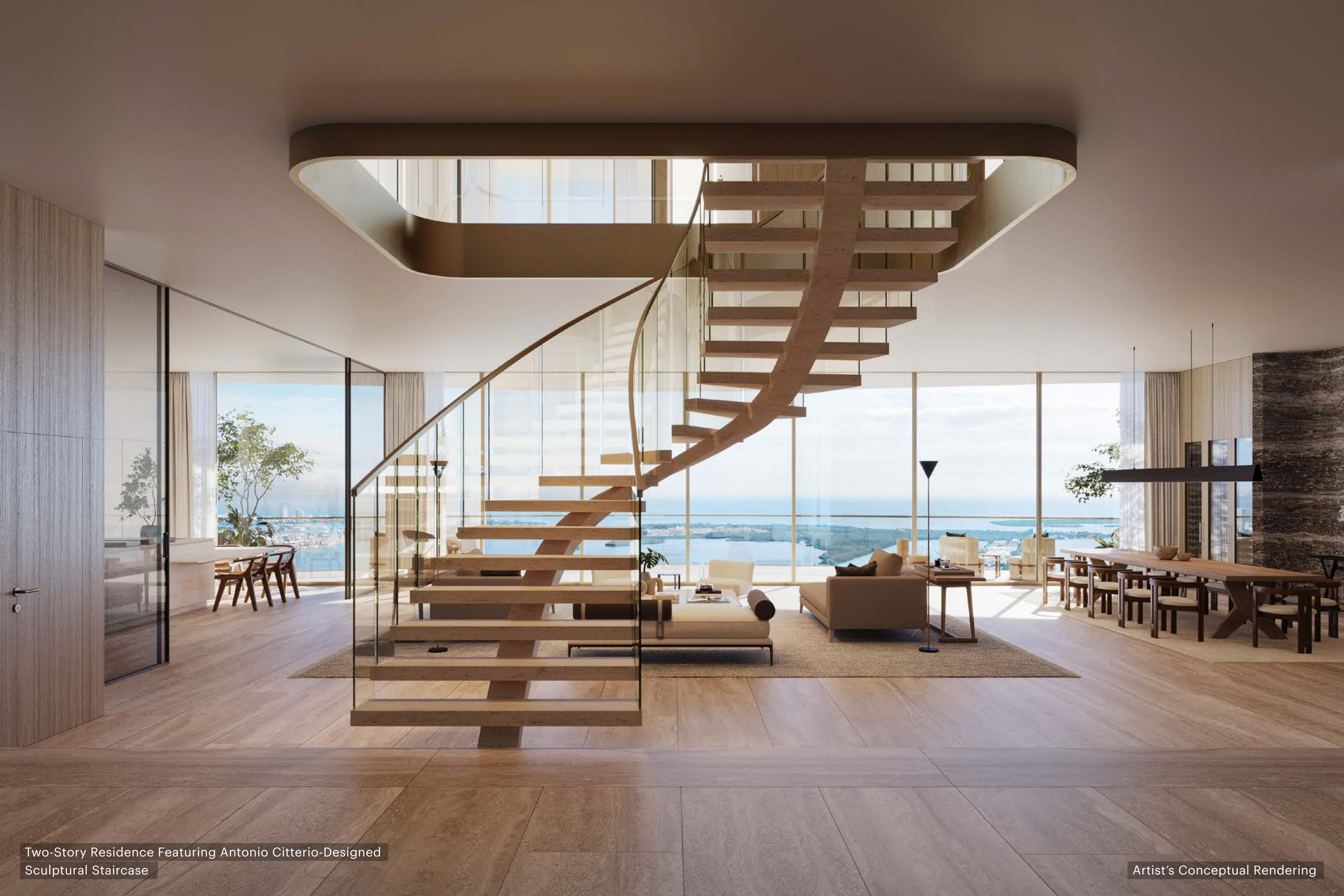
Two-Story Residence Featuring Antonio Citterio-Designed Sculptural Staircase