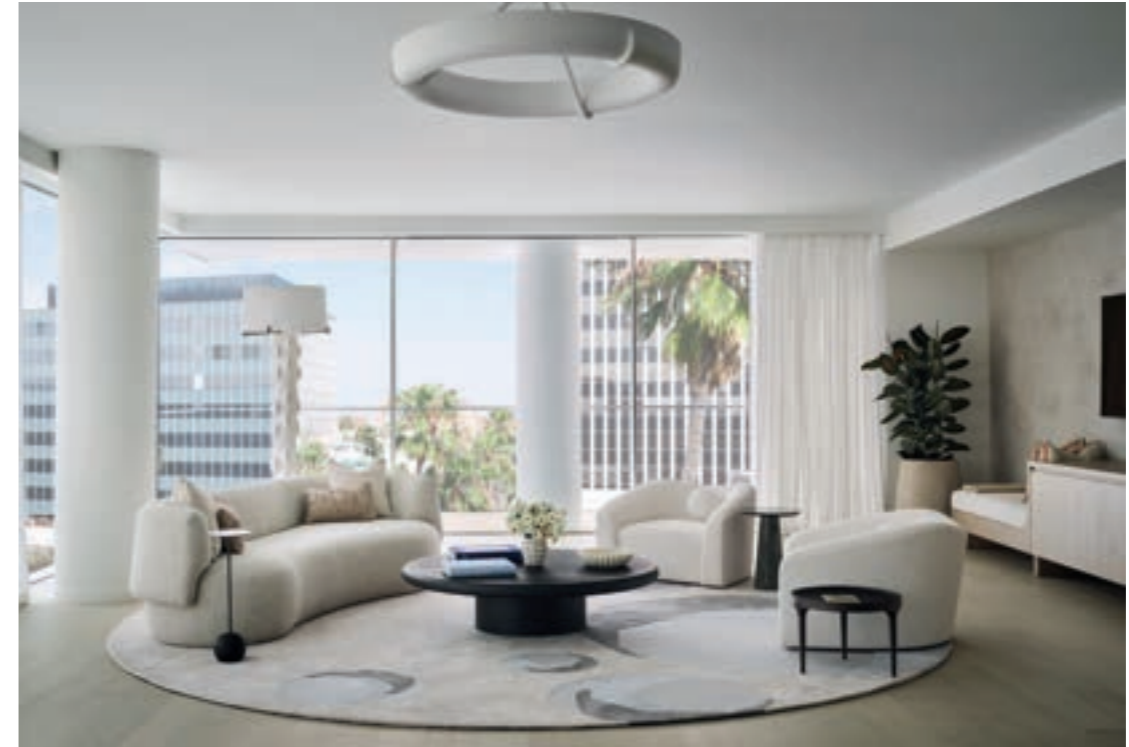
Mandarin Oriental Beverly Hills, Los Angeles USA