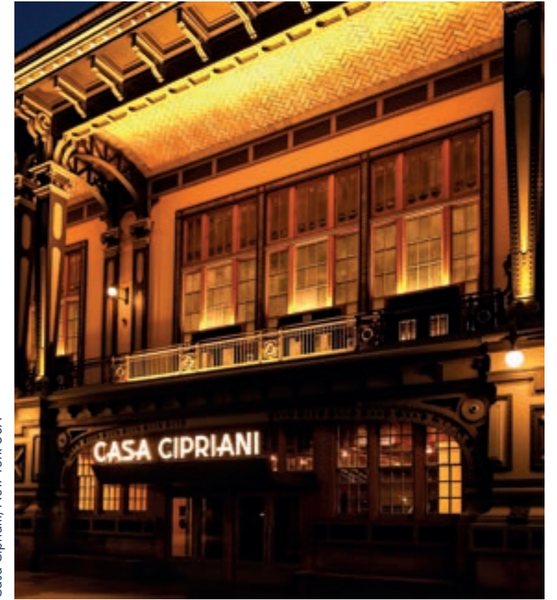
Casa Cipriani, New York USA