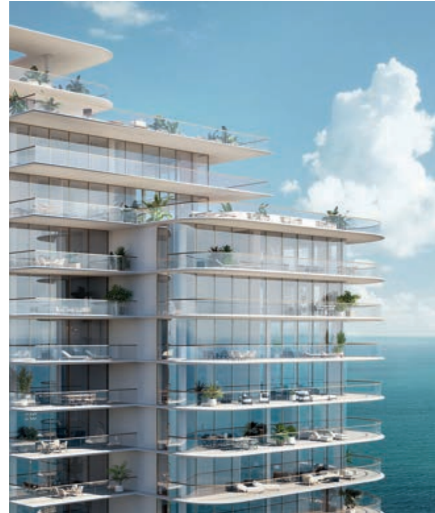
The Perigon, Miami USA