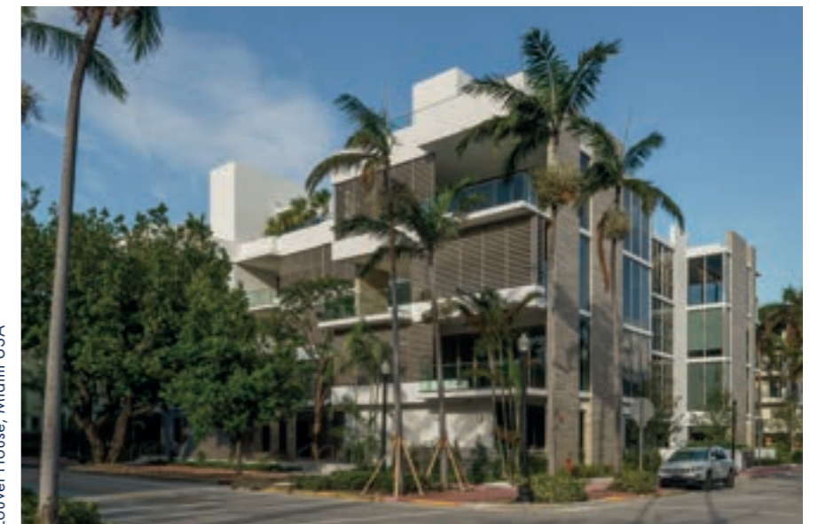
Louver House, Miami USA