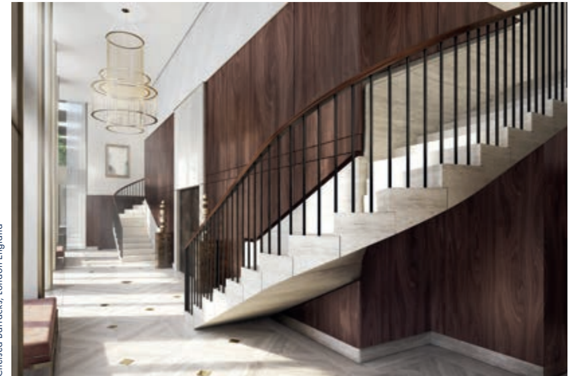
Chelsea Barracks, London England