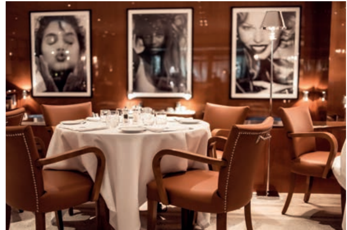
Cipriani Dubai, United Arab Emirates