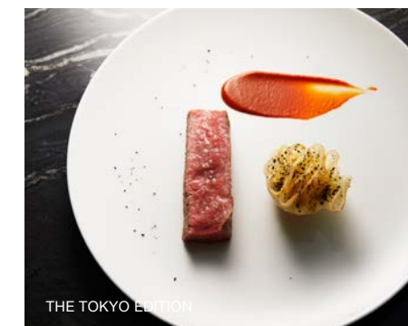
THE TOKYO EDITION