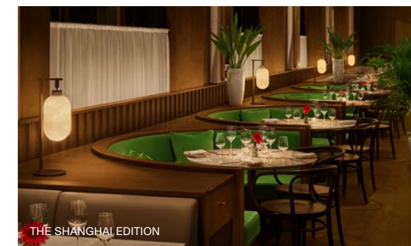
THE SHANGHAI EDITION

Envisioned by Ian Schrager and Marriott International, EDITION is a personal and unique hotel experience, and it is a collaboration that has served us and our guests well.