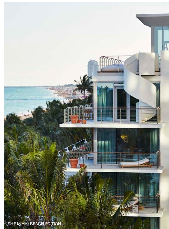
THE MIAMI BEACH EDITION

EDITION HOTELS ARE STUNNING MICROCOSMS OF THE WORLD'S TOP CITIES FEATURING THE BEST IN SERVICE, FOOD, BEVERAGE AND ENTERTAINMENT.