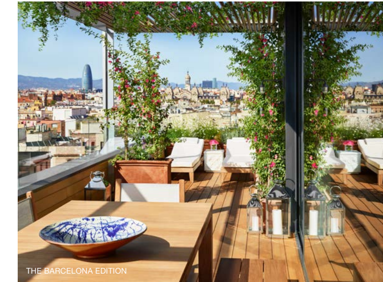
THE BARCELONA EDITION

Located in gateway cities throughout the world, these are hotels where you'll find guests rubbing elbows with locals because there's no better place to be in the moment. Hotels that feel different because they make you feel something. Hotels that don't act like hotels.