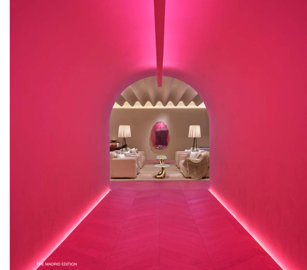
THE MADRID EDITION