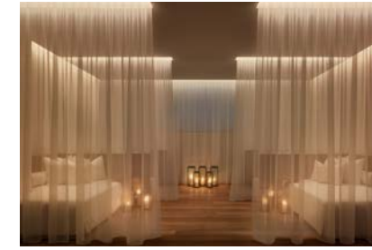
Right top to bottom: The Miami Beach EDITION Spa and The Bodrum EDITION Spa.

From artists and musicians to world-class chefs and designers, the EDITION experience is a collaboration of creativity, leaving no stone unturned to make the guest experience nuanced, enchanting, and truly memorable.