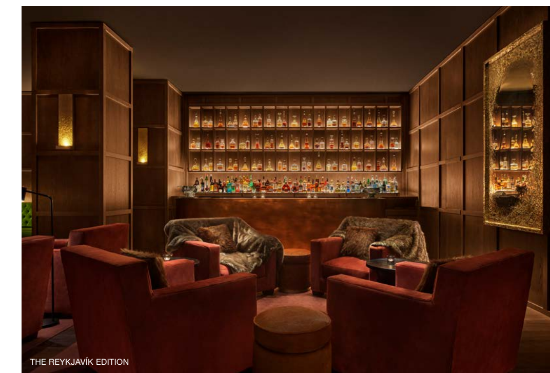
THE REYKJAVIK EDITION

Our desire is to infuse emotion into a check-in/check-out world by bringing each location to life in an intimate, seductive environment.