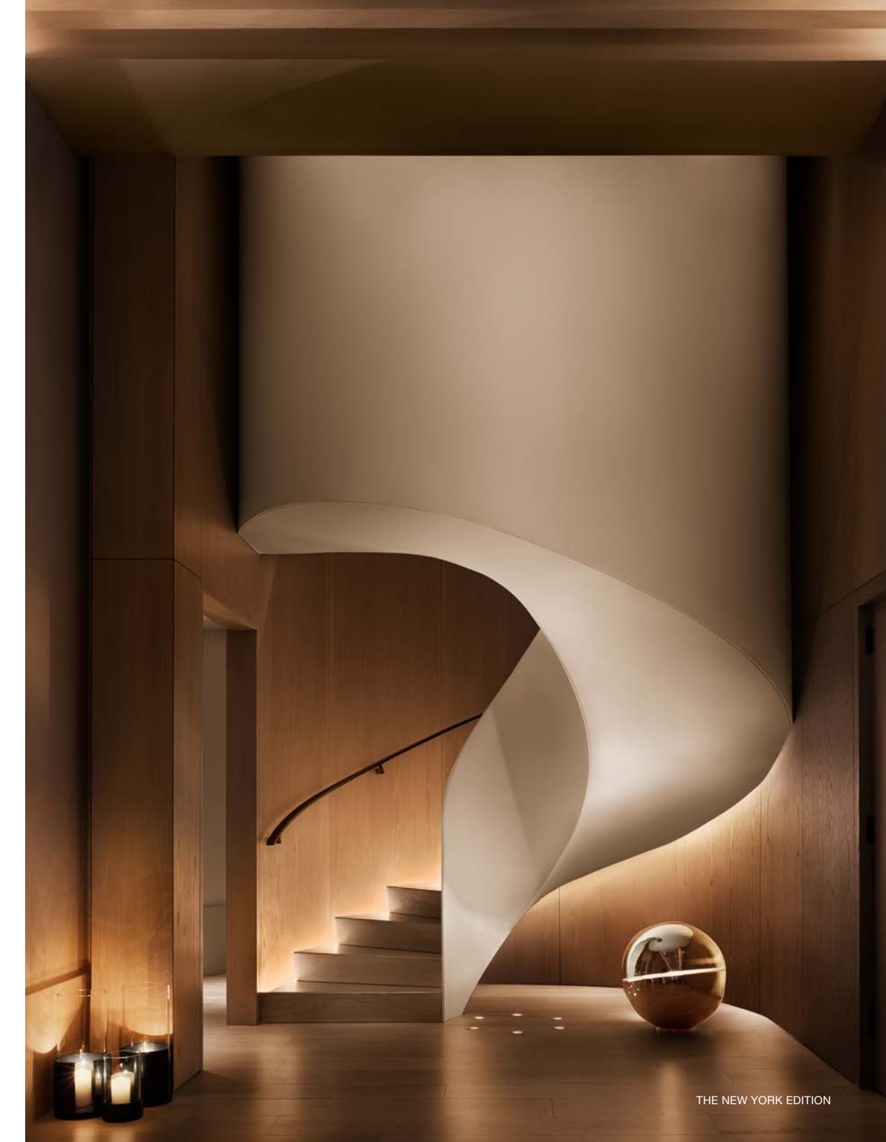
THE NEW YORK EDITION

Top: The Dubai EDITION. Cover: The West Hollywood EDITION.