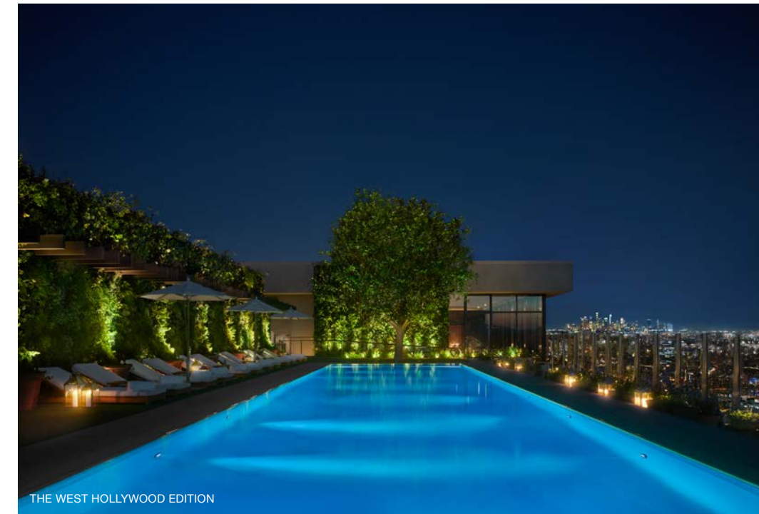
THE WEST HOLLYWOOD EDITION