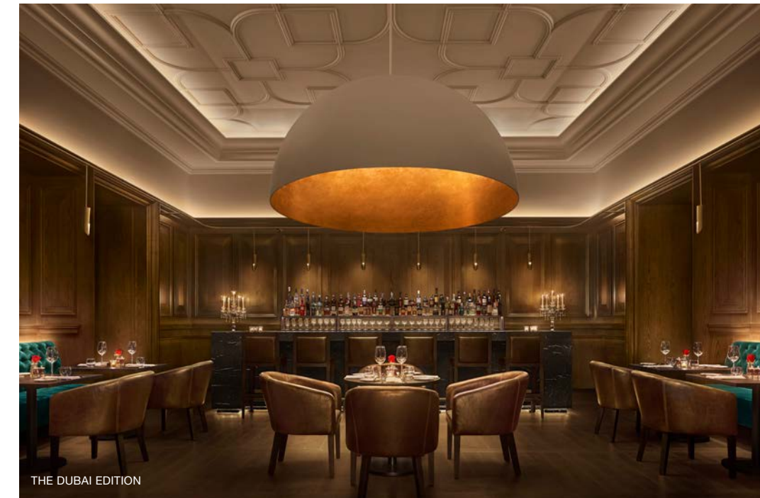
THE DUBAI EDITION