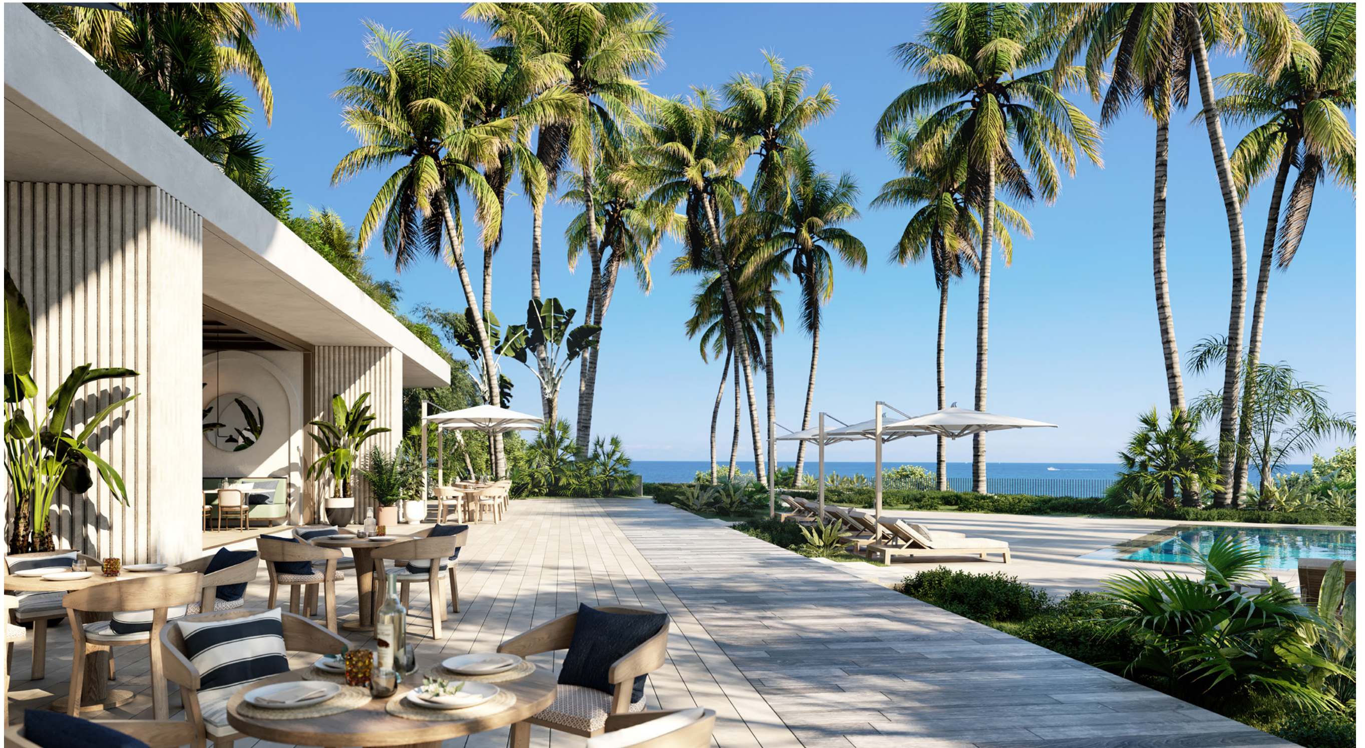
The oceanfront Restaurant is an exclusive enclave for residents and their guests