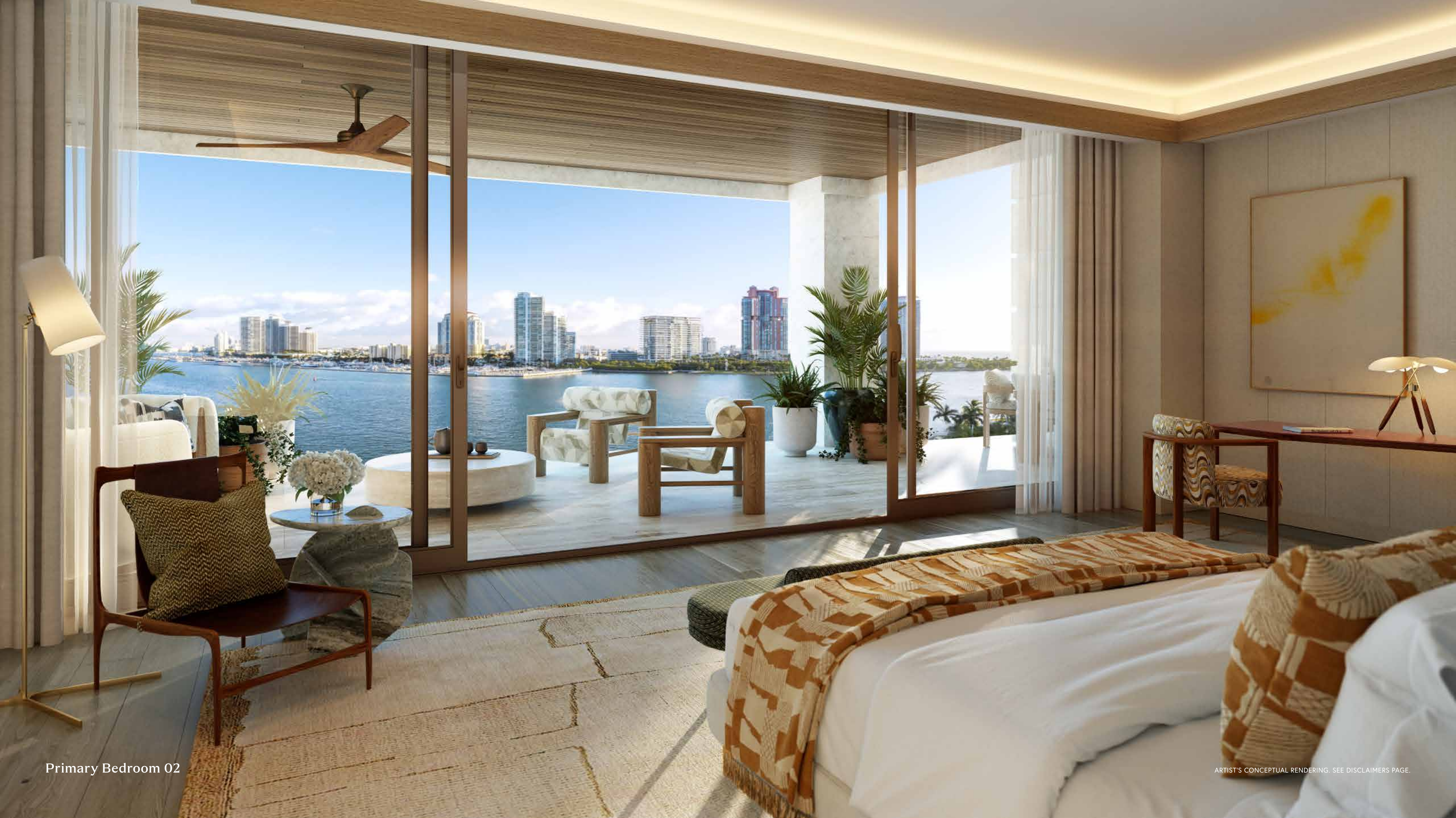
Primary Bedroom 02

ARTIST'S CONCEPTUAL RENDERING. SEE DISCLAIMERS PAGE.