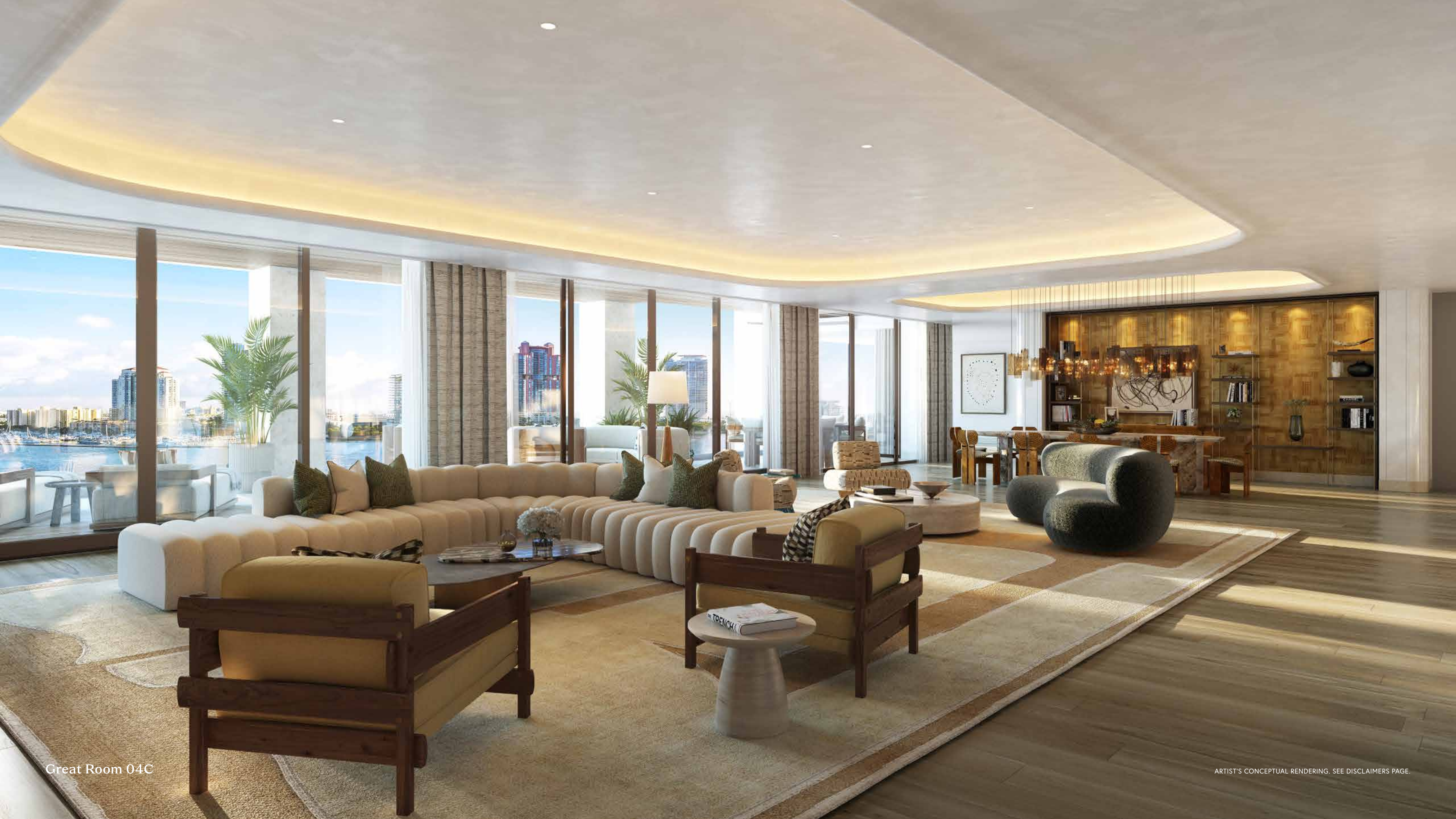
Great Room 04C