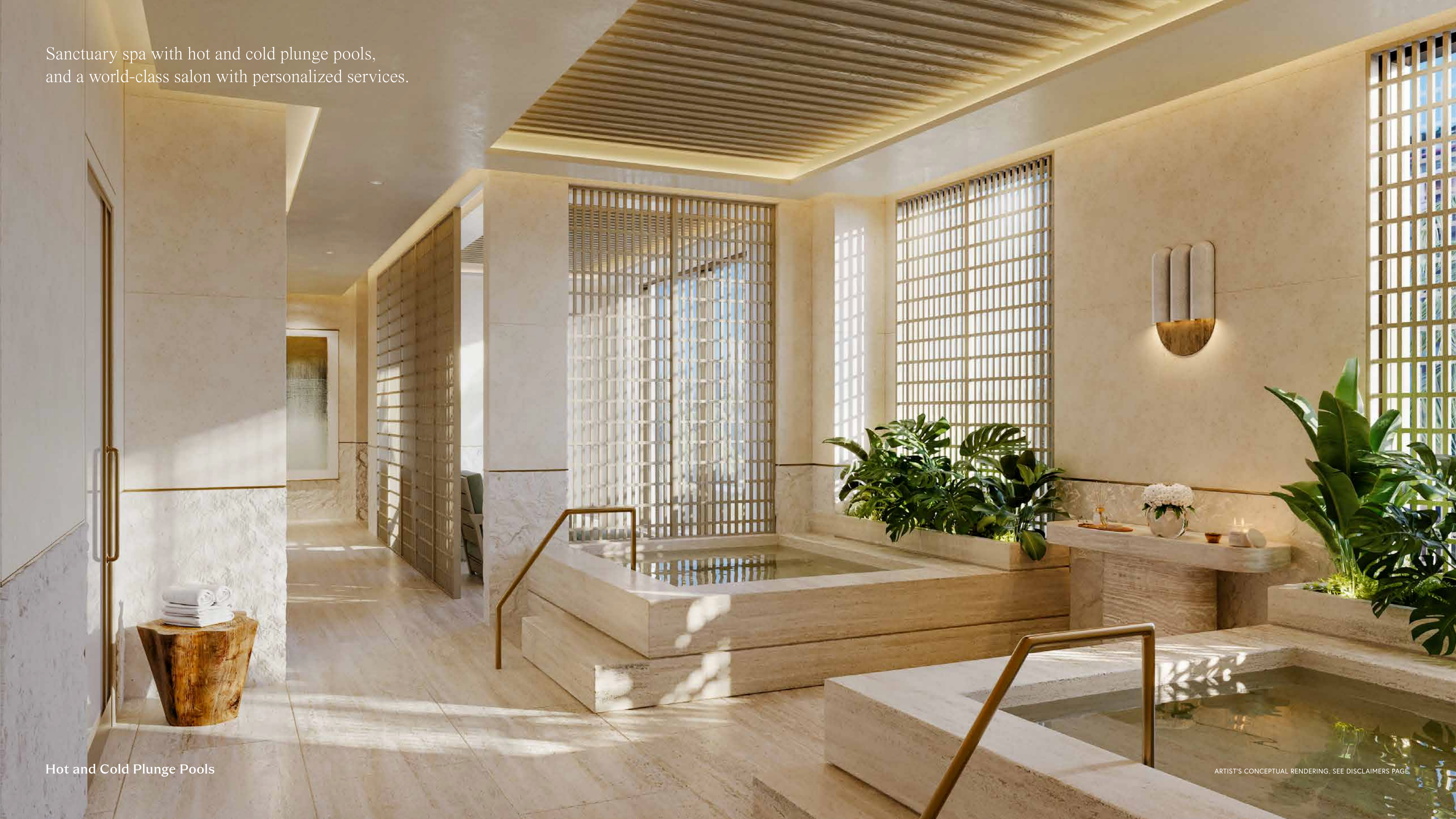
Hot and Cold Plunge Pools

Sanctuary spa with hot and cold plunge pools, and a world-class salon with personalized services.