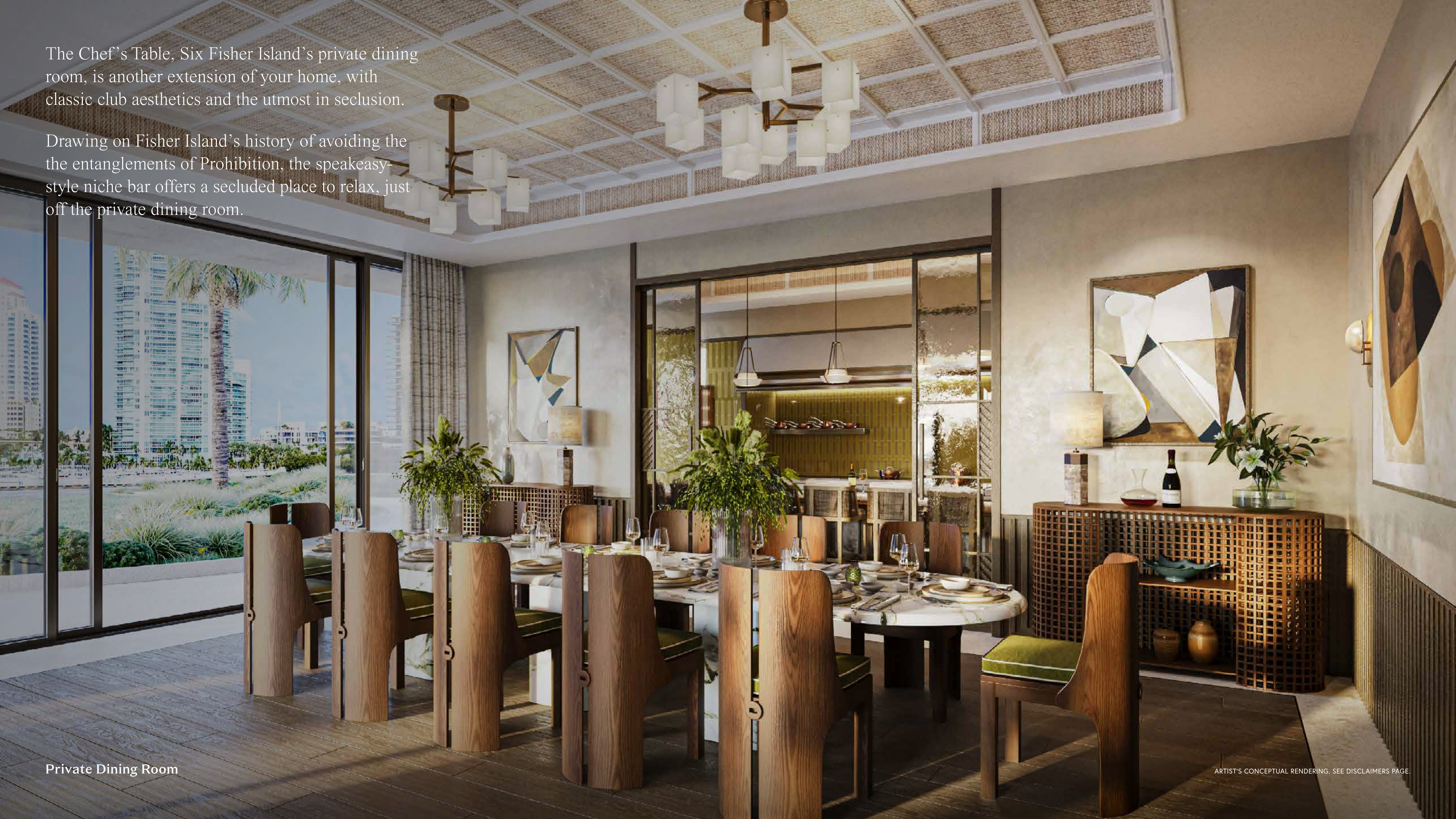
Private Dining Room

Drawing on Fisher Island's history of avoiding the the entanglements of Prohibition, the speakeasy-style niche bar offers a secluded place to relax, just off the private dining room.