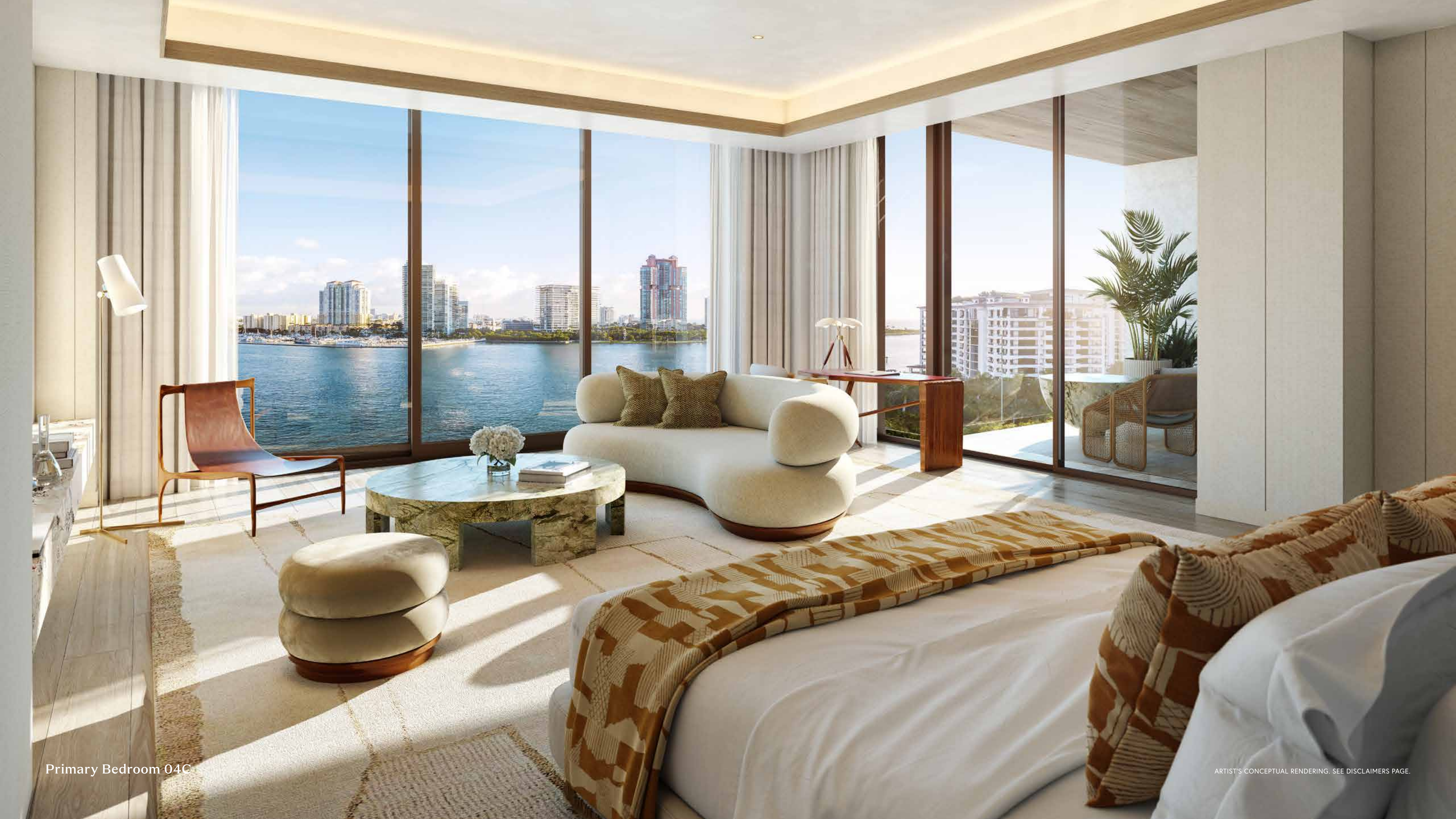
Primary Bedroom 04C

ARTIST'S CONCEPTUAL RENDERING. SEE DISCLAIMERS PAGE.