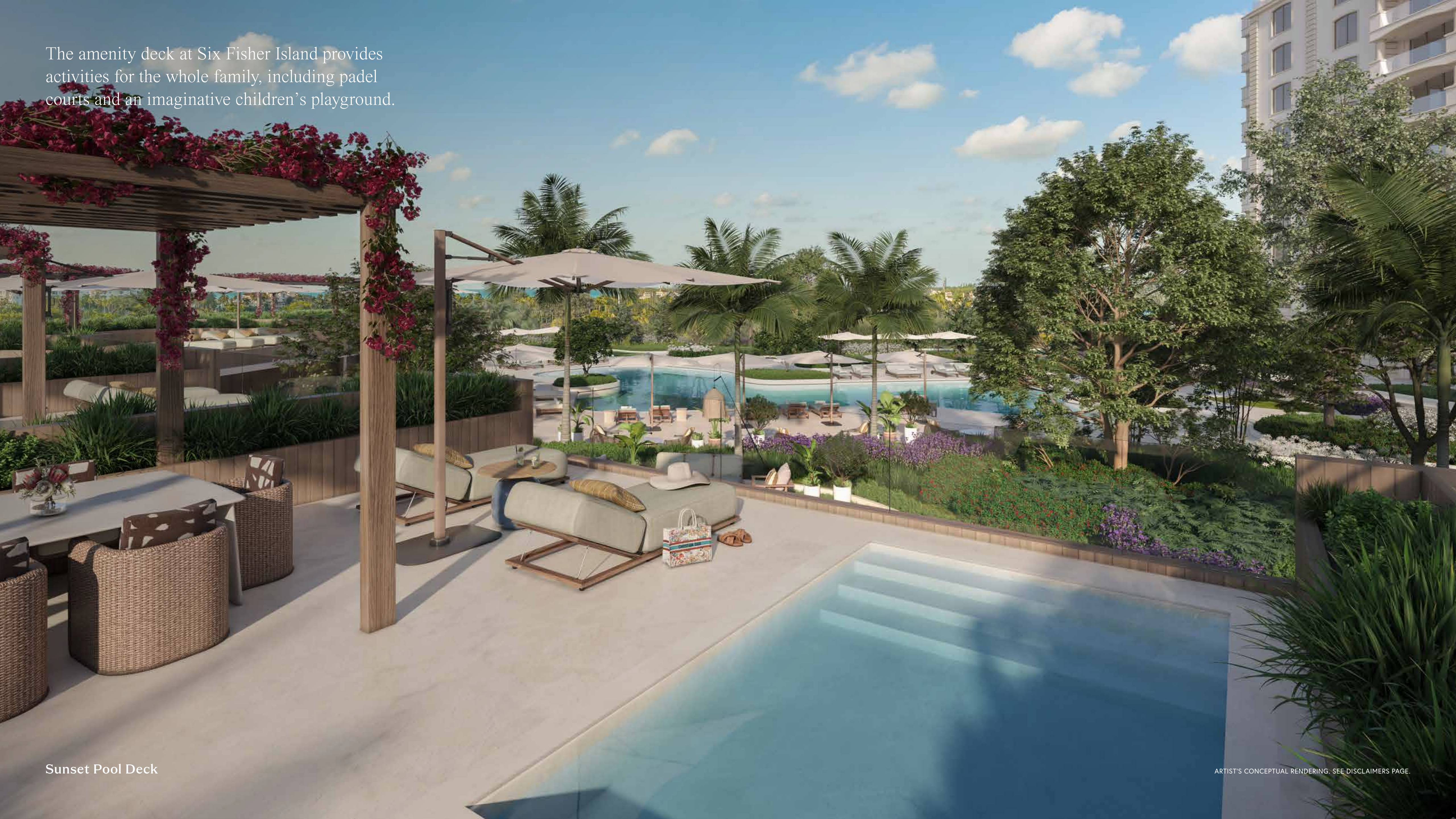
Sunset Pool Deck

The amenity deck at Six Fisher Island provides activities for the whole family, including padel courts and an imaginative children's playground.