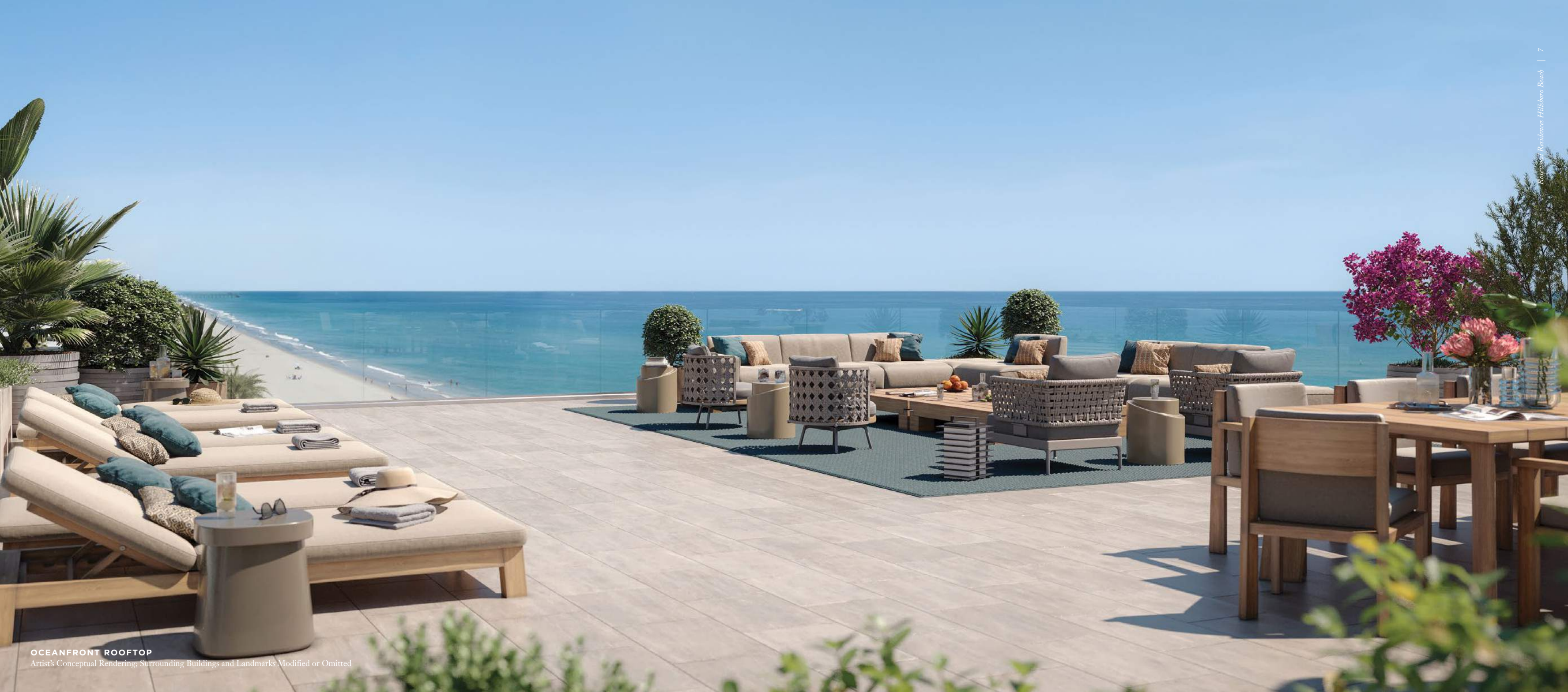
OCEANFRONT ROOFTOP Artist's Conceptual Rendering; Surrounding Buildings and Landmarks Modified or Omitted