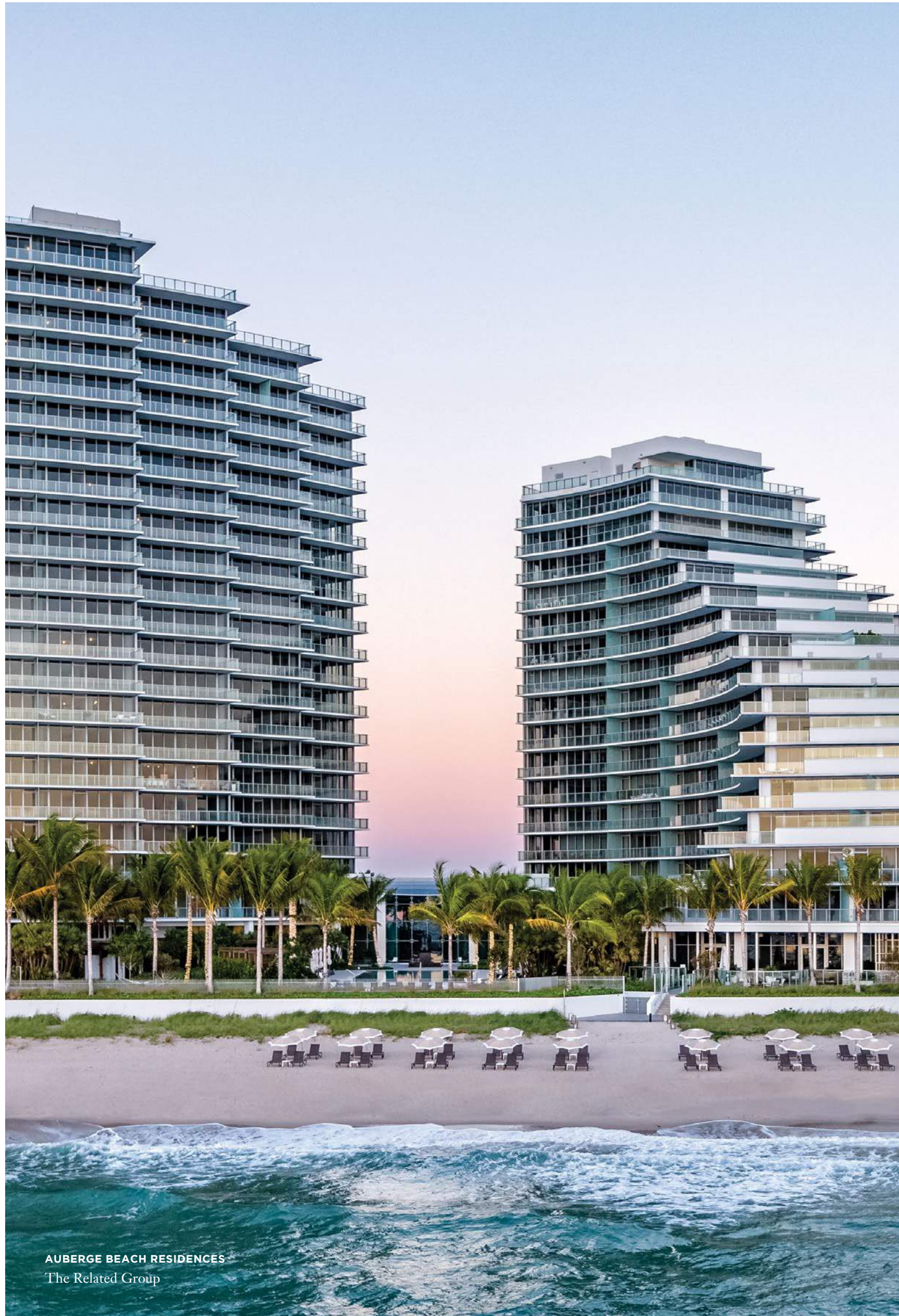
AUBERGE BEACH RESIDENCES The Related Group