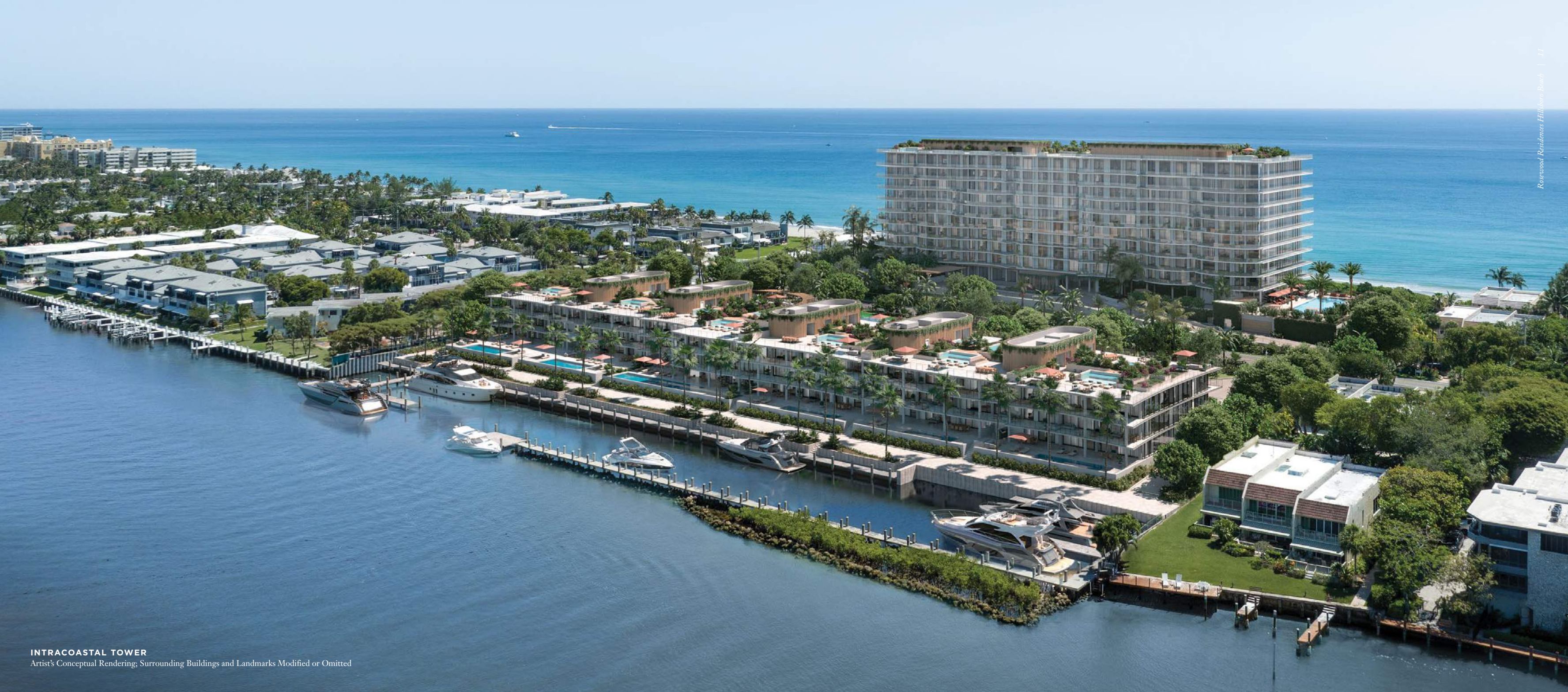
INTRACOASTAL TOWER Artist's Conceptual Rendering; Surrounding Buildings and Landmarks Modified or Omitted