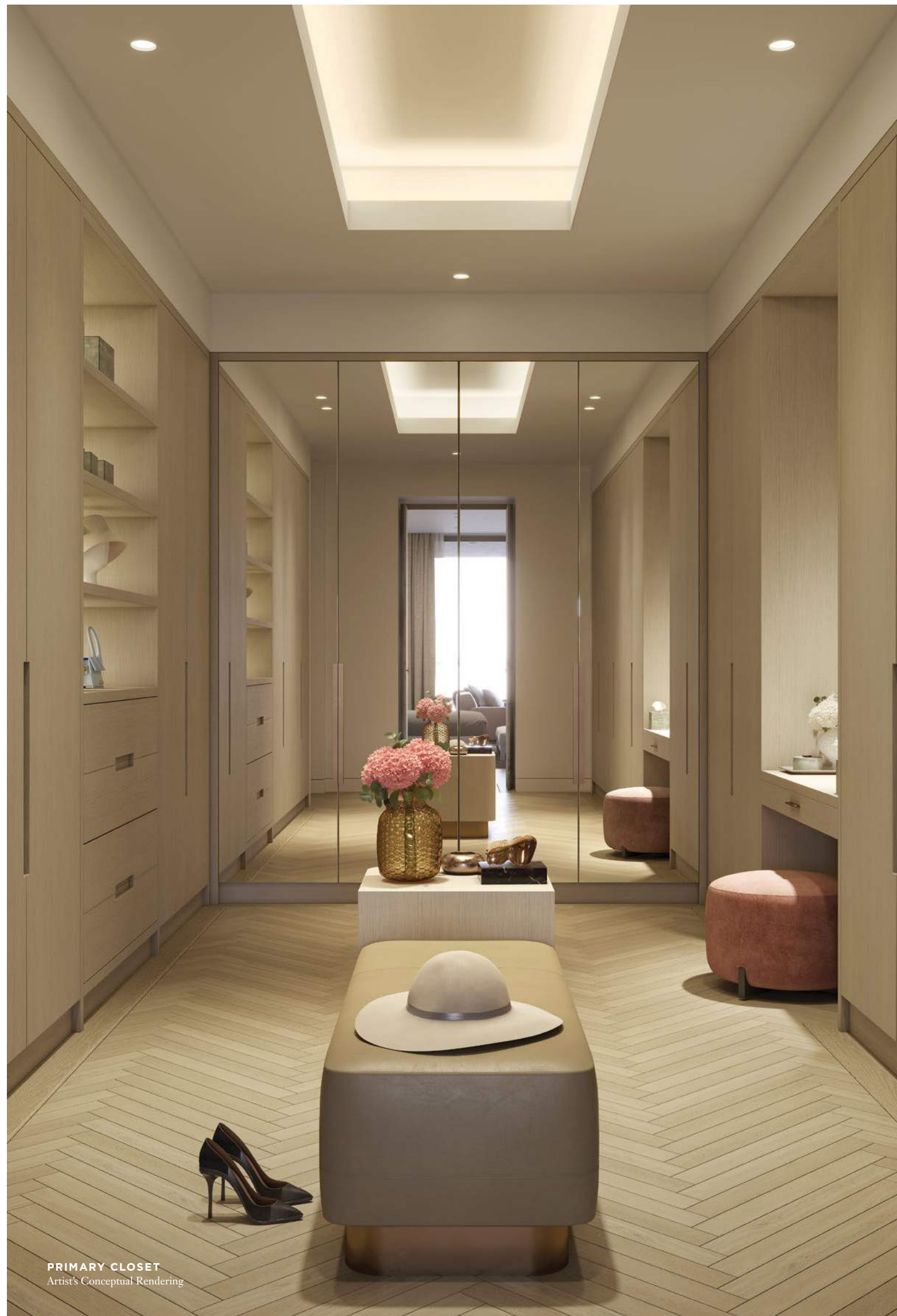
PRIMARY CLOSET Artist's Conceptual Rendering