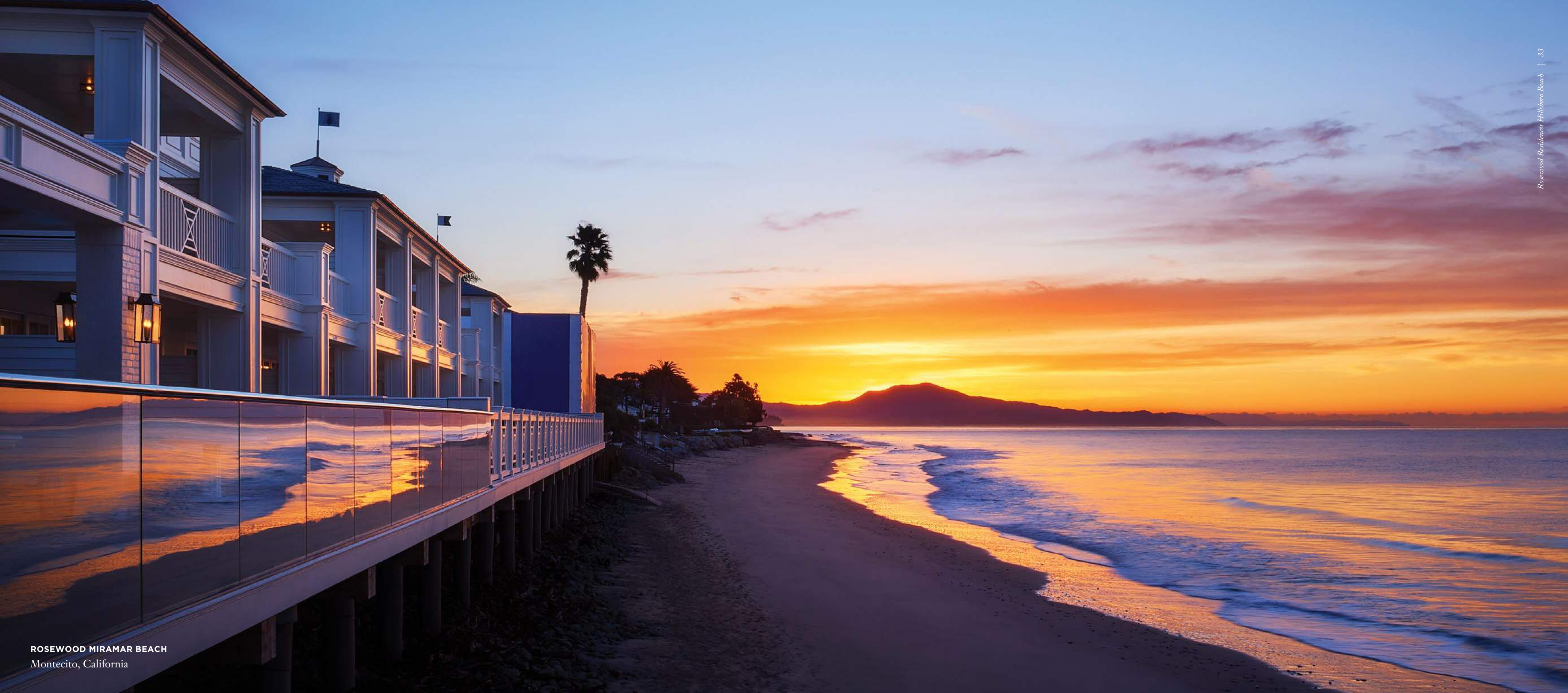
ROSEWOOD MIRAMAR BEACH Montecito, California