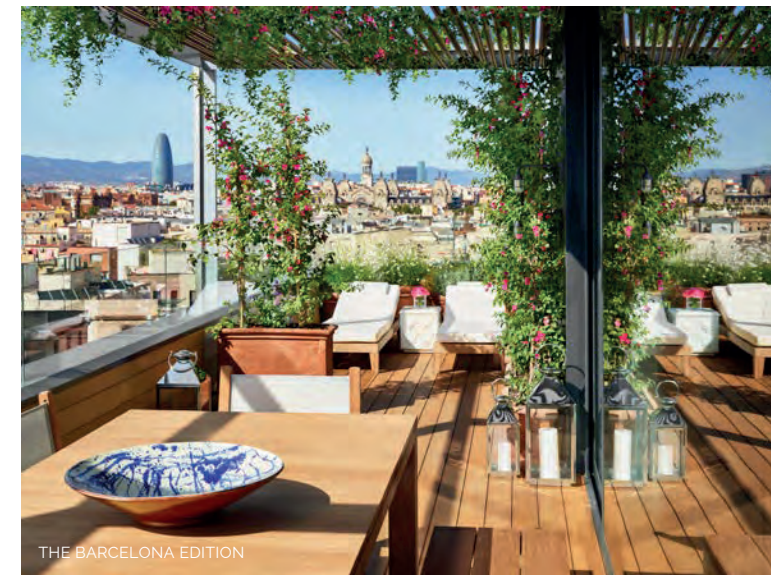
THE BARCELONA EDITION