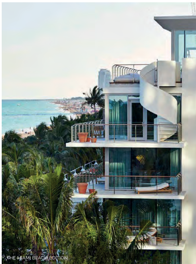
THE MIAMI BEACH EDITION

EDITION HOTELS ARE STUNNING MICROCOSMS OF THE WORLD'S TOP CITIES FEATURING THE BEST IN SERVICE, FOOD, BEVERAGE AND ENTERTAINMENT.