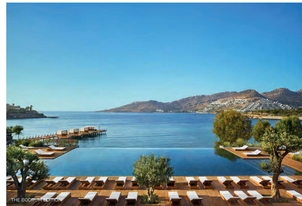
THE BODRUM EDITION

Located in gateway cities throughout the world, these are hotels where you'll find guests rubbing elbows with locals because there's no better place to be in the moment. Hotels that feel different because they make you feel something. Hotels that don't act like hotels.