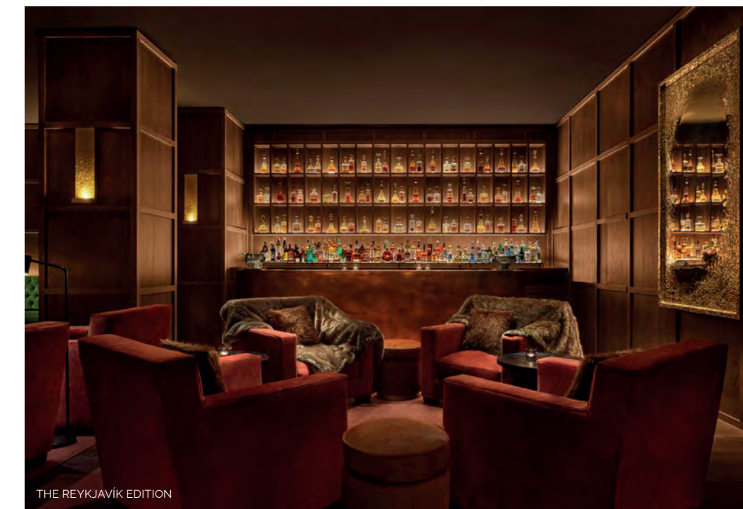
THE REYKJAVIK EDITION