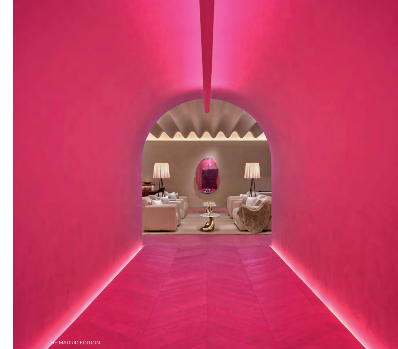
THE MADRID EDITION