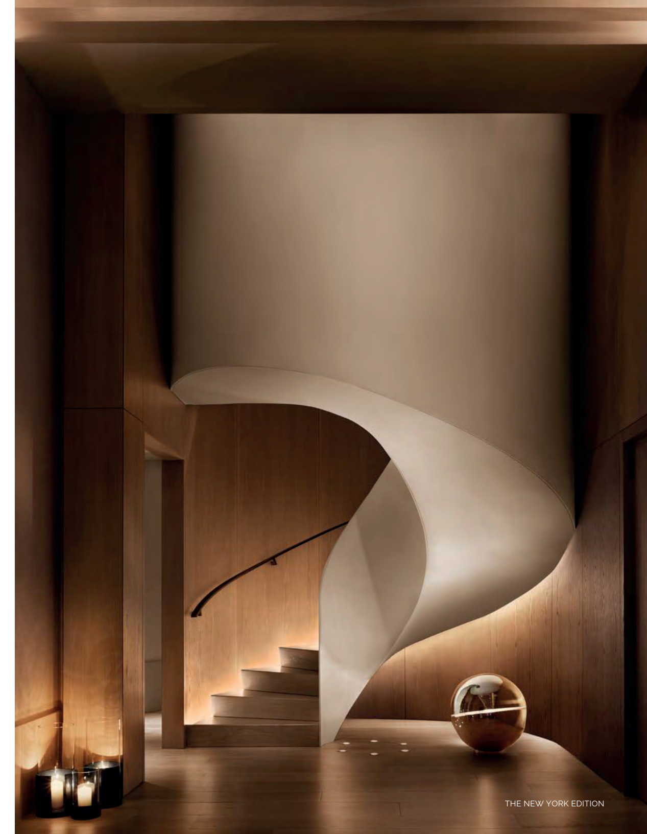
THE NEW YORK EDITION

Top: The Dubai EDITION. Cover: The West Hollywood EDITION.