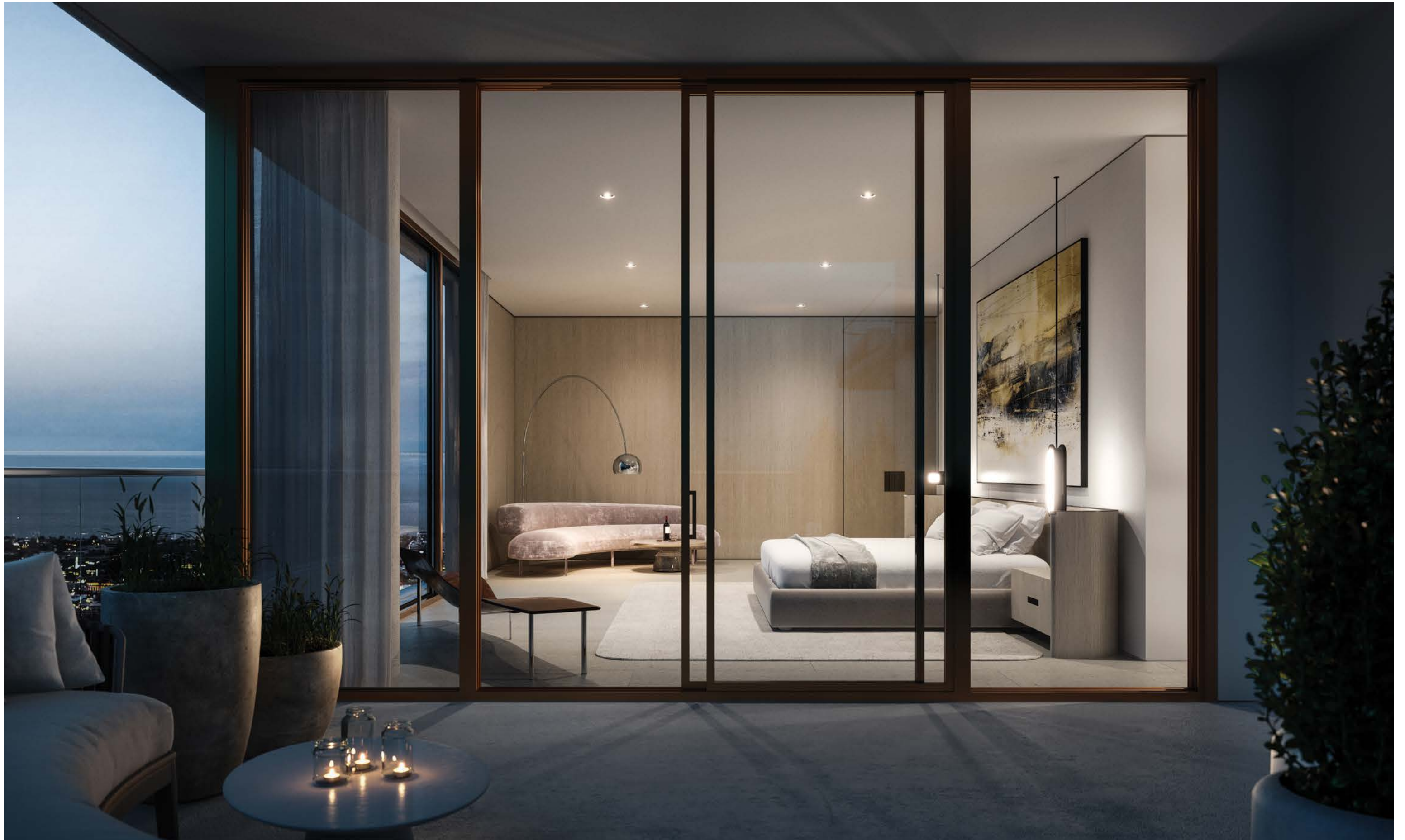
Master Bedroom and Private Terrace

Illustration is artist's concept. Sizes, areas and specifications are subject to change without notice. E. & O. E. See Legal Disclaimers on Final Page.