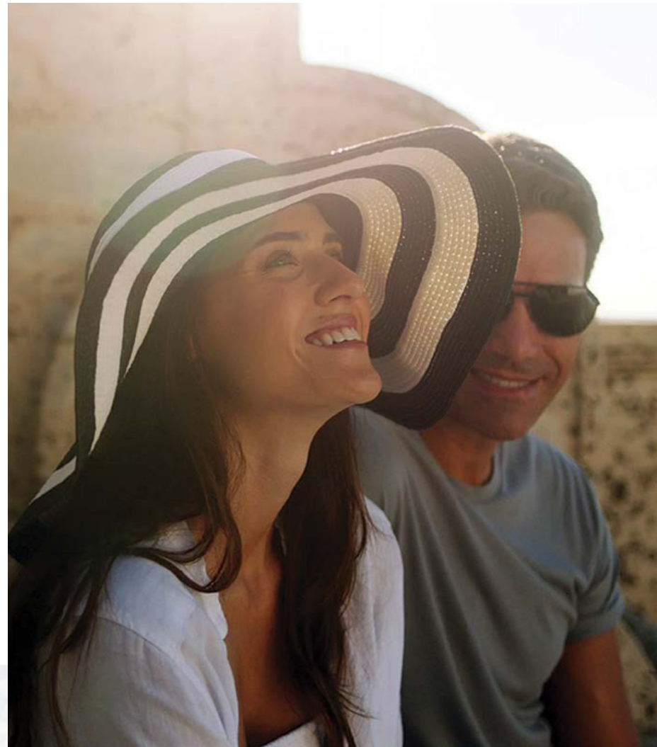
Archway off Worth Avenue

NON-STOP FLIGHTS TO DOZENS OF MAJOR CITIES ACROSS NORTH AMERICA MAKE PALM BEACH ONE OF THE MOST ACCESSIBLE WARM WEATHER DESTINATIONS.