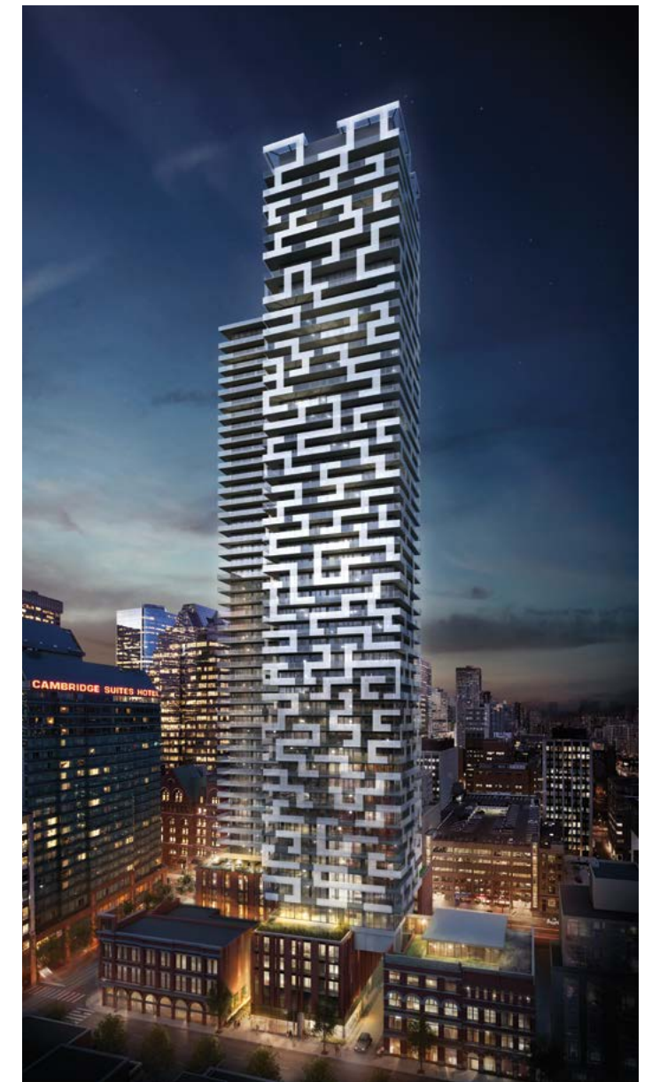
Yonge + Rich