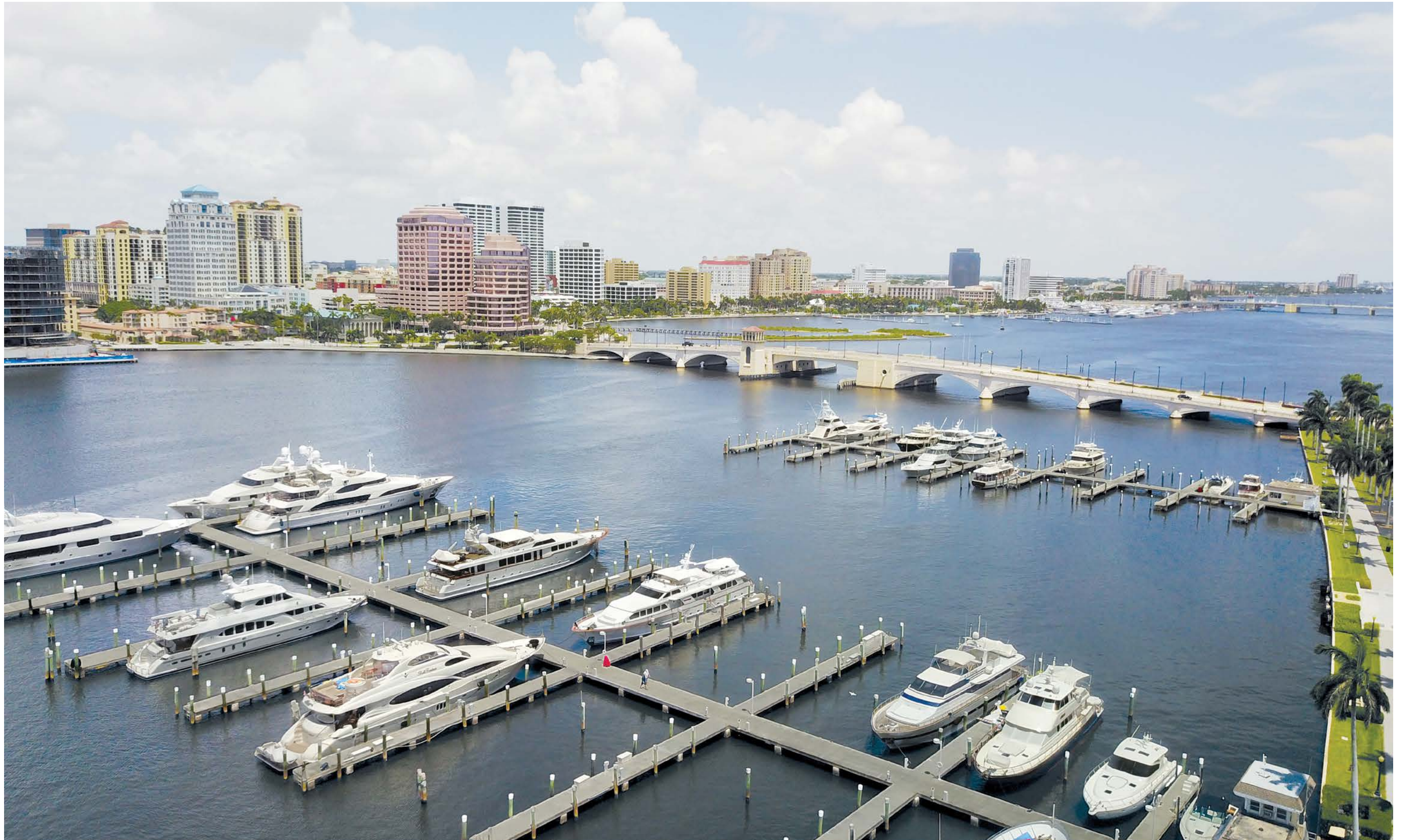
Atlantic Waterway Marina See Legal Disclaimers on Final Page.