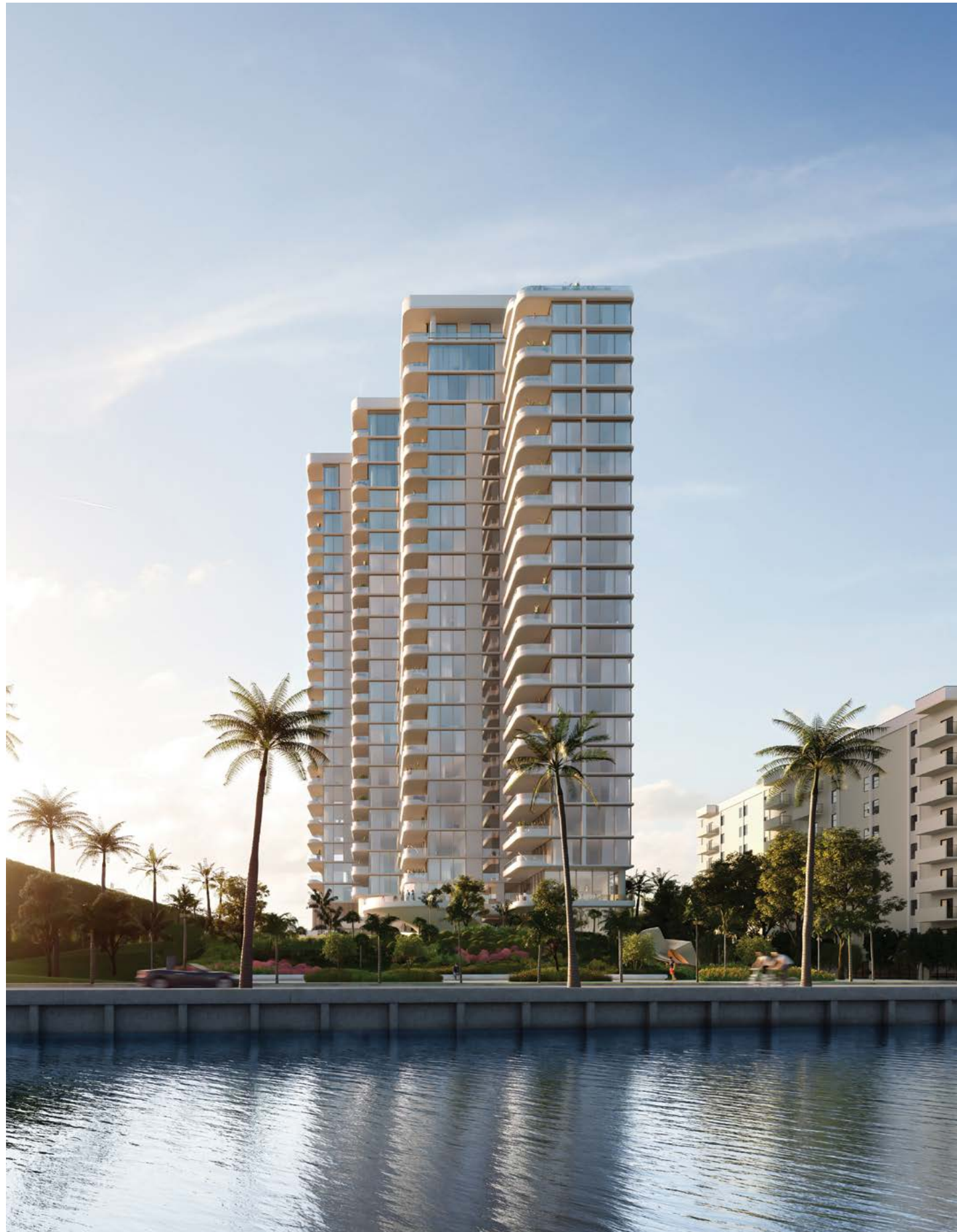
La Clara from Eastern View Illustration is artist's concept. E. & O. E. See Legal Disclaimers on Final Page.