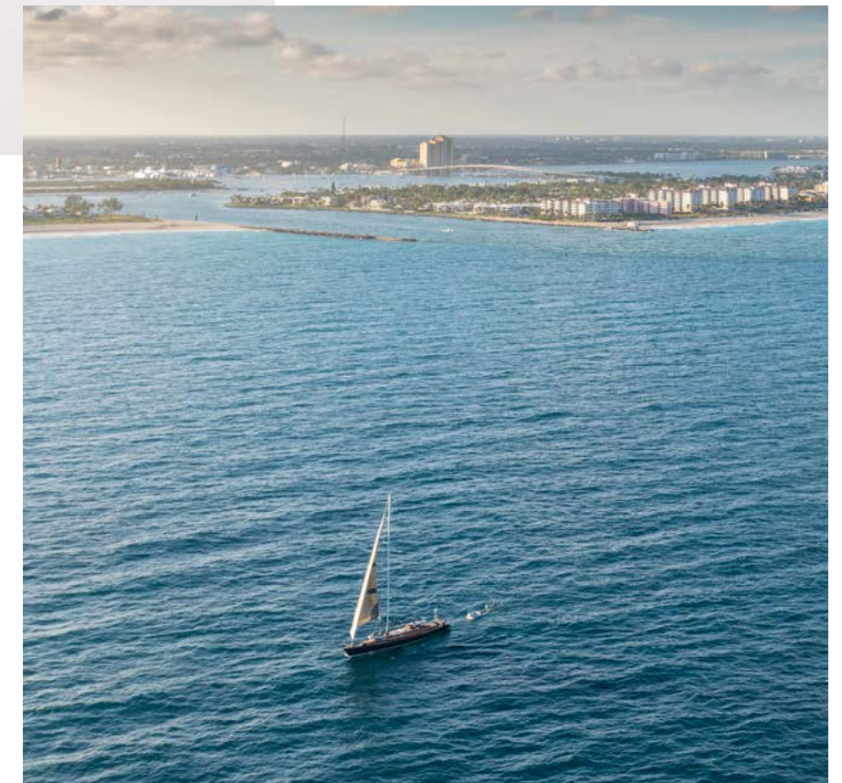
Atlantic Ocean and Intracoastal Waterway

AWARD-WINNING YACHT CLUBS NEAR LA CLARA INCLUDE THE PALM BEACH YACHT CLUB AND THE SAILFISH CLUB OF FLORIDA. ADDITIONALLY, THE PALM BEACH SAILING CLUB OFFERS SAILING COURSES AND HOSTS REGATTAS THROUGHOUT THE YEAR.