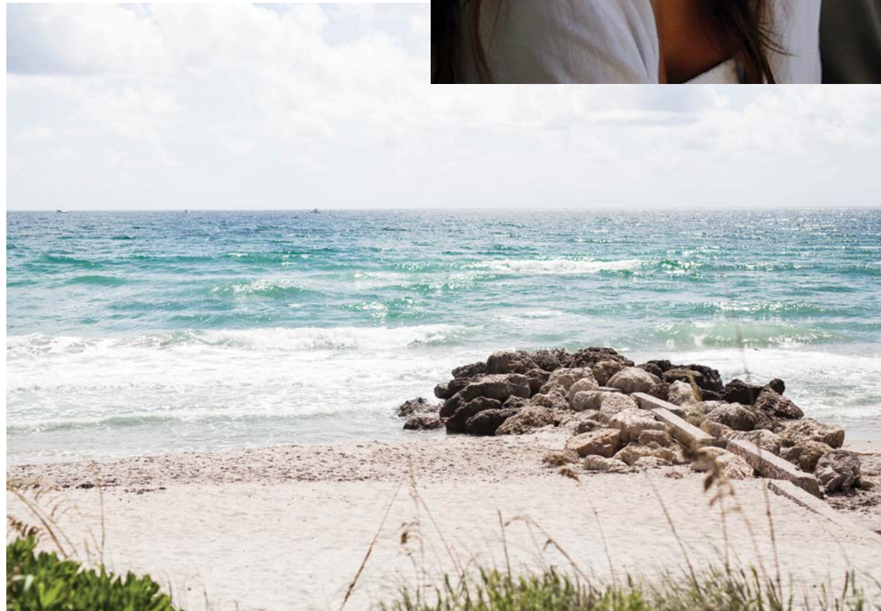
Palm Beach See Legal Disclaimers on Final Page.

NON-STOP FLIGHTS TO DOZENS OF MAJOR CITIES ACROSS NORTH AMERICA MAKE PALM BEACH ONE OF THE MOST ACCESSIBLE WARM WEATHER DESTINATIONS.