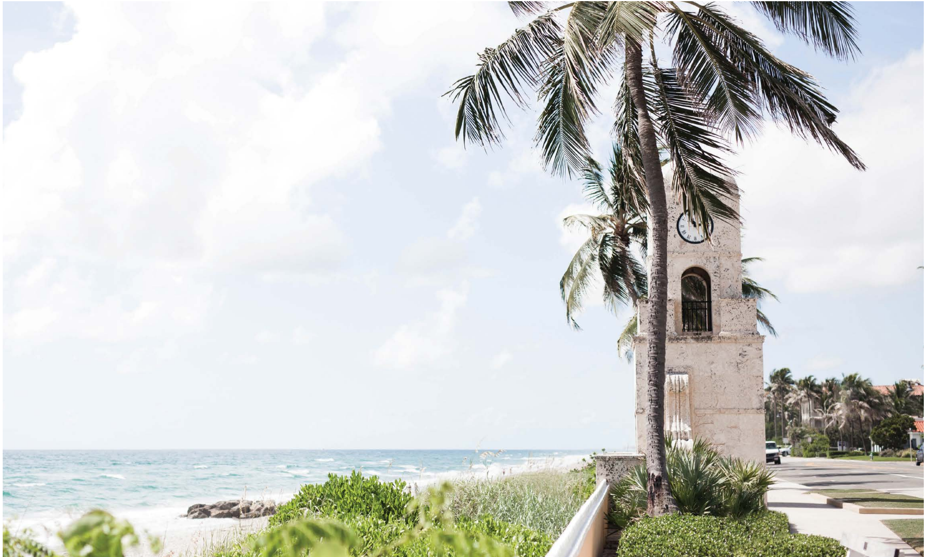
Clock Tower at the End of Worth Avenue See Legal Disclaimers on Final Page.