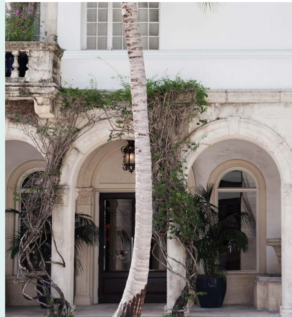
Storefronts on Worth Avenue