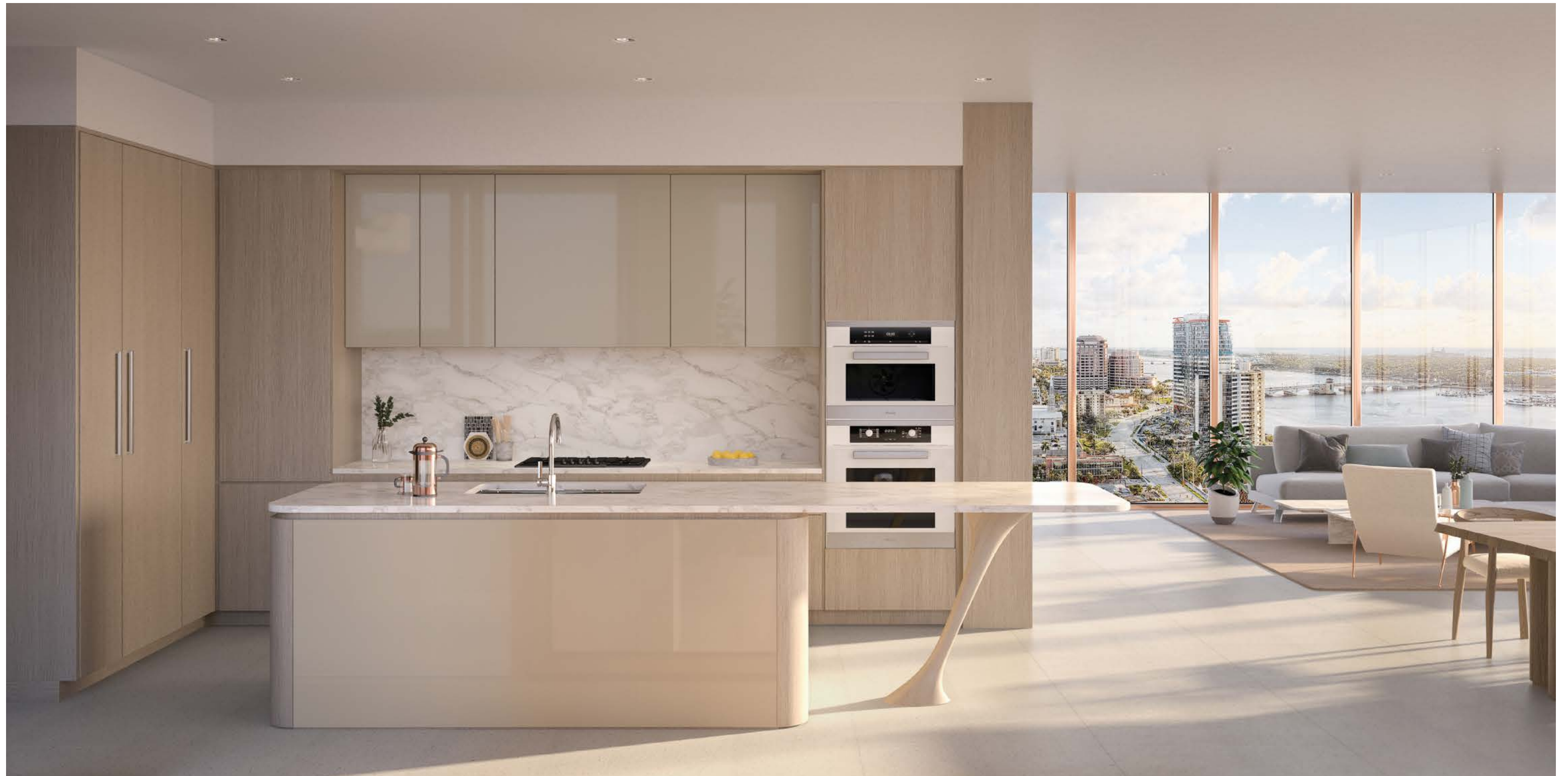
Elegantly Designed Chef's Kitchen by Snaidero with Miele Appliances

Illustration is artist's concept. Sizes, areas and specifications are subject to change without notice. E. & O. E. See Legal Disclaimers on Final Page.