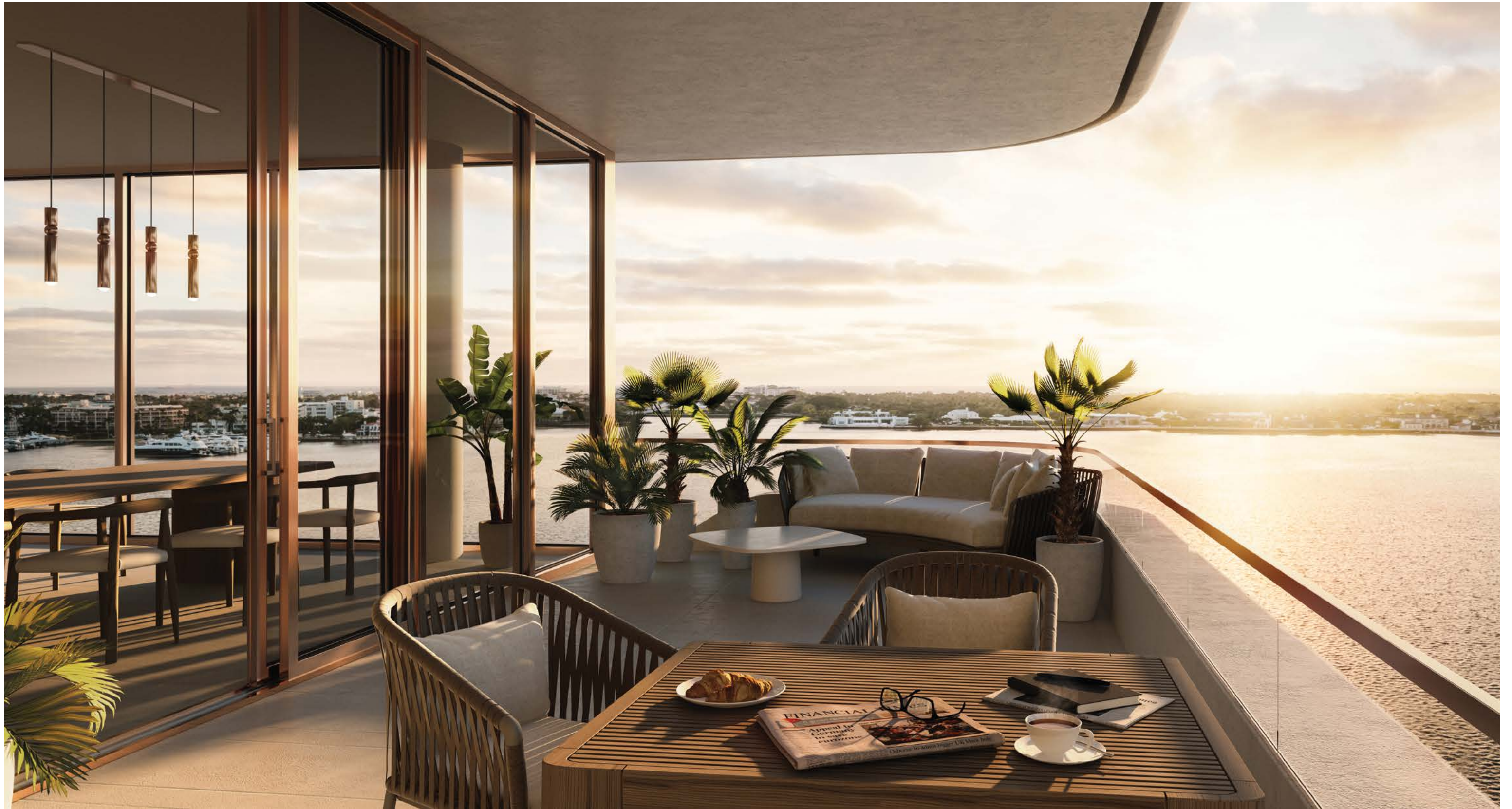
Terrace View from 23rd Floor at Sunrise

Illustration is artist's concept. Sizes, areas and specifications are subject to change without notice. E. & O. E. See Legal Disclaimers on Final Page.