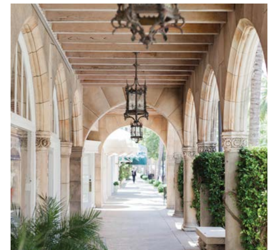
Arcade of Arches on Worth Avenue

FROM WATERFRONT DINING TO AFTERNOON STROLLS ALONG PALM-FRINGED STREETS, THE PALM BEACHES OFFER AN IDYLIC BACKDROP TO BE WITH FRIENDS AND FAMILY, OR TO REFRESH AND RESTORE.