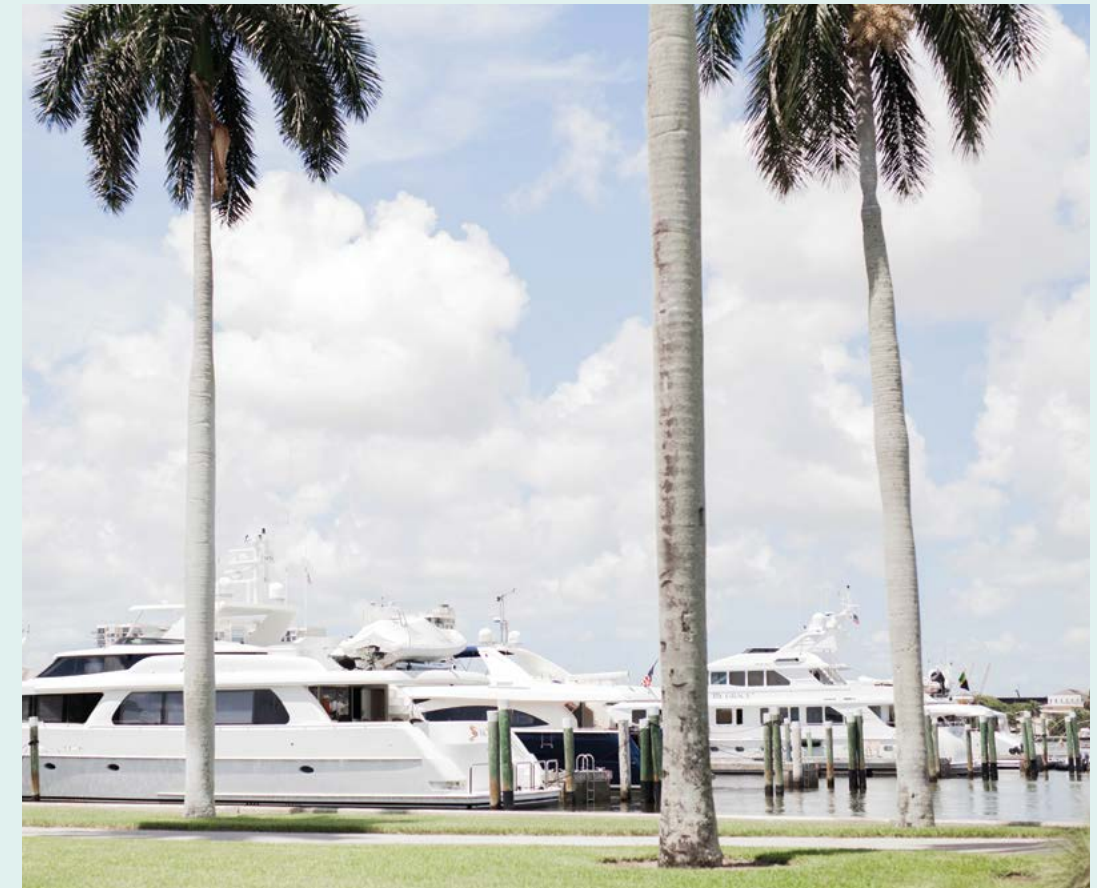
Marina on the Intracoastal Waterway

PALM BEACH IS A PLACE WHERE EVERY SEASON HERALDS THE ARRIVAL OF HIGHLY ANTICIPATED EVENTS AS WELL AS DELICIOUS HARVESTS FROM LAND AND SEA