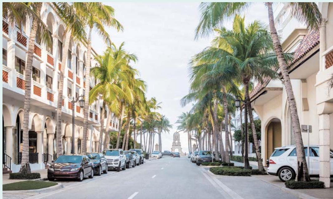
Worth Avenue and Clock Tower

DIVIDED ONLY BY THE TURQUOISE BLUE RIBBON OF THE INTRACOASTAL WATERWAY, PALM BEACH AND WEST PALM BEACH TOGETHER OFFER A DELIGHTFUL ARRAY OF PLACES TO DRINK, DINE, SHOP, AND RELAX TO YOUR HEART'S DELIGHT