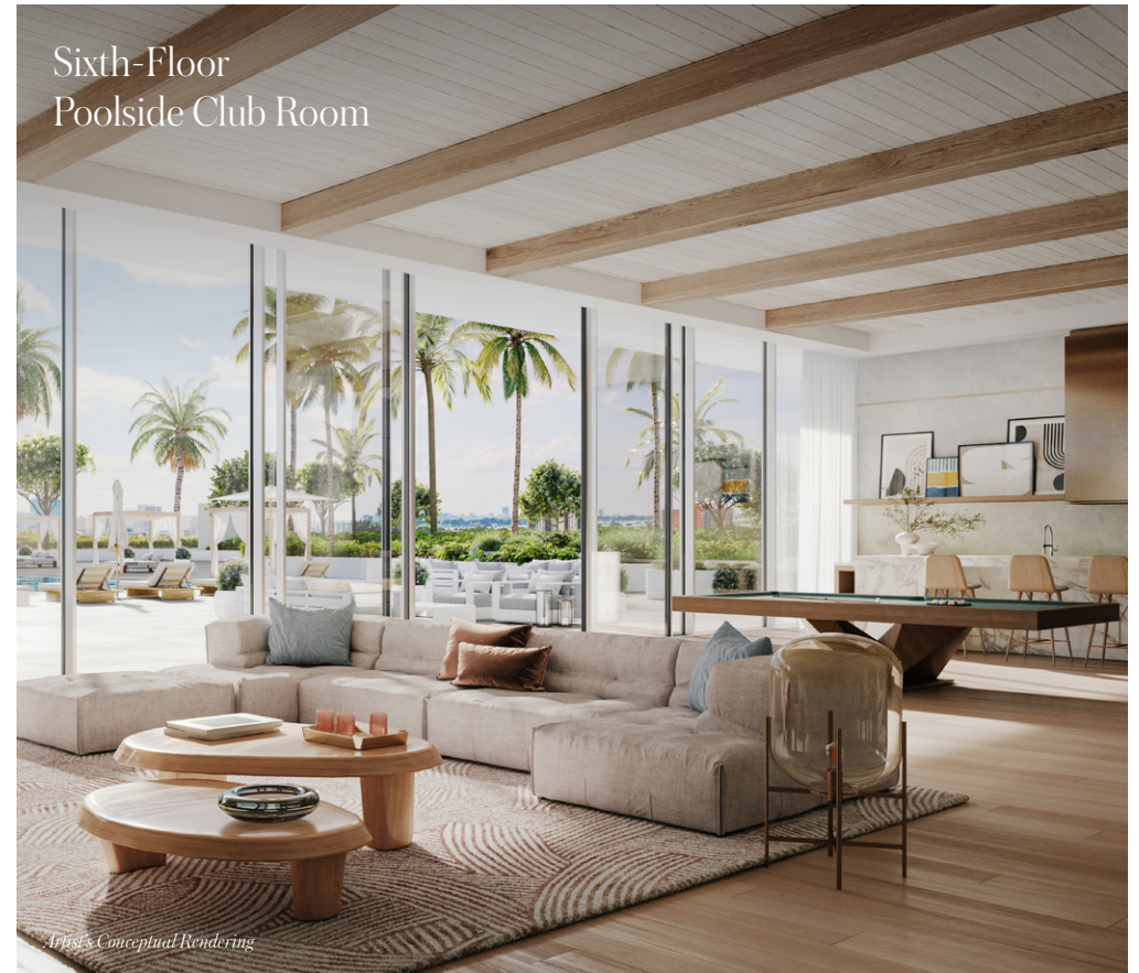
Sixth-Floor Poolside Club Room