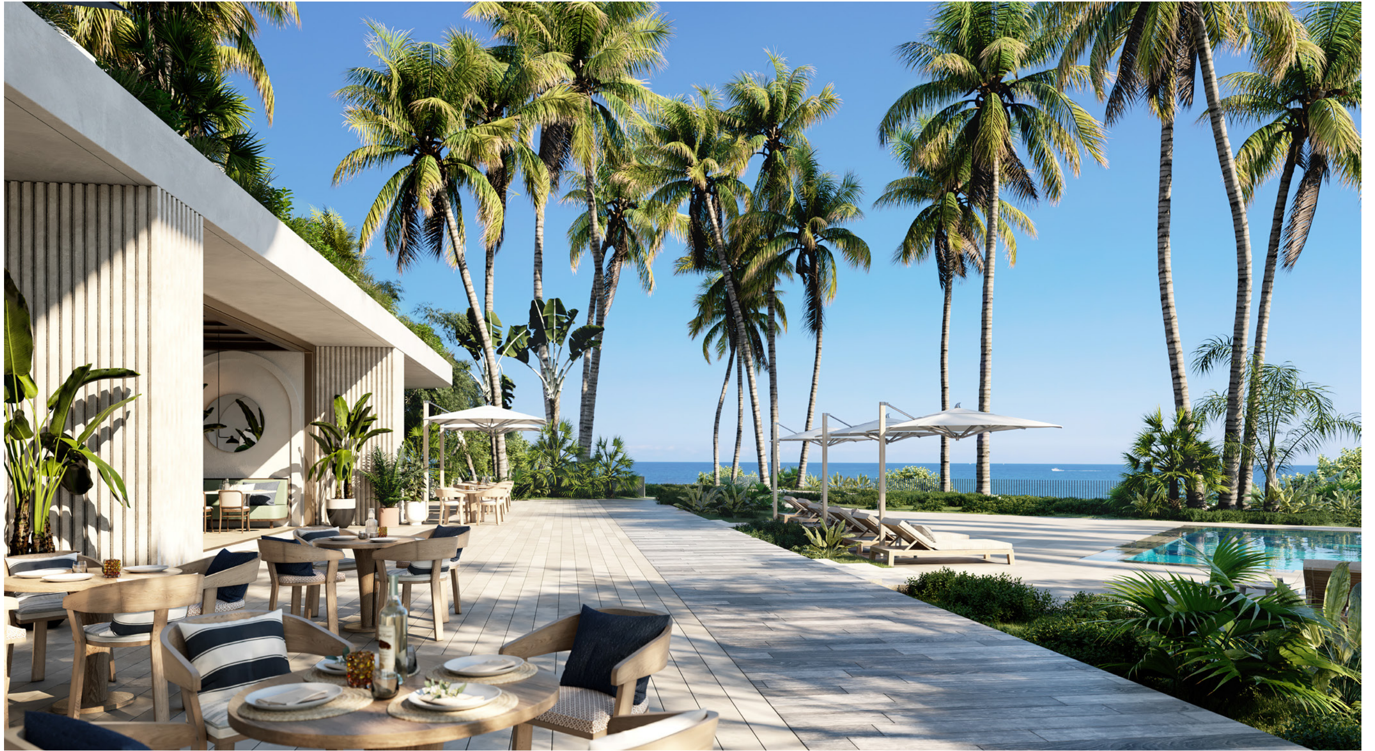
The oceanfront Restaurant is an exclusive enclave for residents and their guests