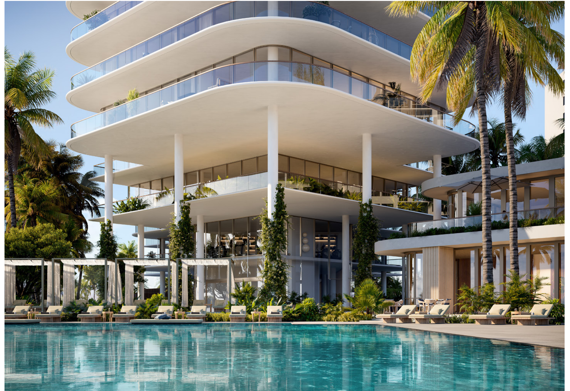
The beachfront swimming pool with private cabanas

Stepping outside, Gustafson Porter + Bowman has created a microcosm of Florida's landscapes through a series of interlinked habitats. Breeze-tussled coastal planting on the oceanfront transitions to a more tropical Everglades environment within via the dune-protected pool and striking water features.