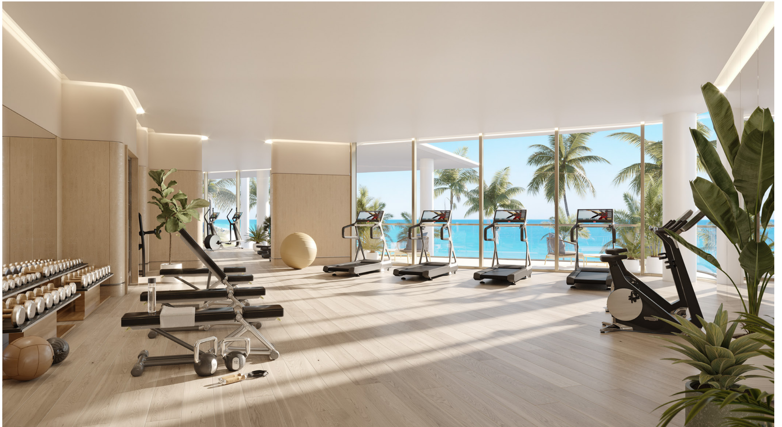
The Training Room with its inspiring views of the Atlantic Ocean