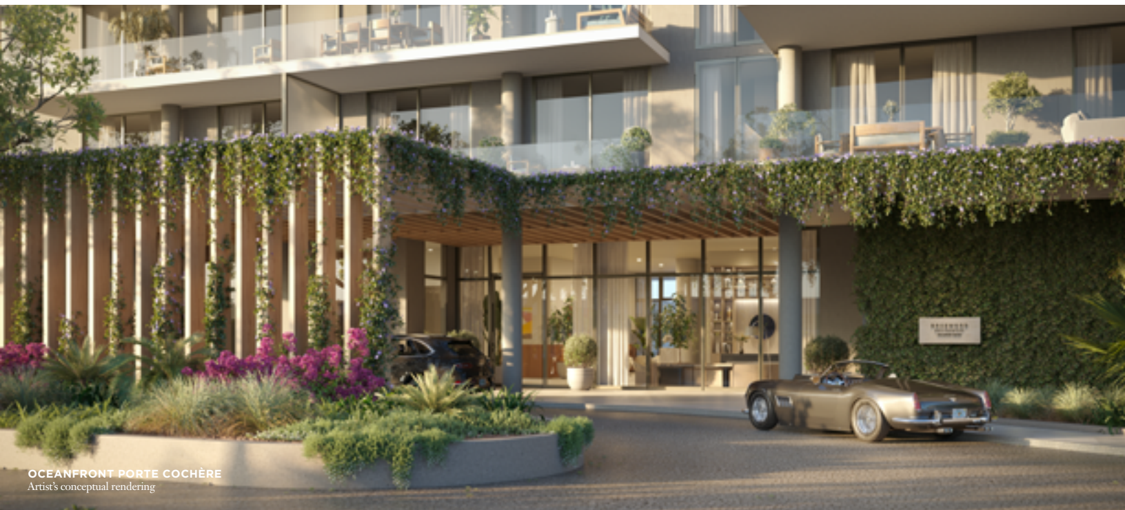
OCEANFRONT PORTE COCHÈRE Artist's conceptual rendering