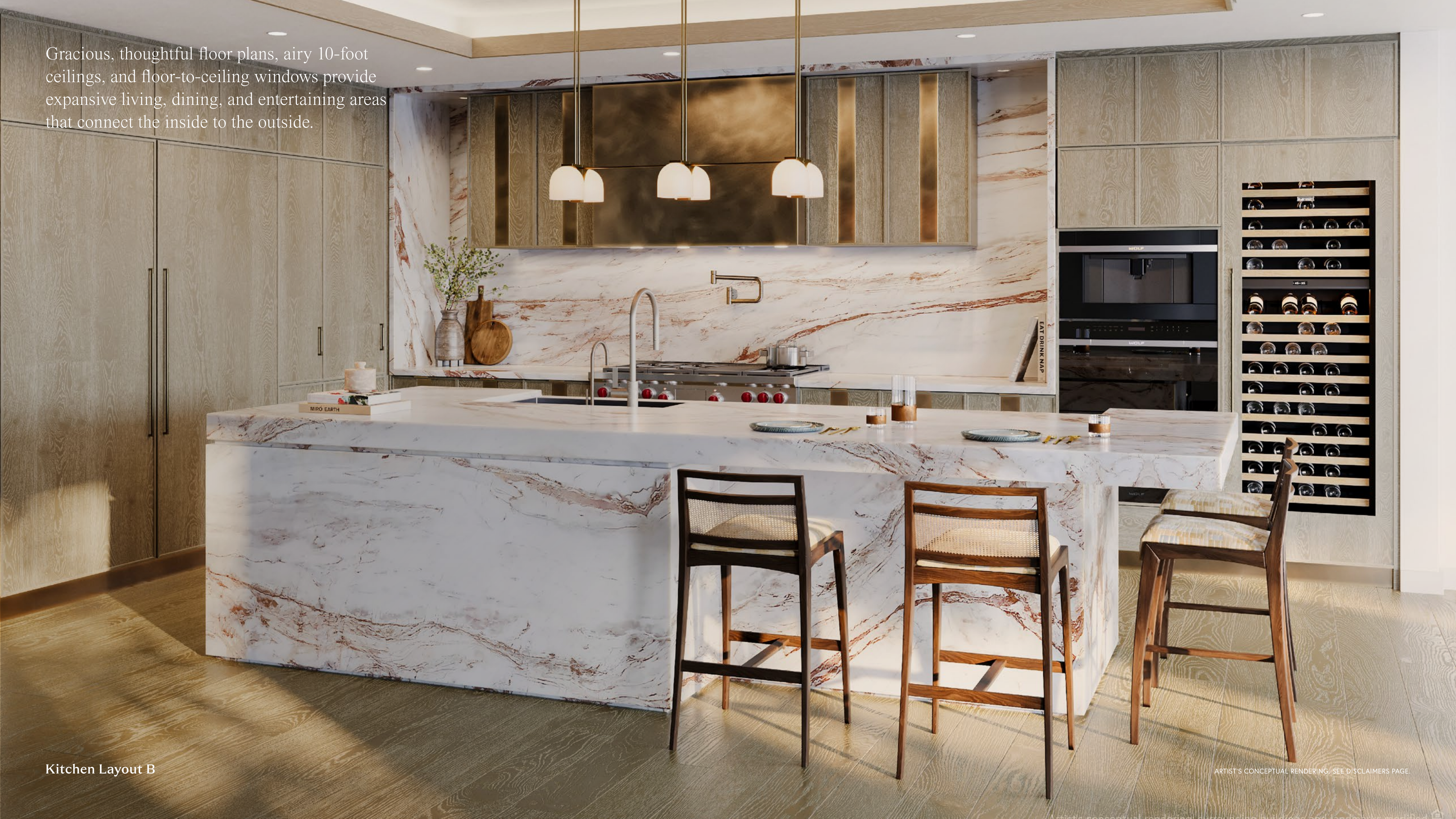
Kitchen Layout B

Gracious, thoughtful floor plans, airy 10-foot ceilings, and floor-to-ceiling windows provide expansive living, dining, and entertaining areas that connect the inside to the outside.