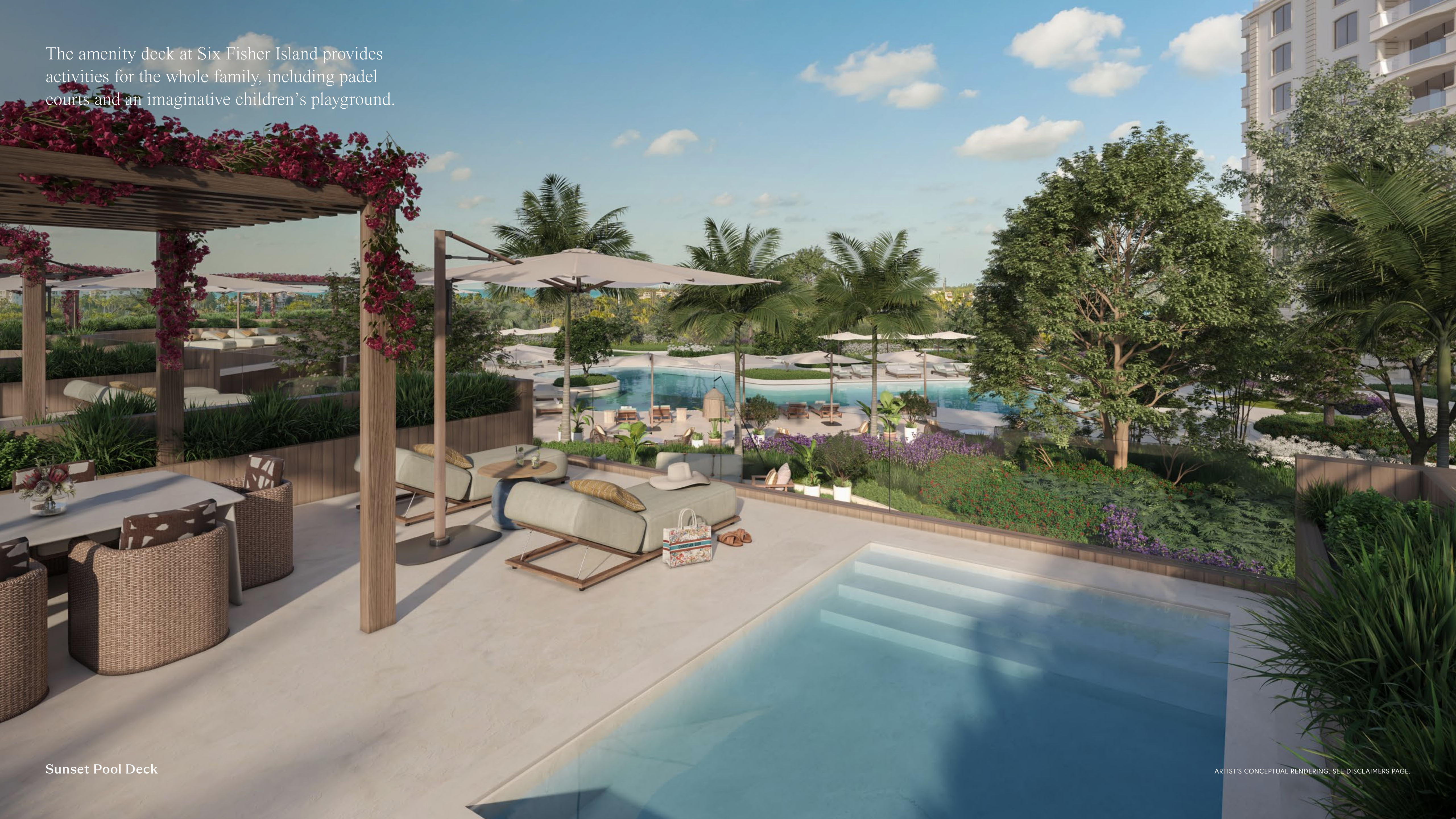
Sunset Pool Deck

The amenity deck at Six Fisher Island provides activities for the whole family, including padel courts and an imaginative children's playground.