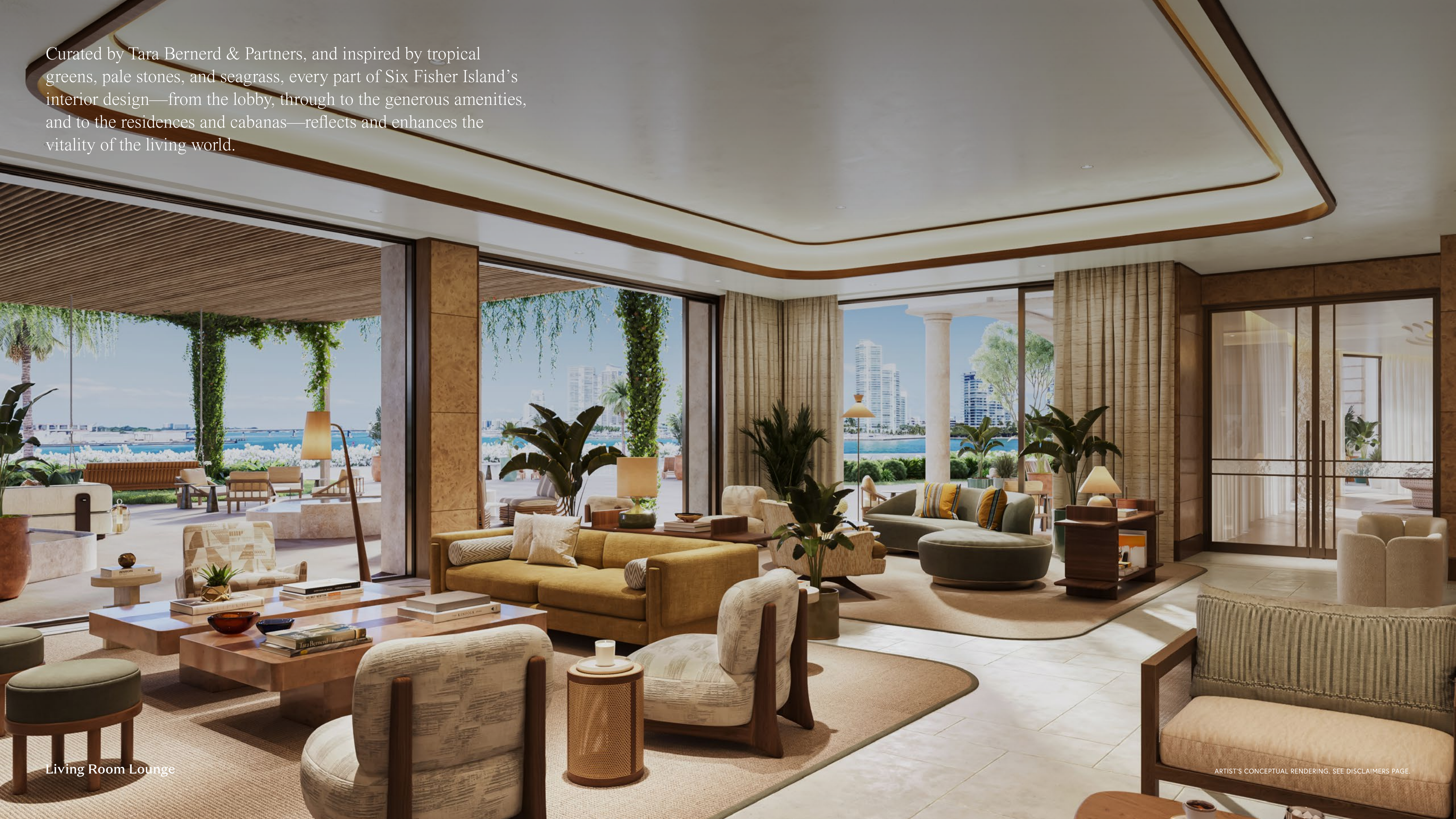
Living Room Lounge

Curated by Tara Bernerd & Partners, and inspired by tropical greens, pale stones, and seagrass, every part of Six Fisher Island's interior design—from the lobby, through to the generous amenities, and to the residences and cabanas—reflects and enhances the vitality of the living world.