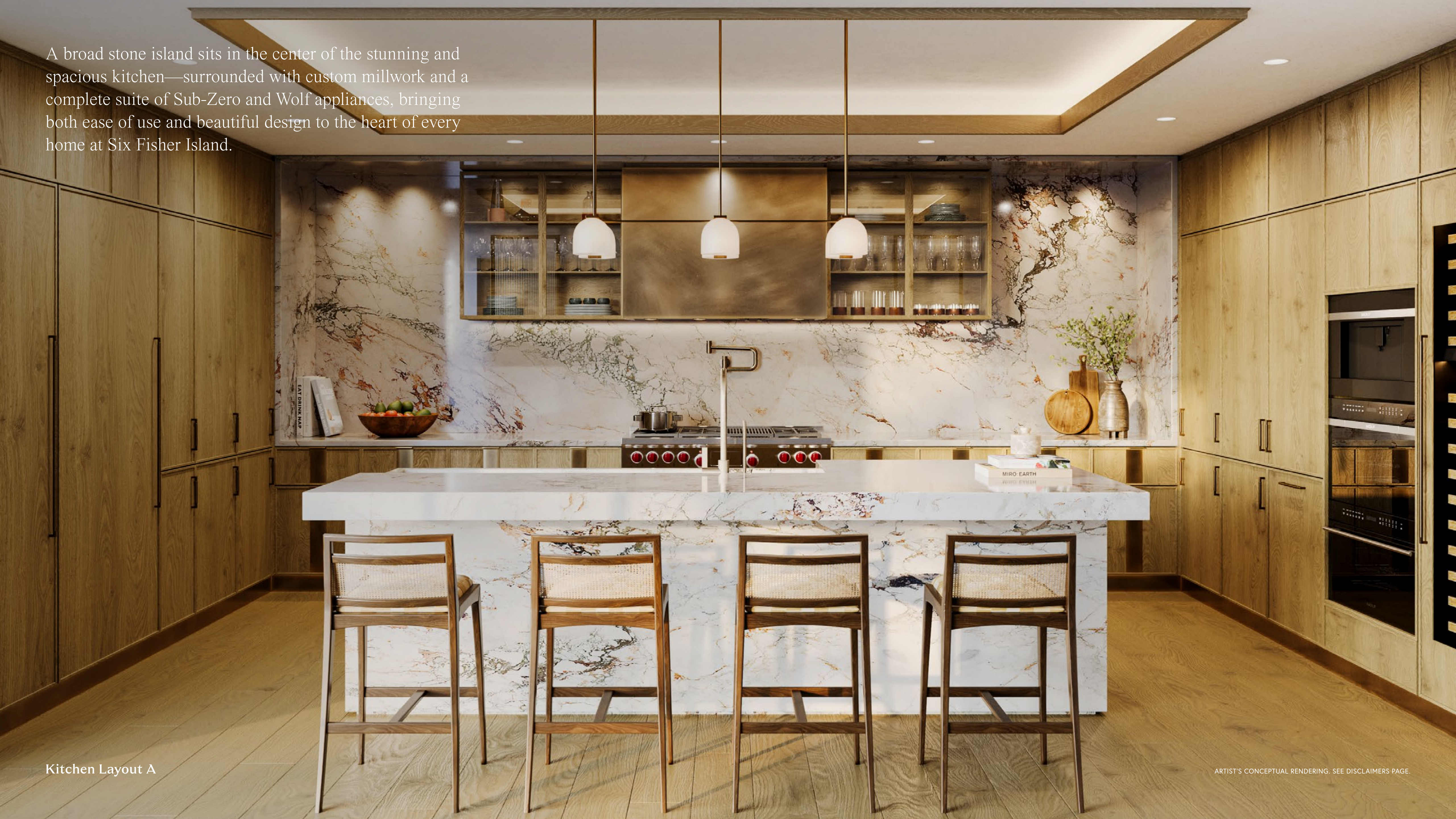
Kitchen Layout A

A broad stone island sits in the center of the stunning and spacious kitchen—surrounded with custom millwork and a complete suite of Sub-Zero and Wolf appliances, bringing both ease of use and beautiful design to the heart of every home at Six Fisher Island.