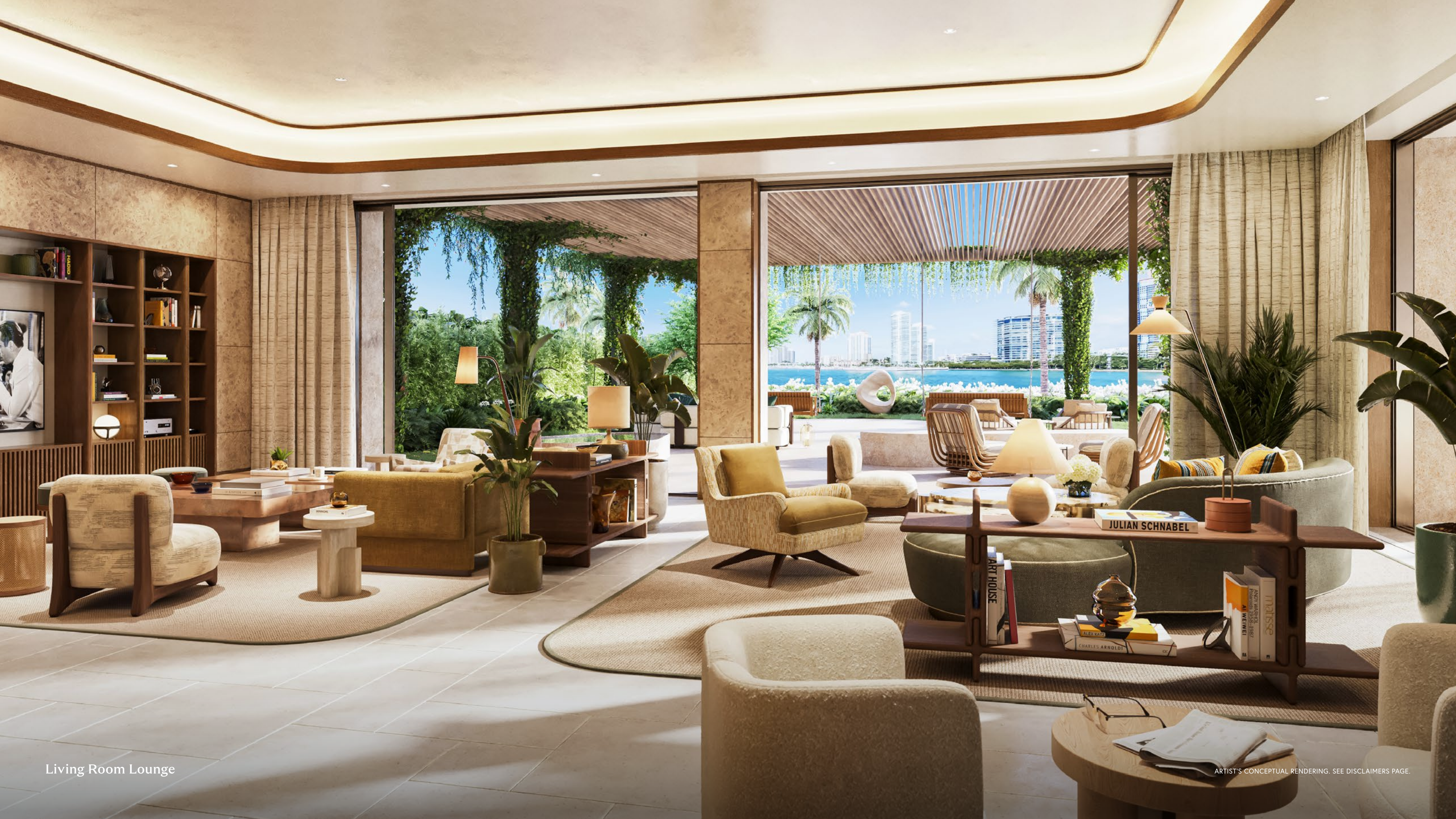
Living Room Lounge

ARTIST'S CONCEPTUAL RENDERING. SEE DISCLAIMERS PAGE.