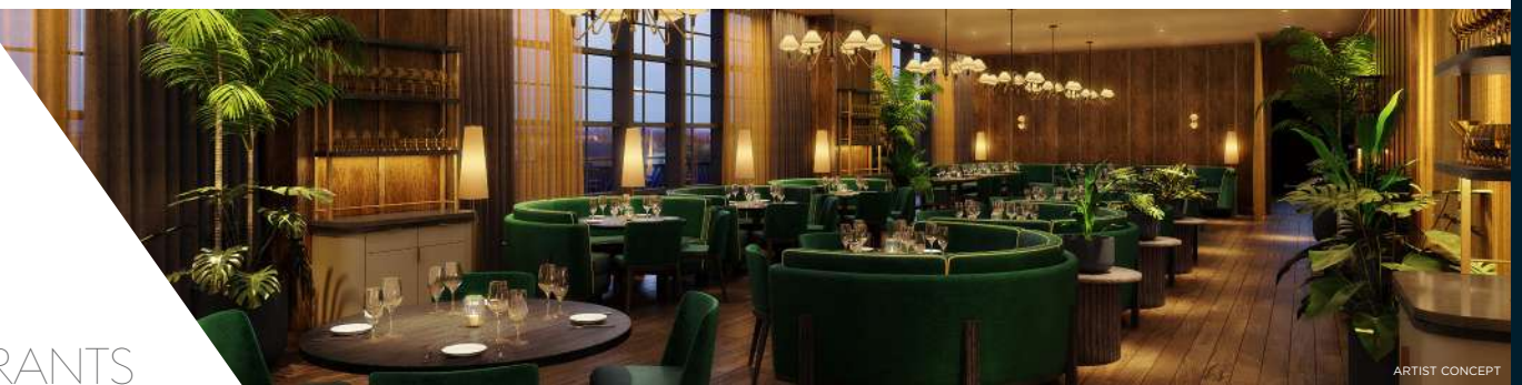
24,000 SQ FT OF INVIGORATING FOOD & BEVERAGE OFFERINGS FOCUSED ON LOCAL FARE