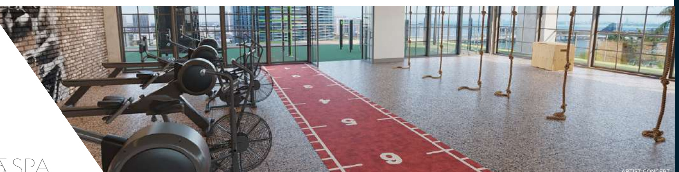
HEALTH AND FITNESS CENTER, AIMED AT NOURISHING BODY & SOUL.