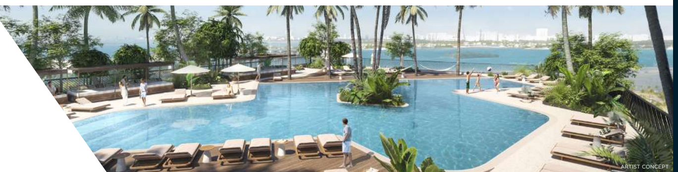
16,000 SQ FT POOLSIDE RETREAT ELEVATED ABOVE THE HUM OF DOWNTOWN