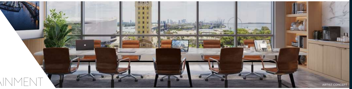
30,000 SQ FT PRIVATE EVENT AND MEETING SPACES