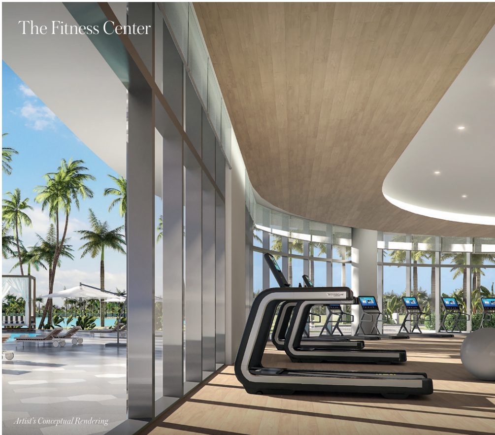
The Fitness Center