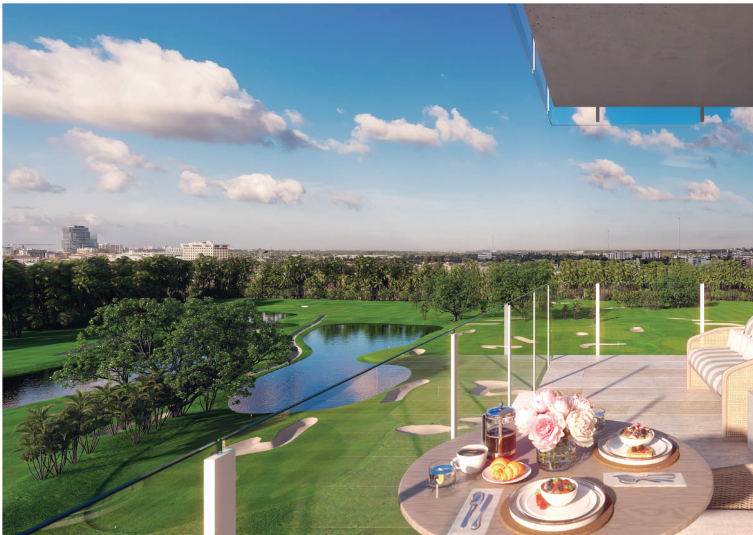
VIEW LOOKING WEST OVER GOLF COURSE

Refined residences float above an oasis of green.