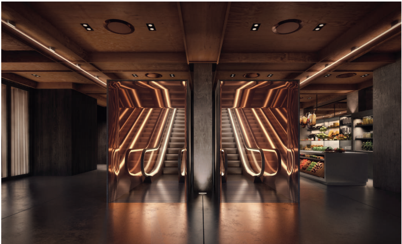
215 CHRYSTIE ST, NEW YORK