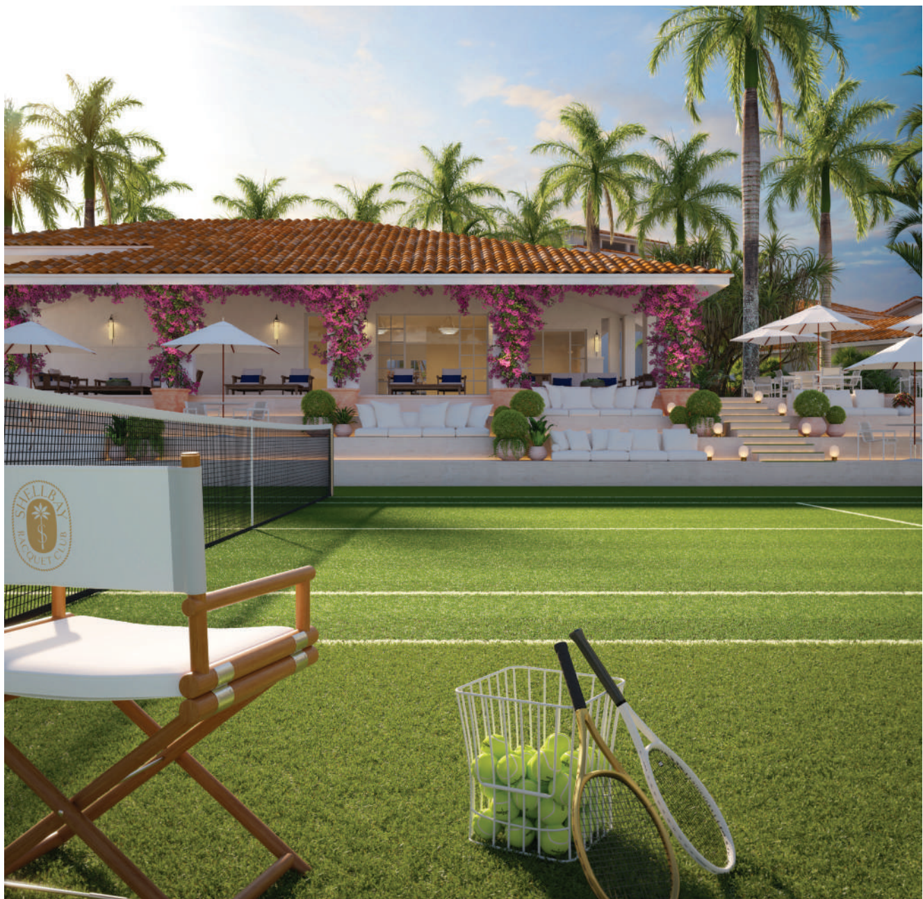
SHELL BAY RACQUET CLUB