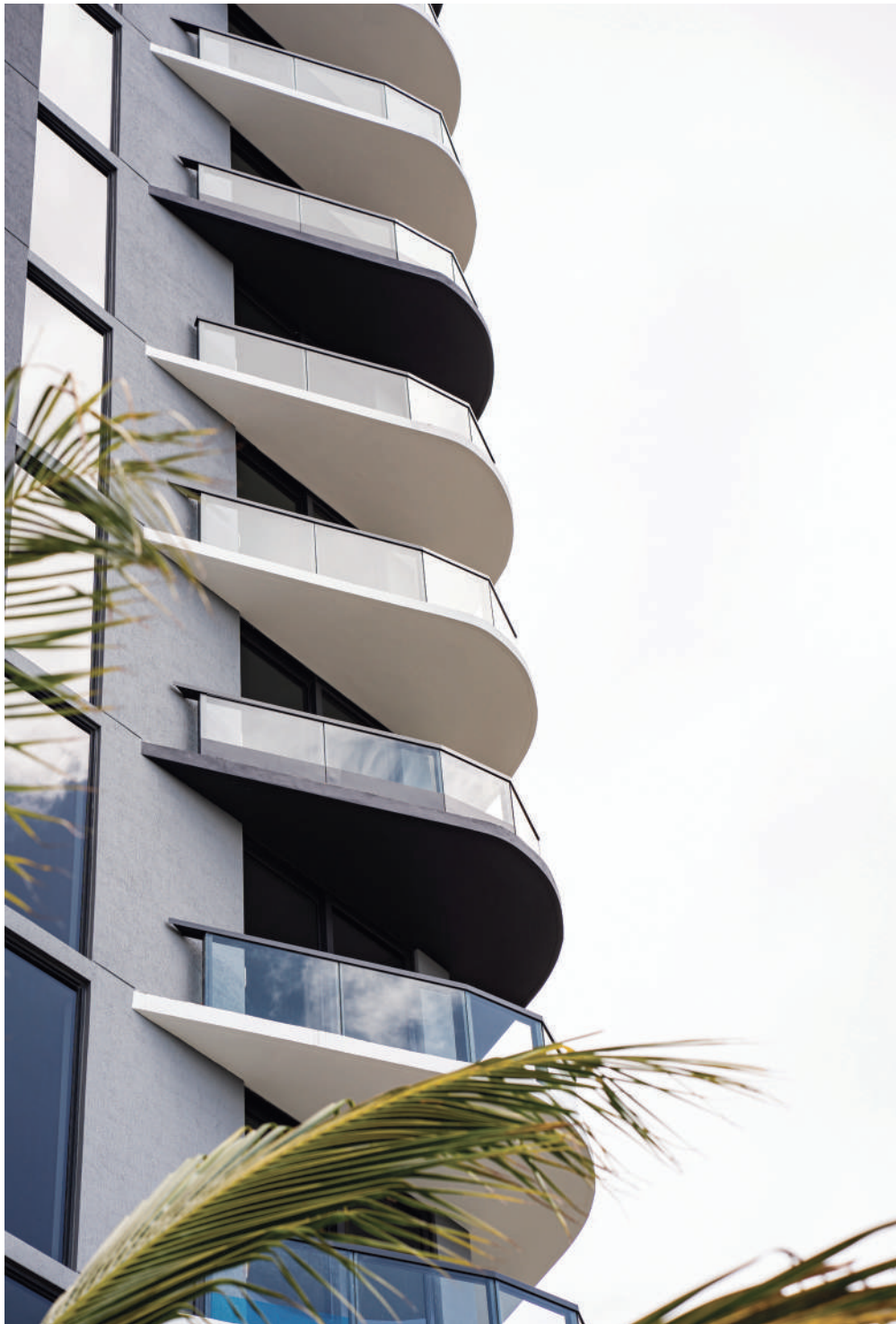
SLATE, HALLANDALE BEACH, FLORIDA