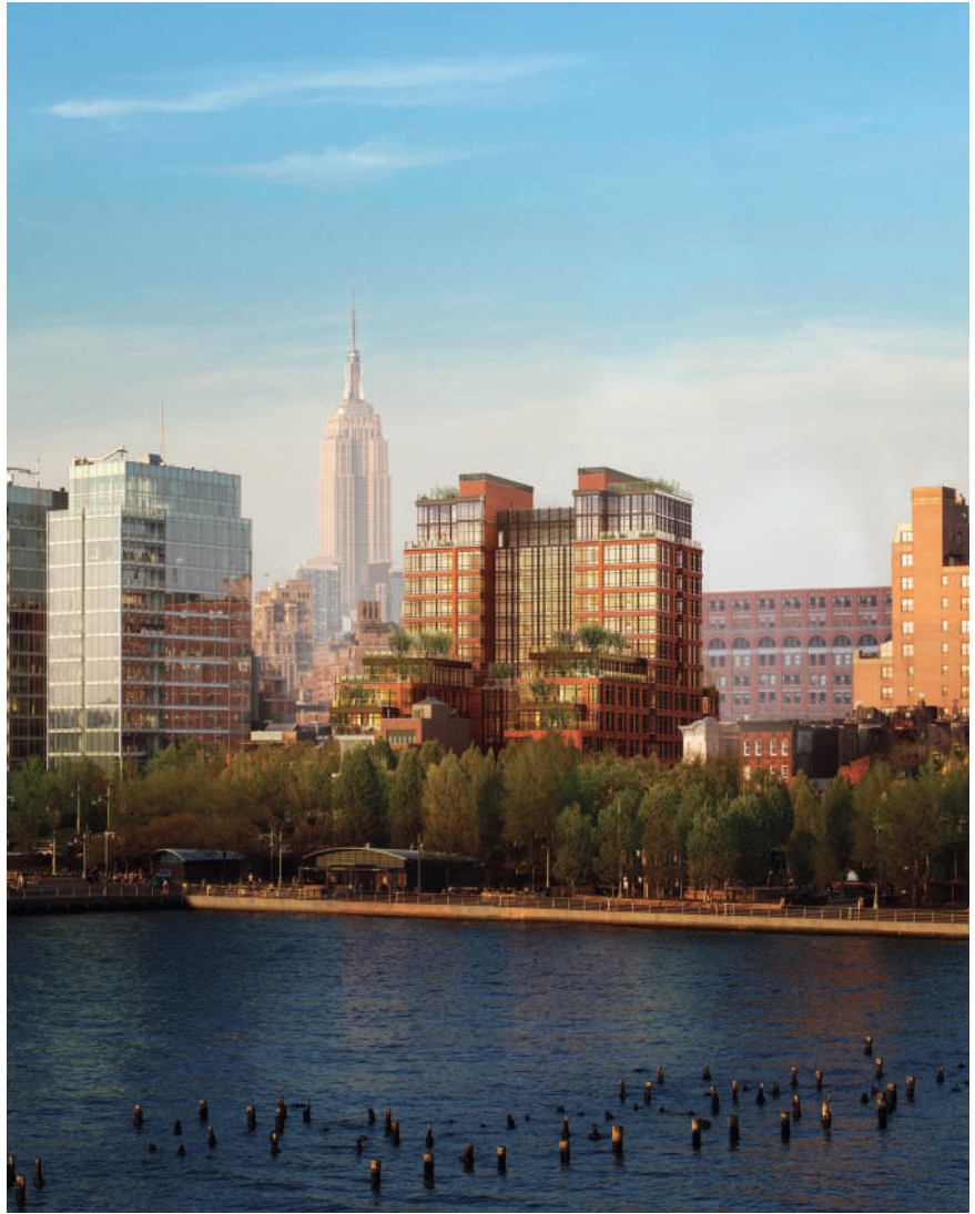
150 CHARLES ST, NEW YORK