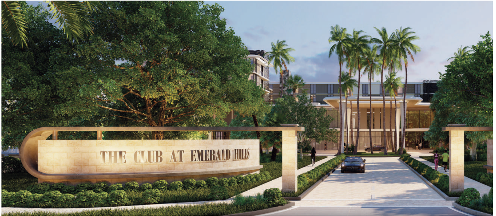
THE CLUB AT EMERALD HILLS, HOLLYWOOD, FLORIDA