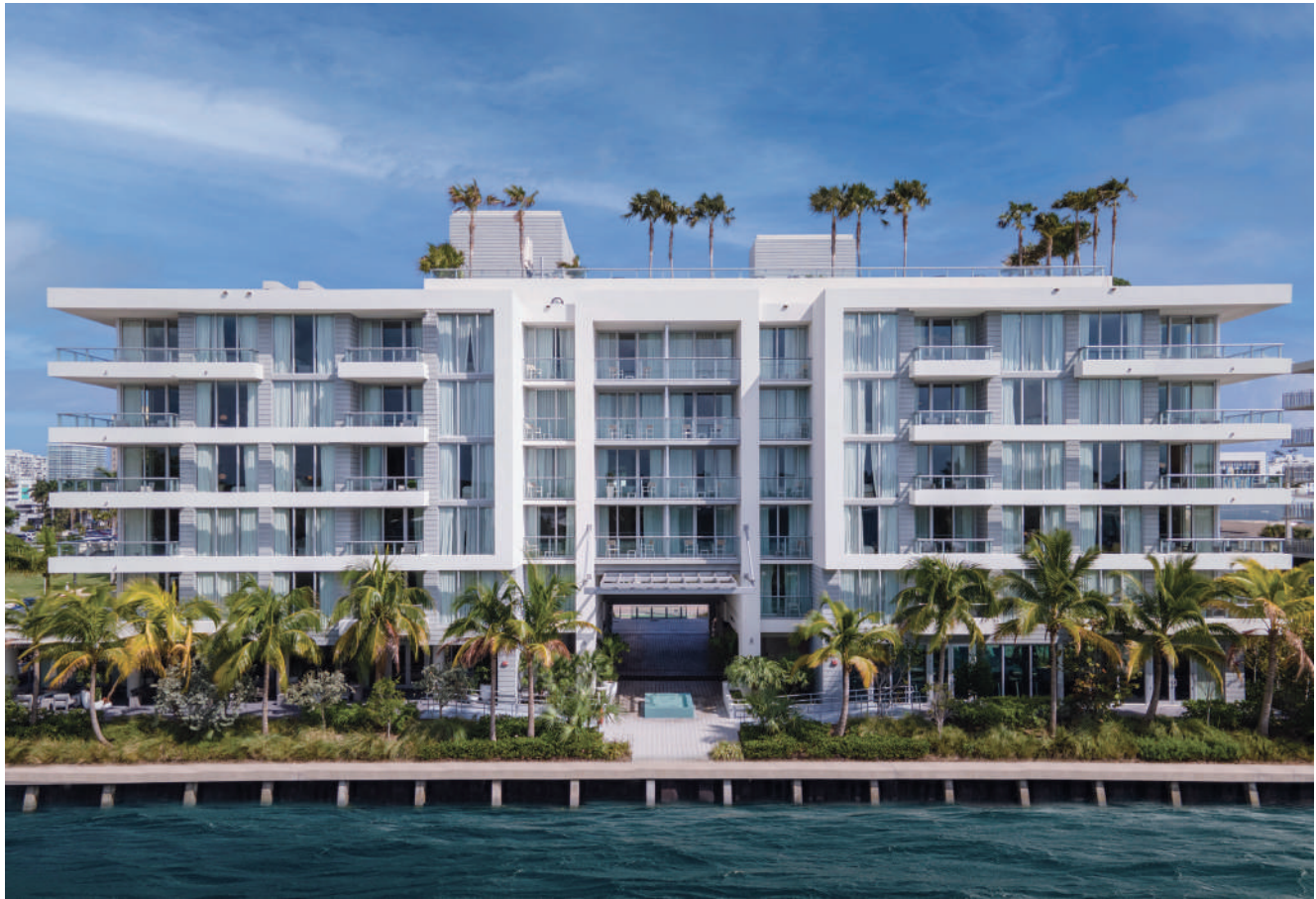
THE ALTAIR HOTEL, BAY HARBOR, FLORIDA