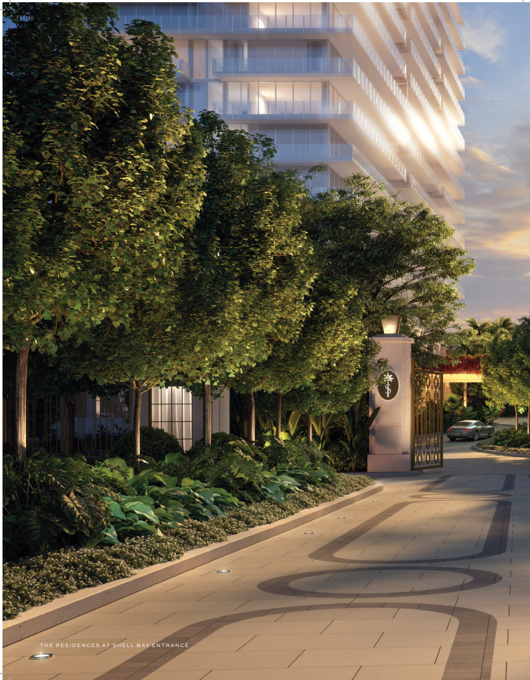
THE RESIDENCES AT SHELL BAY ENTRANCE