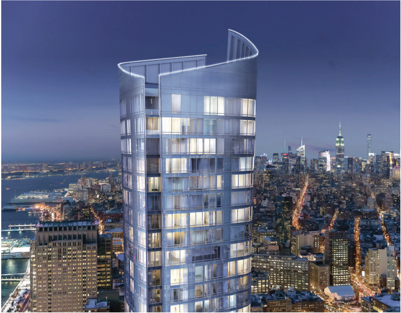
111 MURRAY ST, NEW YORK