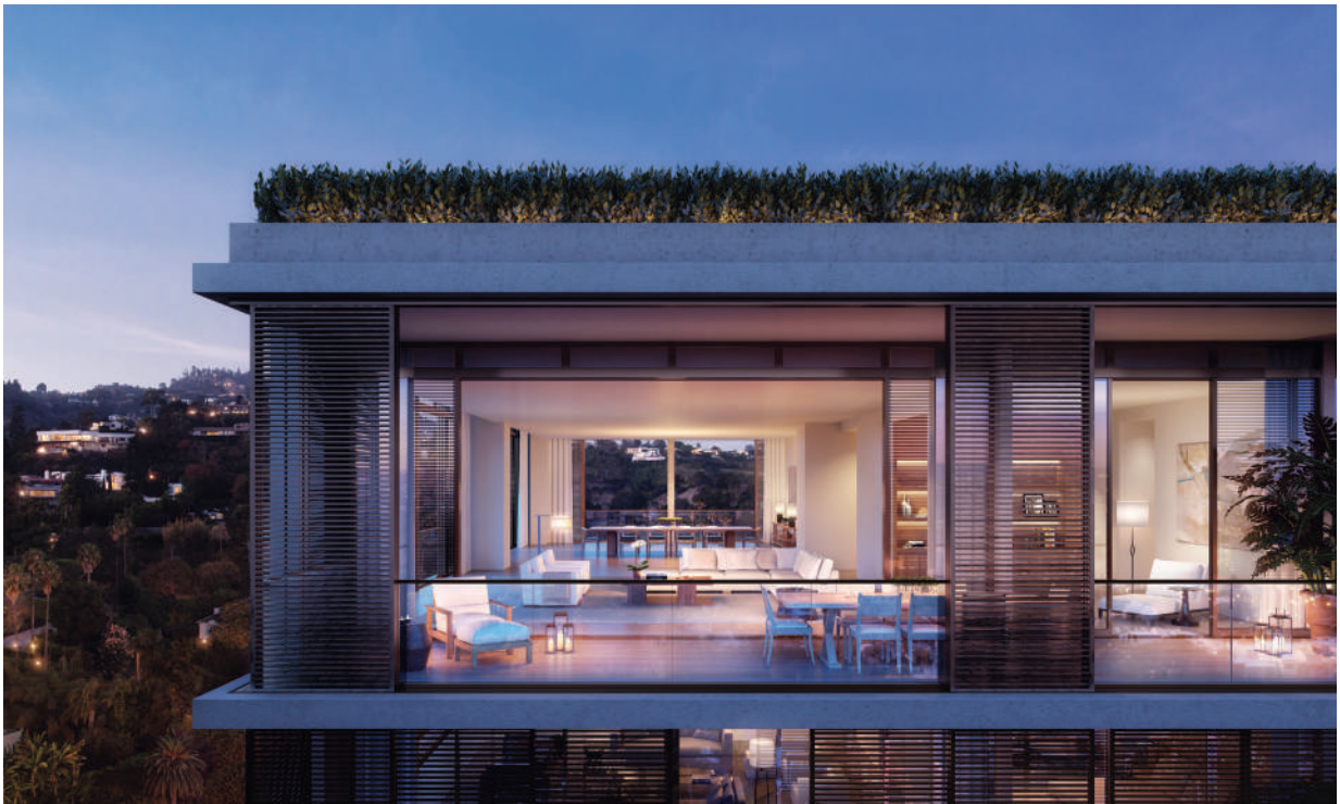
EDITION RESIDENCES, WEST HOLLYWOOD