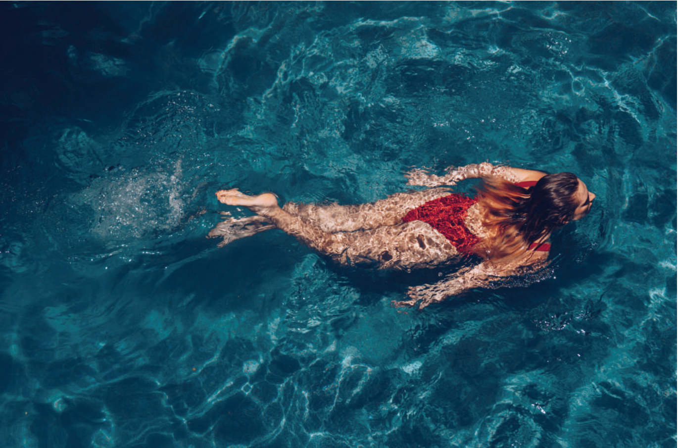
THE RESIDENCES AT SHELL BAY