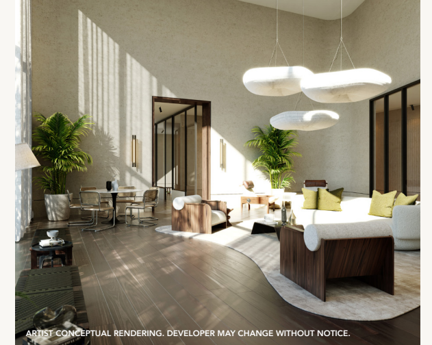
ARTIST CONCEPTUAL RENDERING. DEVELOPER MAY CHANGE WITHOUT NOTICE.