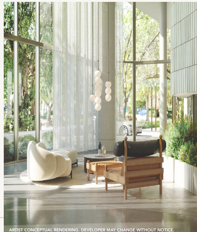
ARTIST CONCEPTUAL RENDERING. DEVELOPER MAY CHANGE WITHOUT NOTICE.