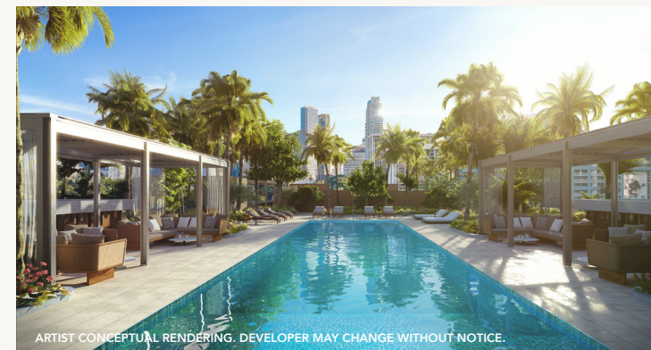
ARTIST CONCEPTUAL RENDERING. DEVELOPER MAY CHANGE WITHOUT NOTICE.