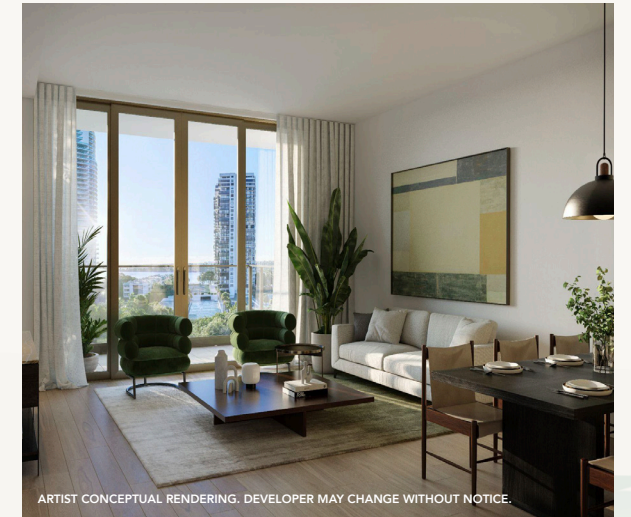
ARTIST CONCEPTUAL RENDERING. DEVELOPER MAY CHANGE WITHOUT NOTICE.