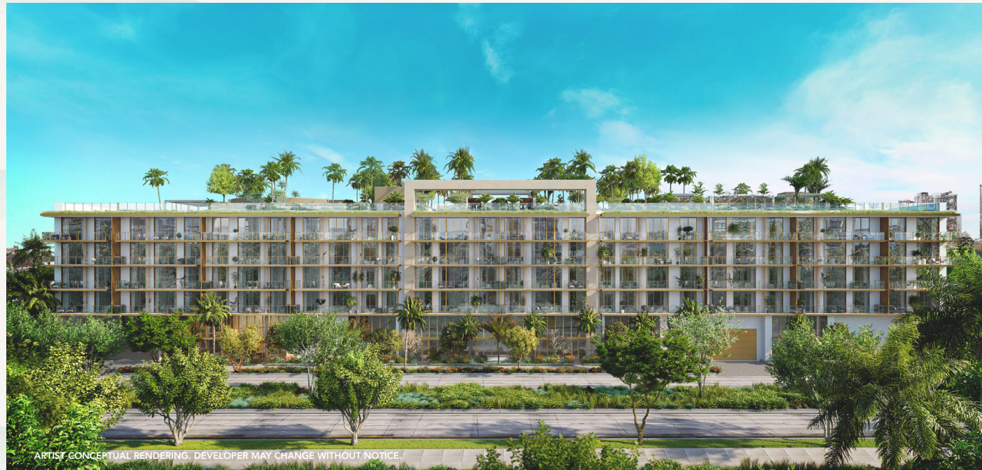
ARTIST CONCEPTUAL RENDERING. DEVELOPER MAY CHANGE WITHOUT NOTICE.