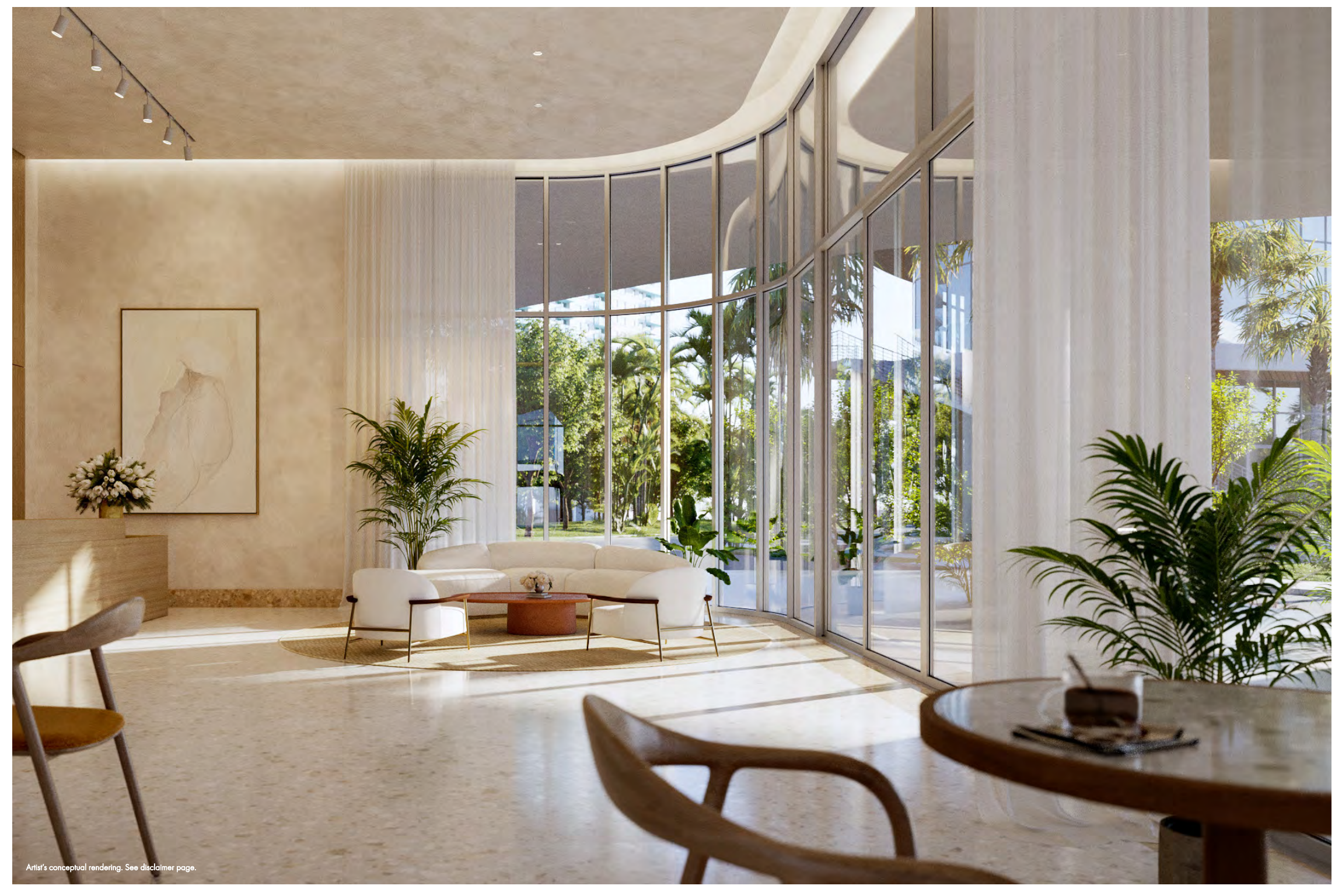
AN EXQUISITE LOBBY FOR ELEGANT ARRIVALS