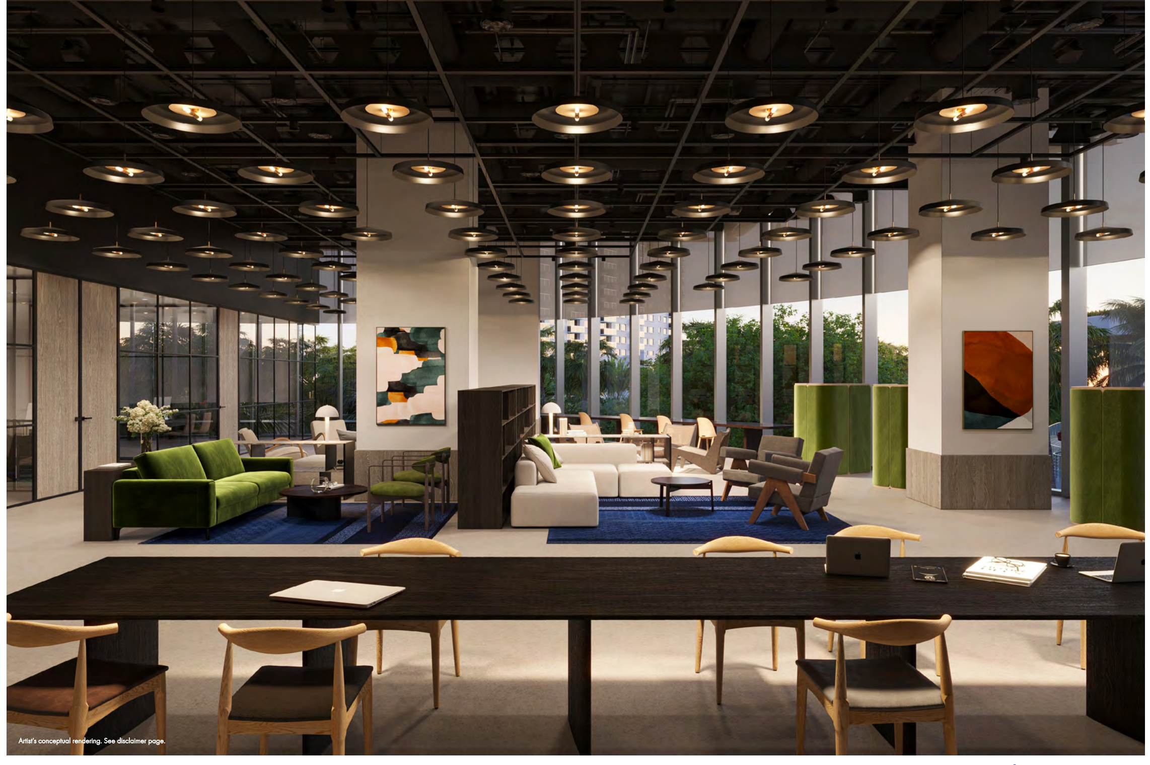
COWORKING & LOUNGE SPACE