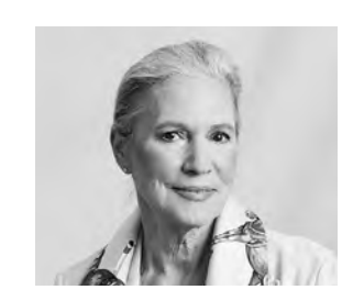
PARK DESIGN ARQUITECTONICAGEO