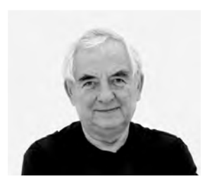
BRIDGE DESIGN DANIEL BUREN