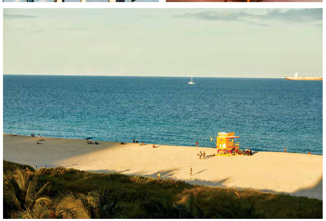
MIAMI BEACH CONTAINS MULTITUDES