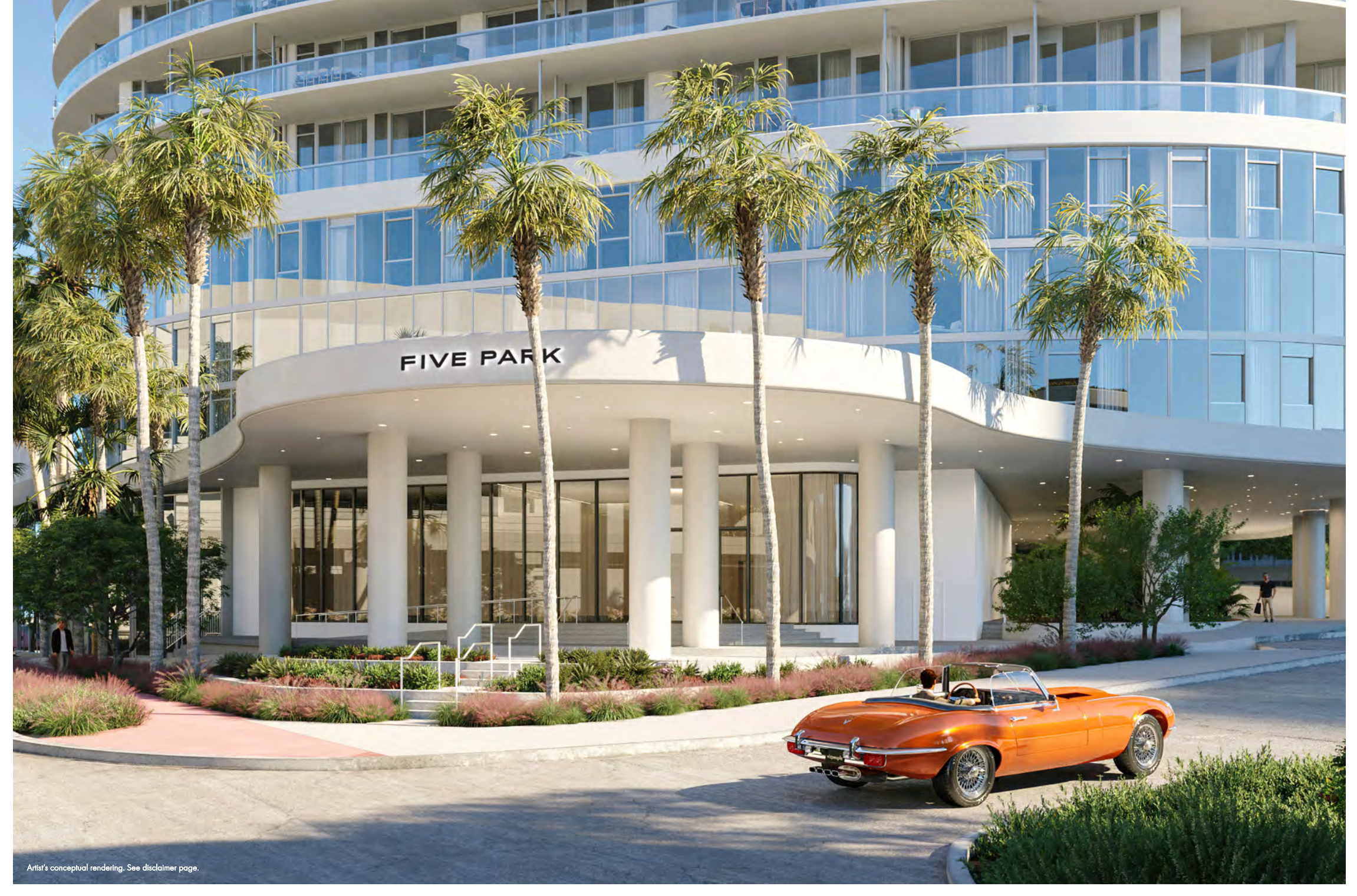
PORTE-COCHERE ENTRY WITH VALET SERVICE