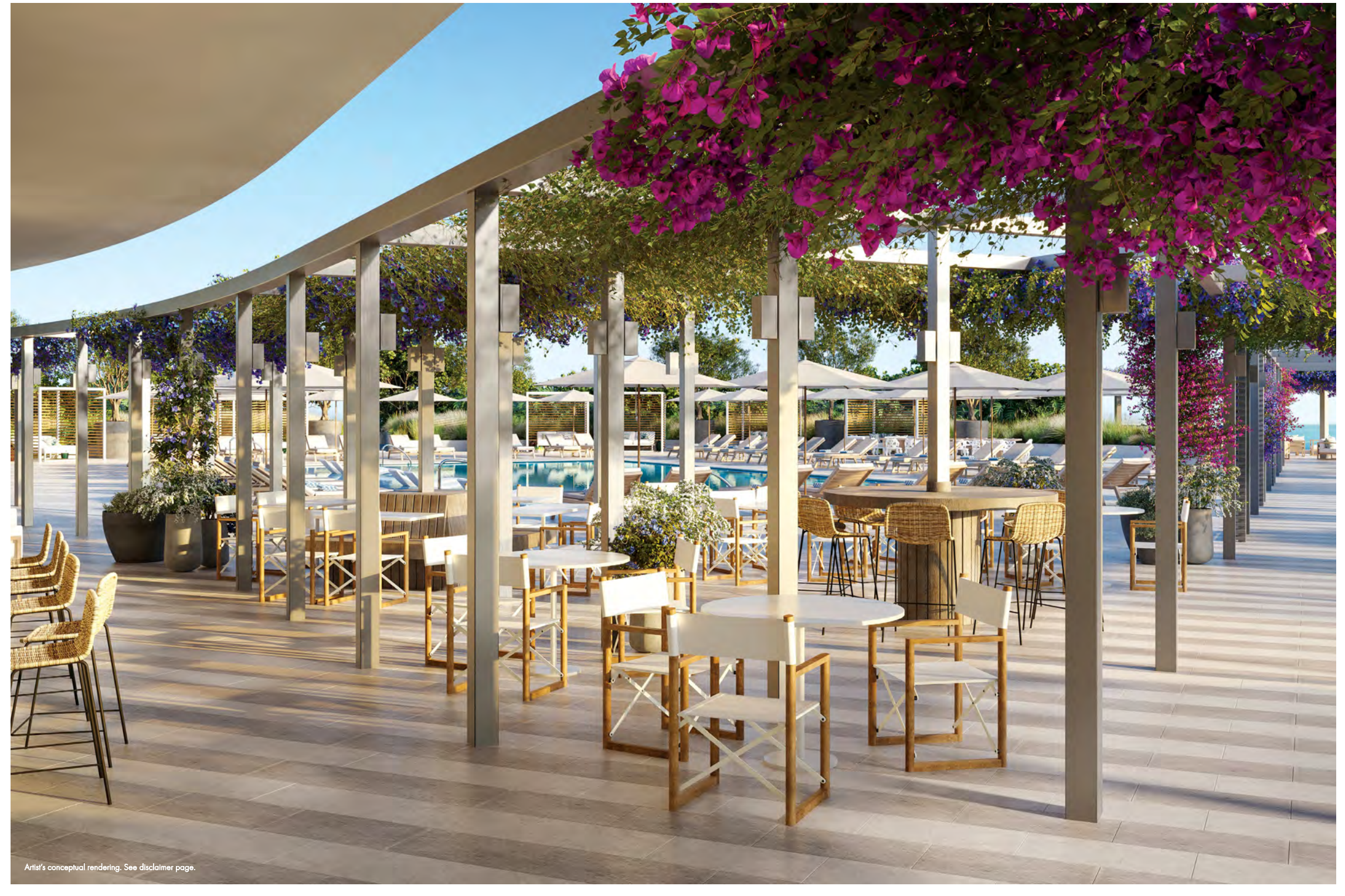
OUTDOOR DINING AT THE TERRACE CAFE