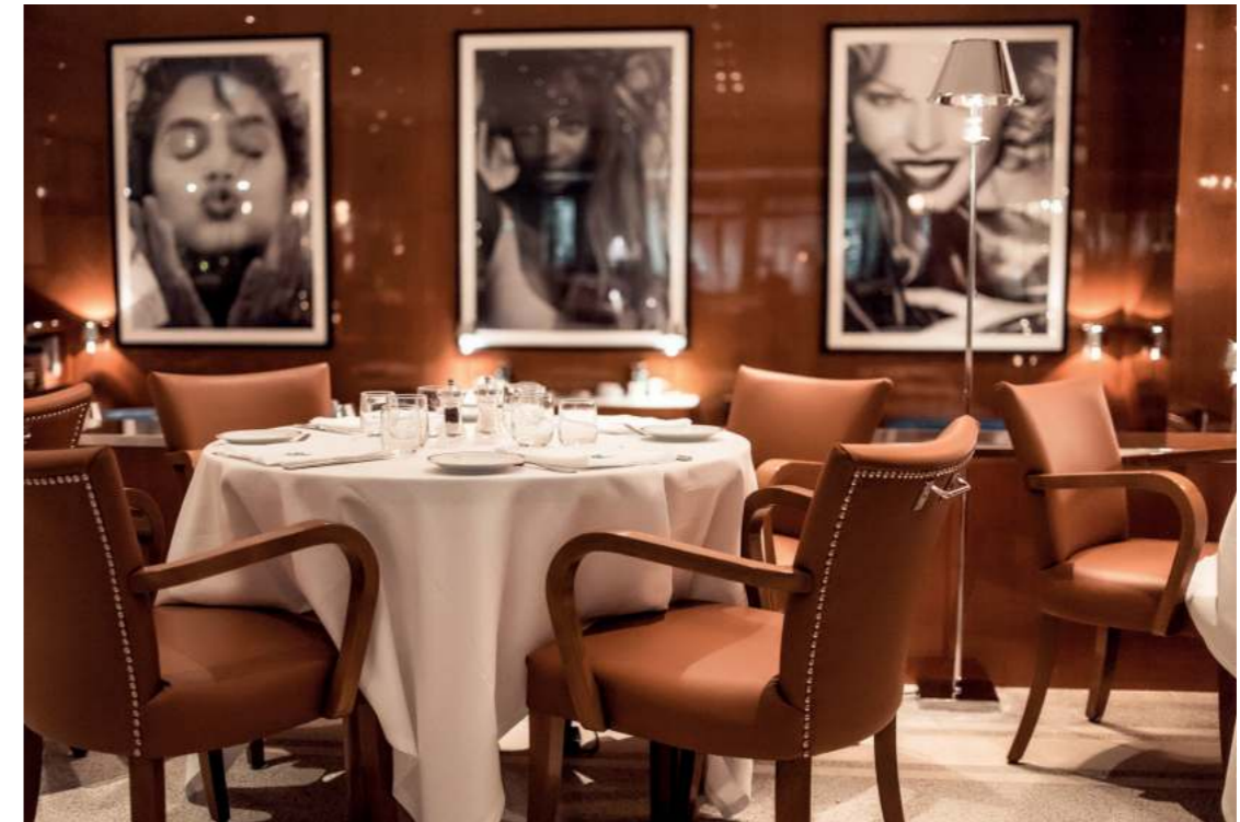
Cipriani Dubai, United Arab Emirates