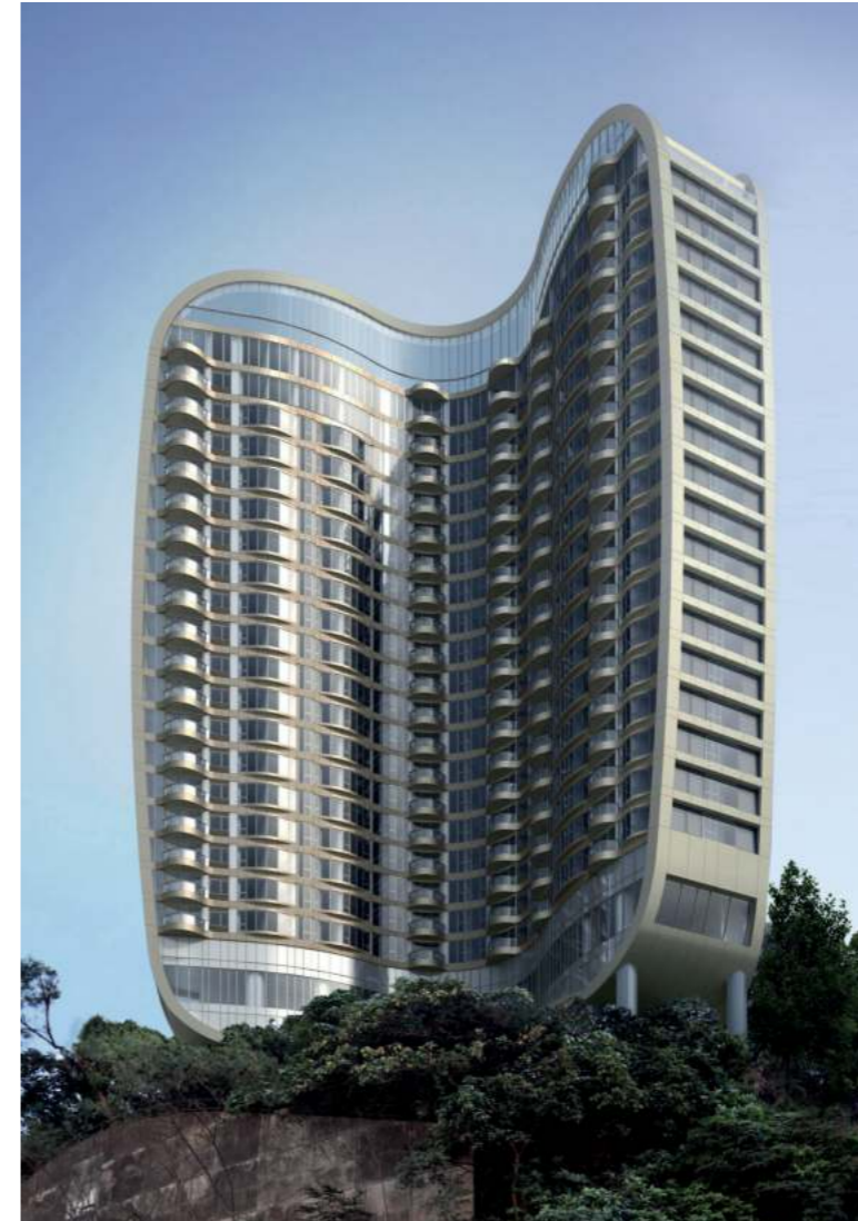
Mount Parker Residences, Hong Kong China