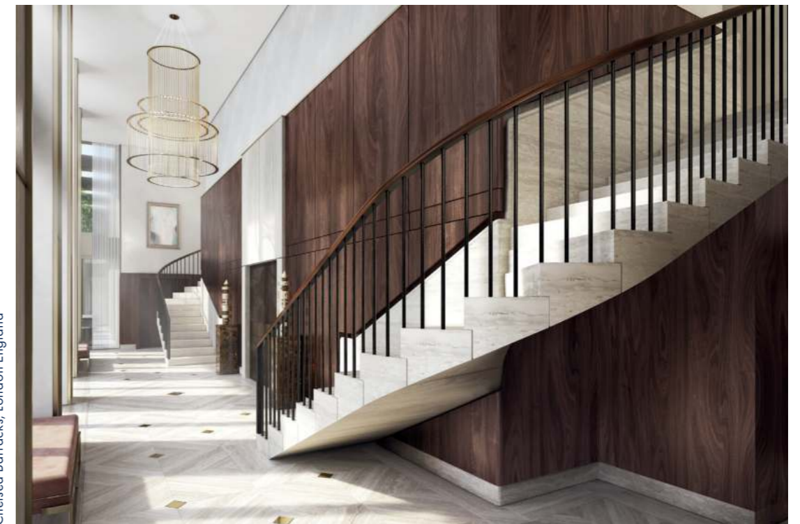
Chelsea Barracks, London England