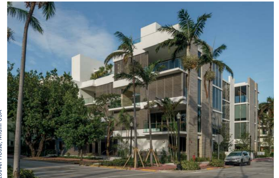
Louver House, Miami USA