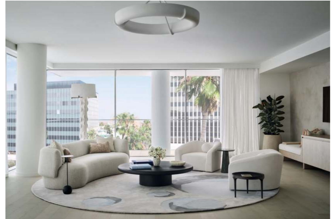
Mandarin Oriental Beverly Hills, Los Angeles USA