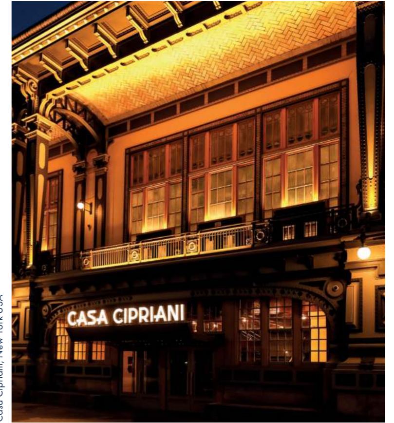
Casa Cipriani, New York USA