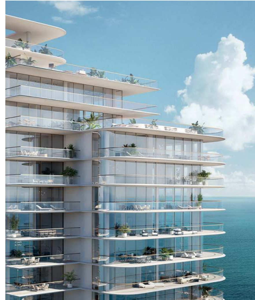
The Perigon, Miami USA