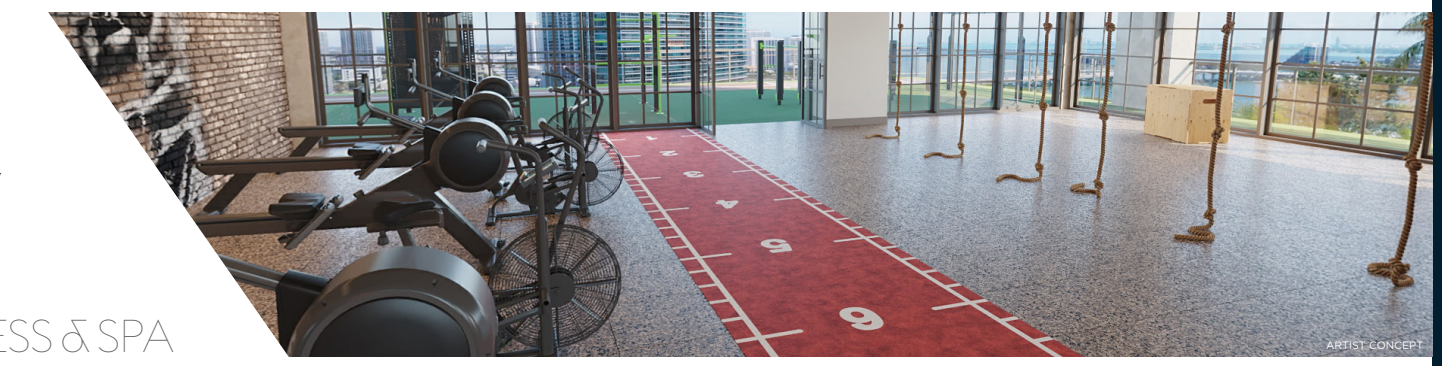
HEALTH AND FITNESS CENTER, AIMED AT NOURISHING BODY & SOUL.