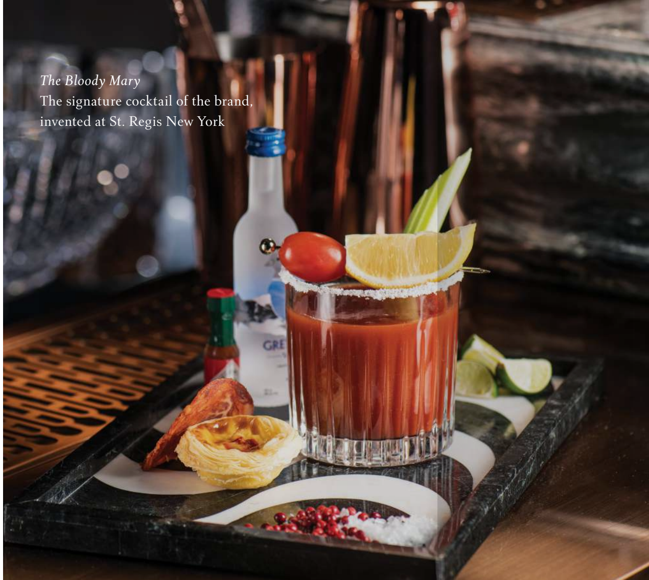
The Bloody Mary The signature cocktail of the brand, invented at St. Regis New York

Known for its refined tastemaking, The St. Regis Residences, Miami continue the cherished traditions and innovative offerings of John Jacob IV and Caroline Astor.