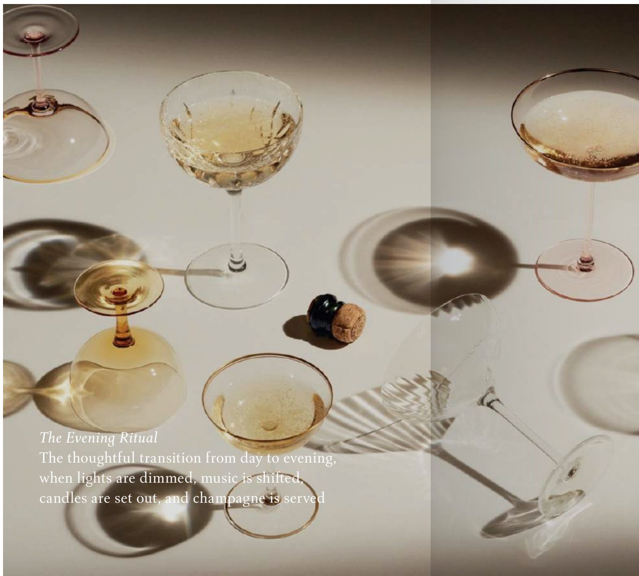
The Evening Ritual The thoughtful transition from day to evening, when lights are dimmed, music is shifted, candles are set out, and champagne is served