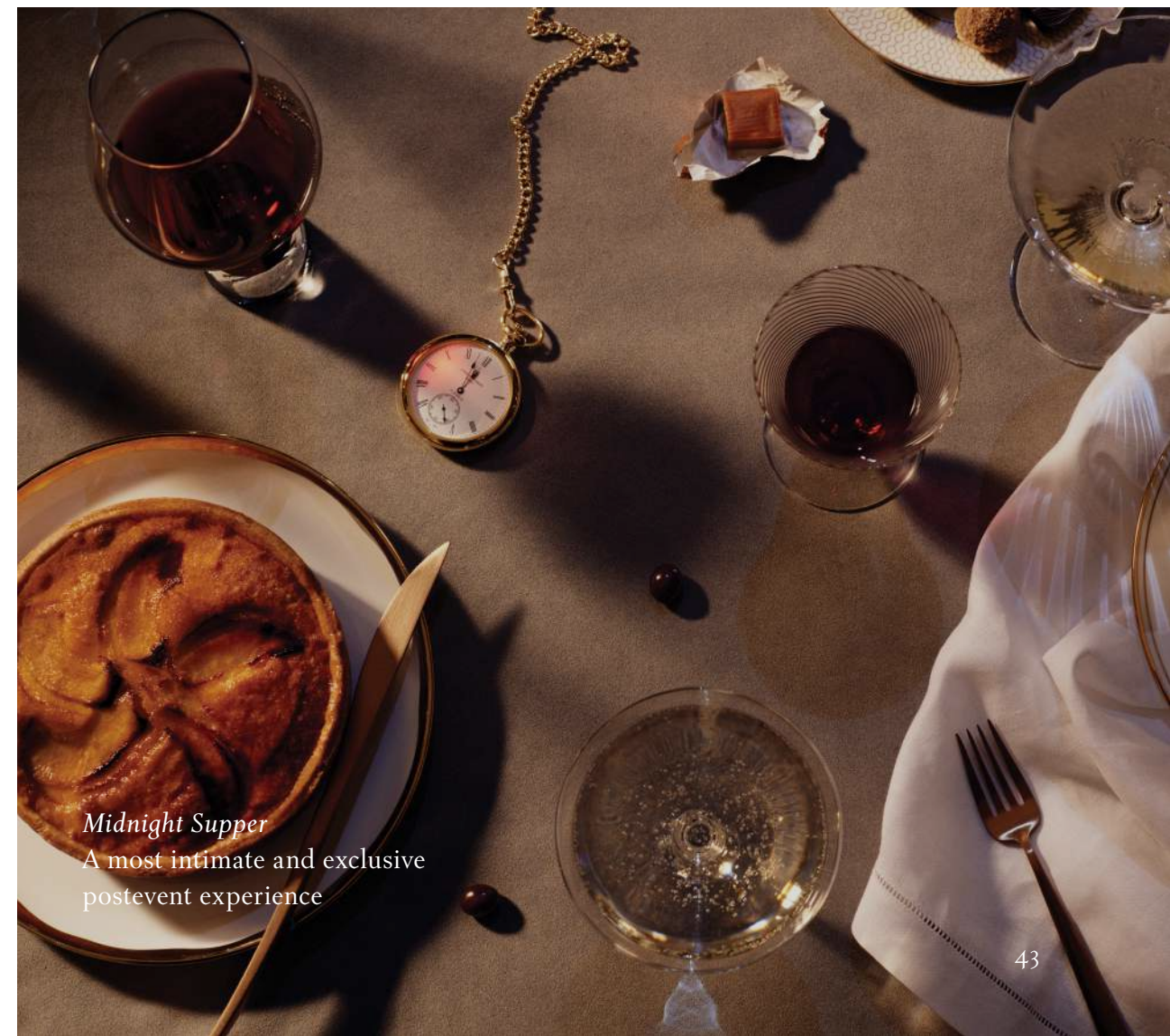
Midnight Supper A most intimate and exclusive postevent experience