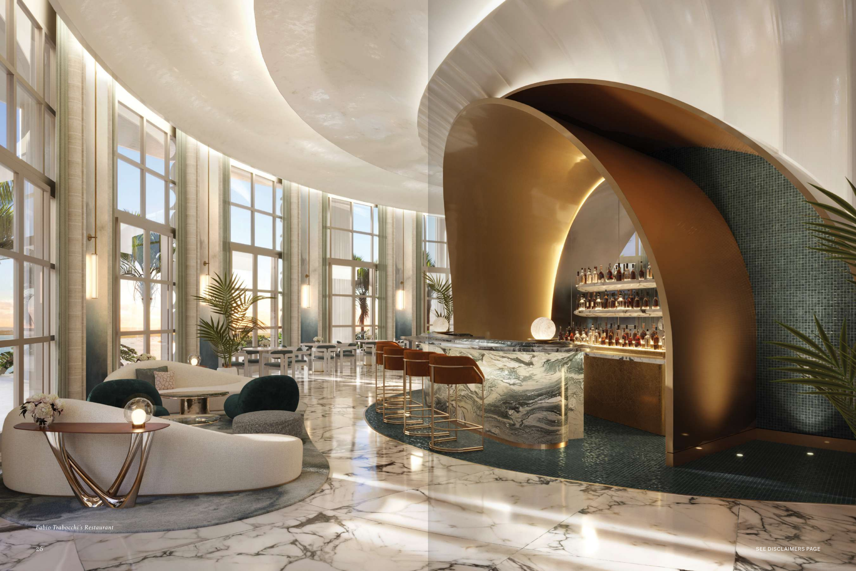
Fabio Trabocchi's Restaurant