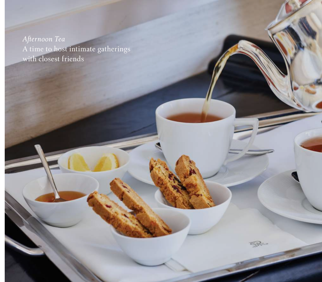
Afternoon Tea A time to host intimate gatherings with closest friends