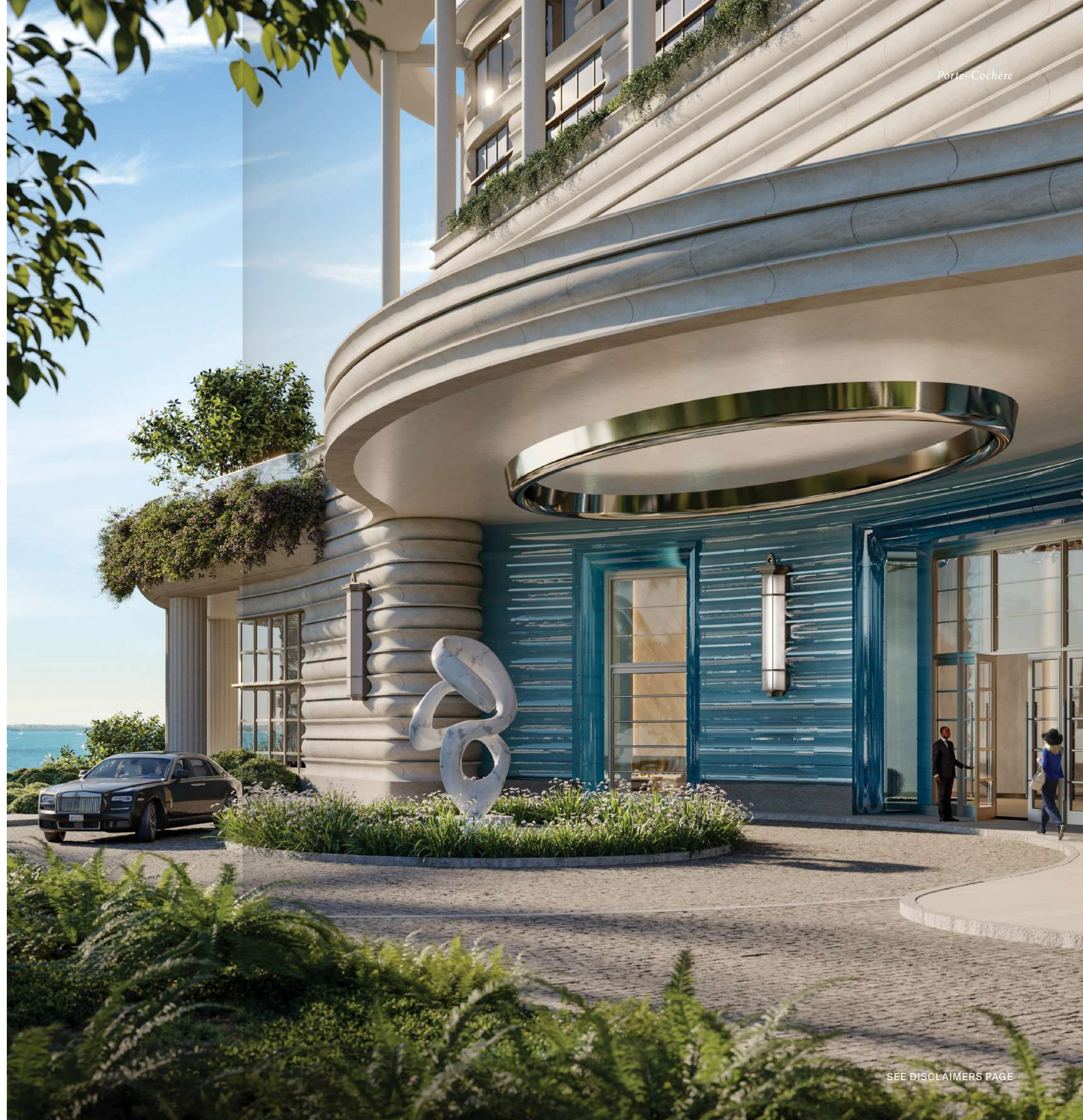
Robert A.M. Stern Design Architect

“When you’re talking about building a residence, you’re talking about dreams.”