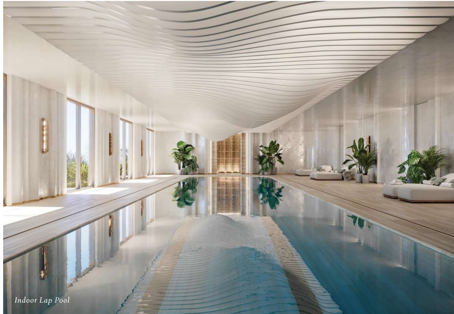
Indoor Lap Pool