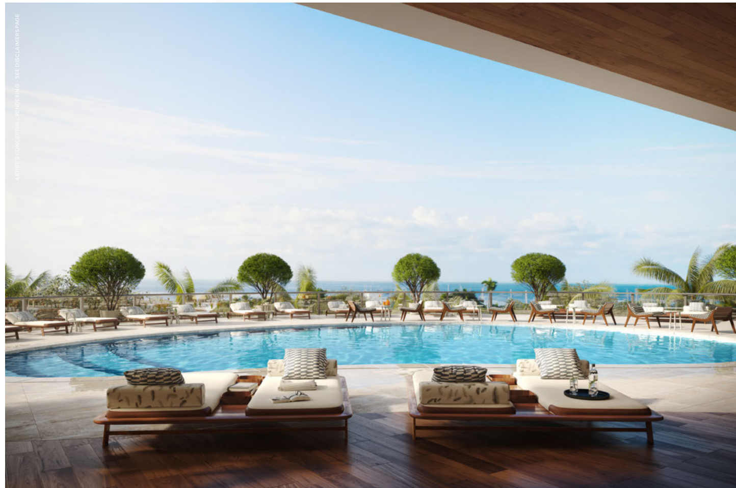
Bayshore Club Pool Deck

Personalized services, including a 24-hour concierge, are complemented by a host of amenities at Mr. C Residences Coconut Grove.