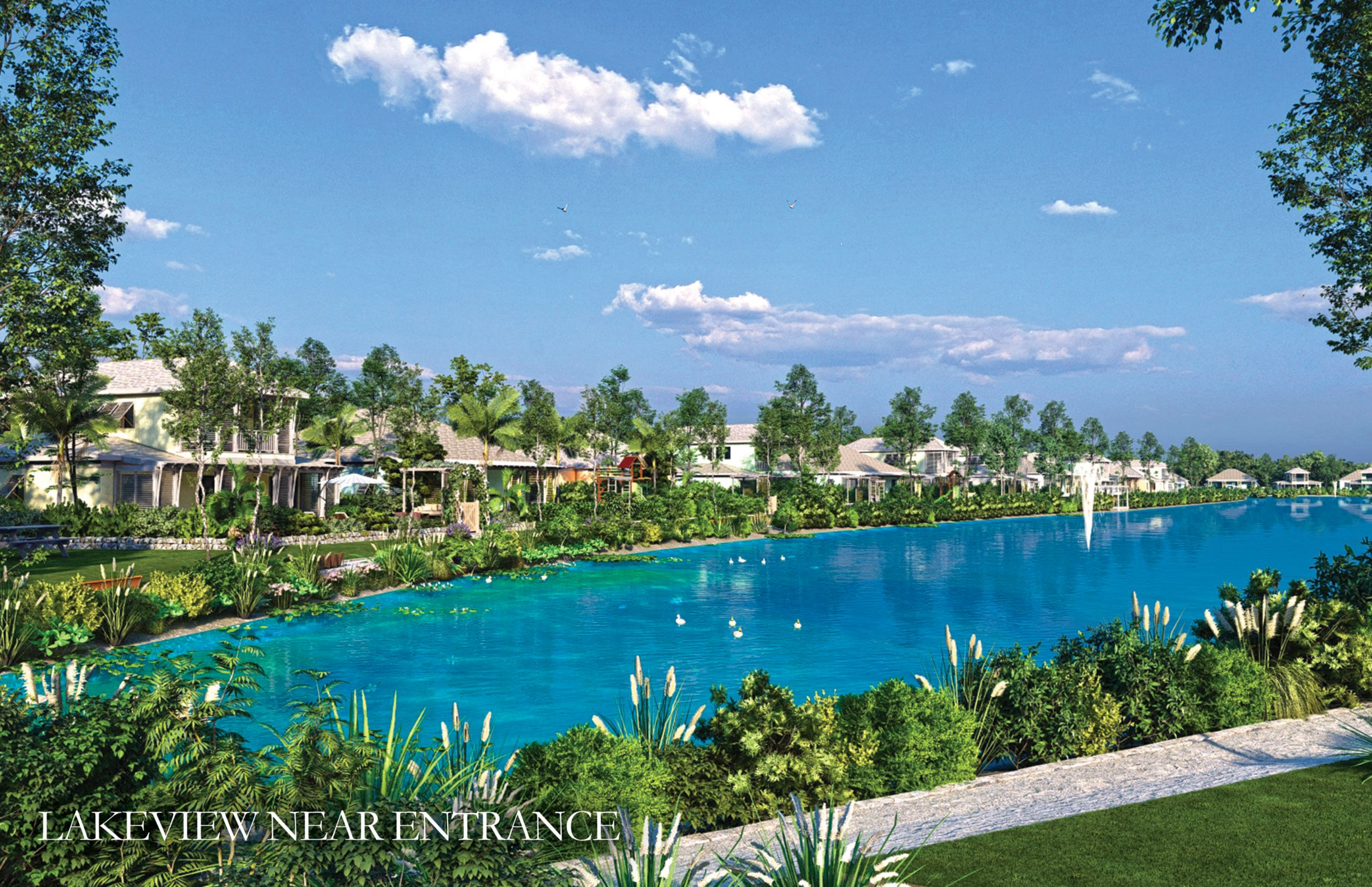
LAKEVIEW NEAR ENTRANCE