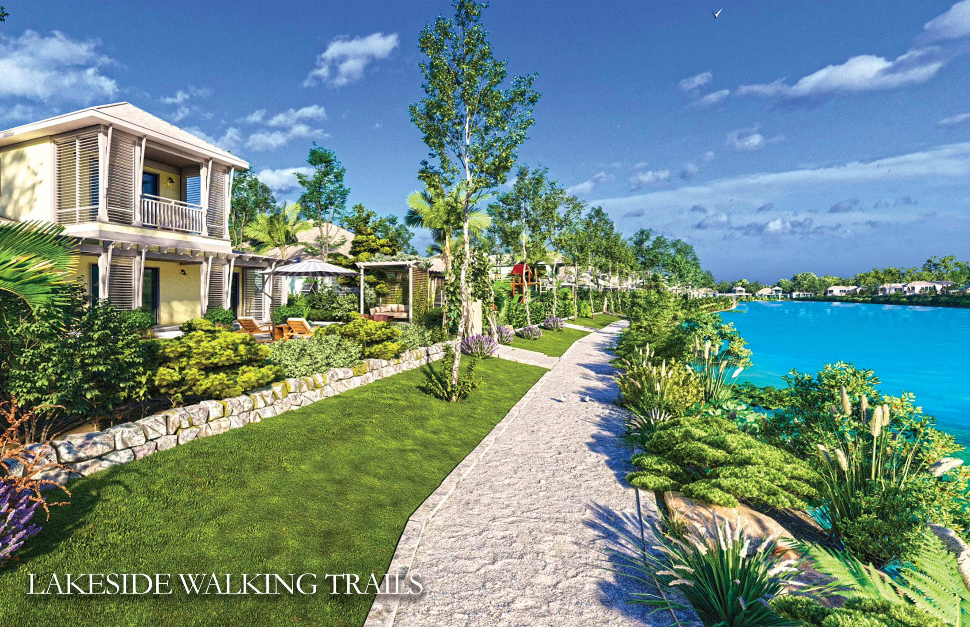
LAKE SIDE WALKING TRAILS