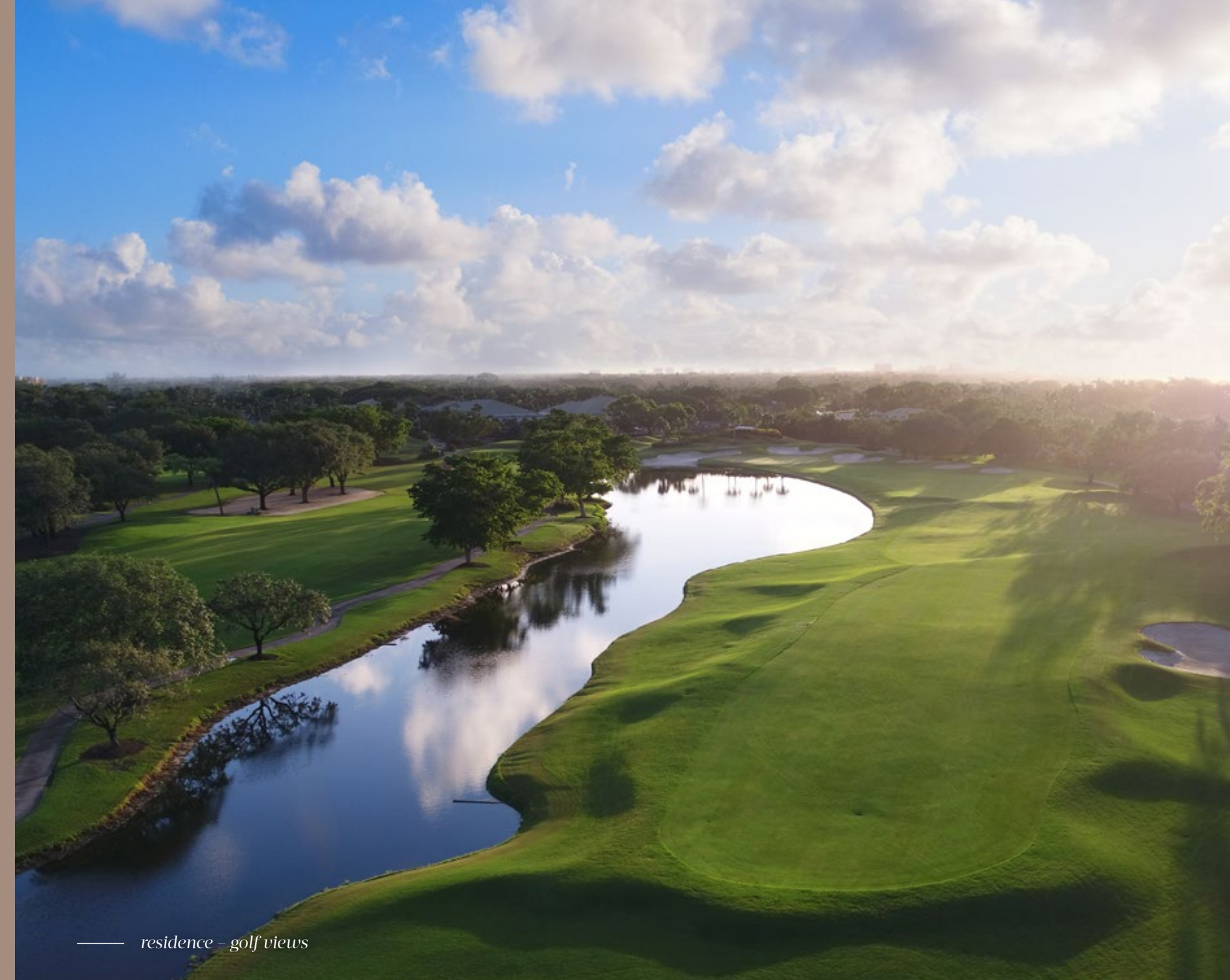
— residence — golf views