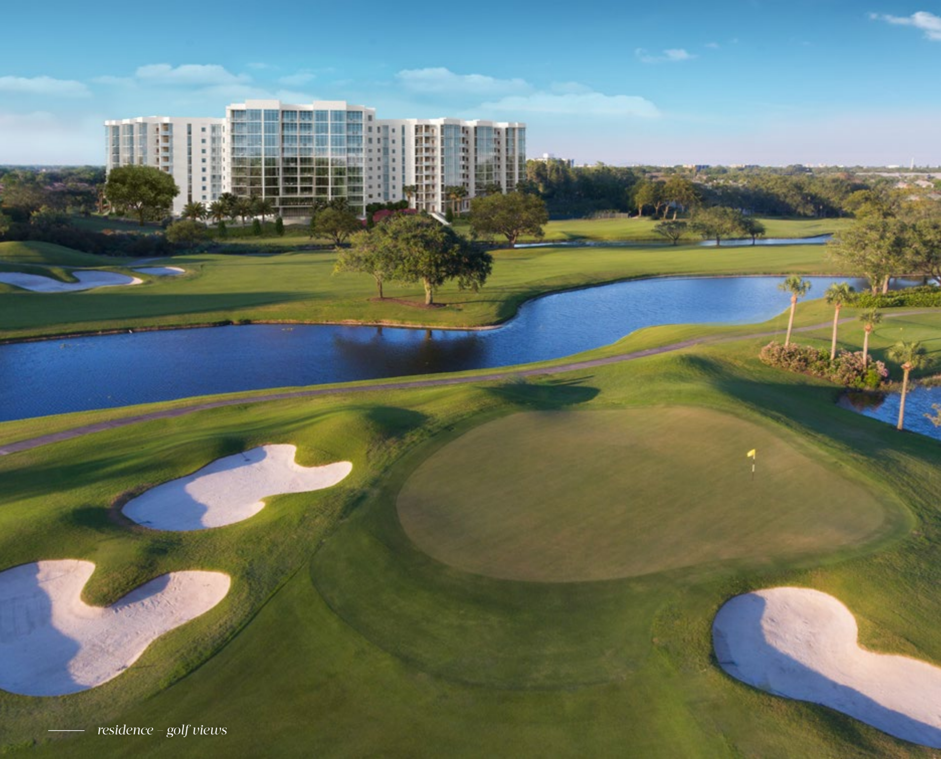
— residence – golf views