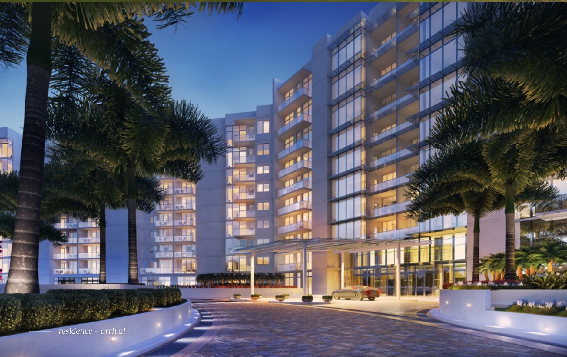
— residence – arrival