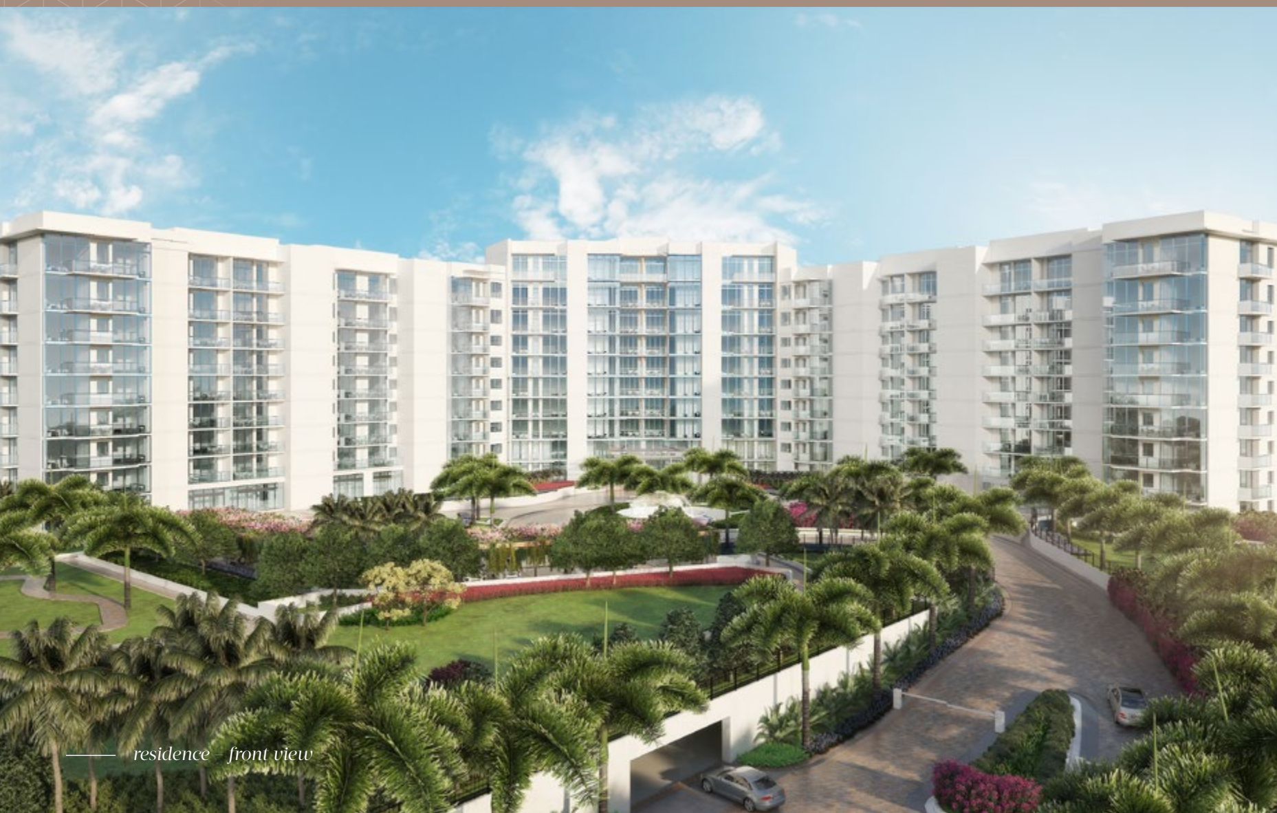
— residence — front view