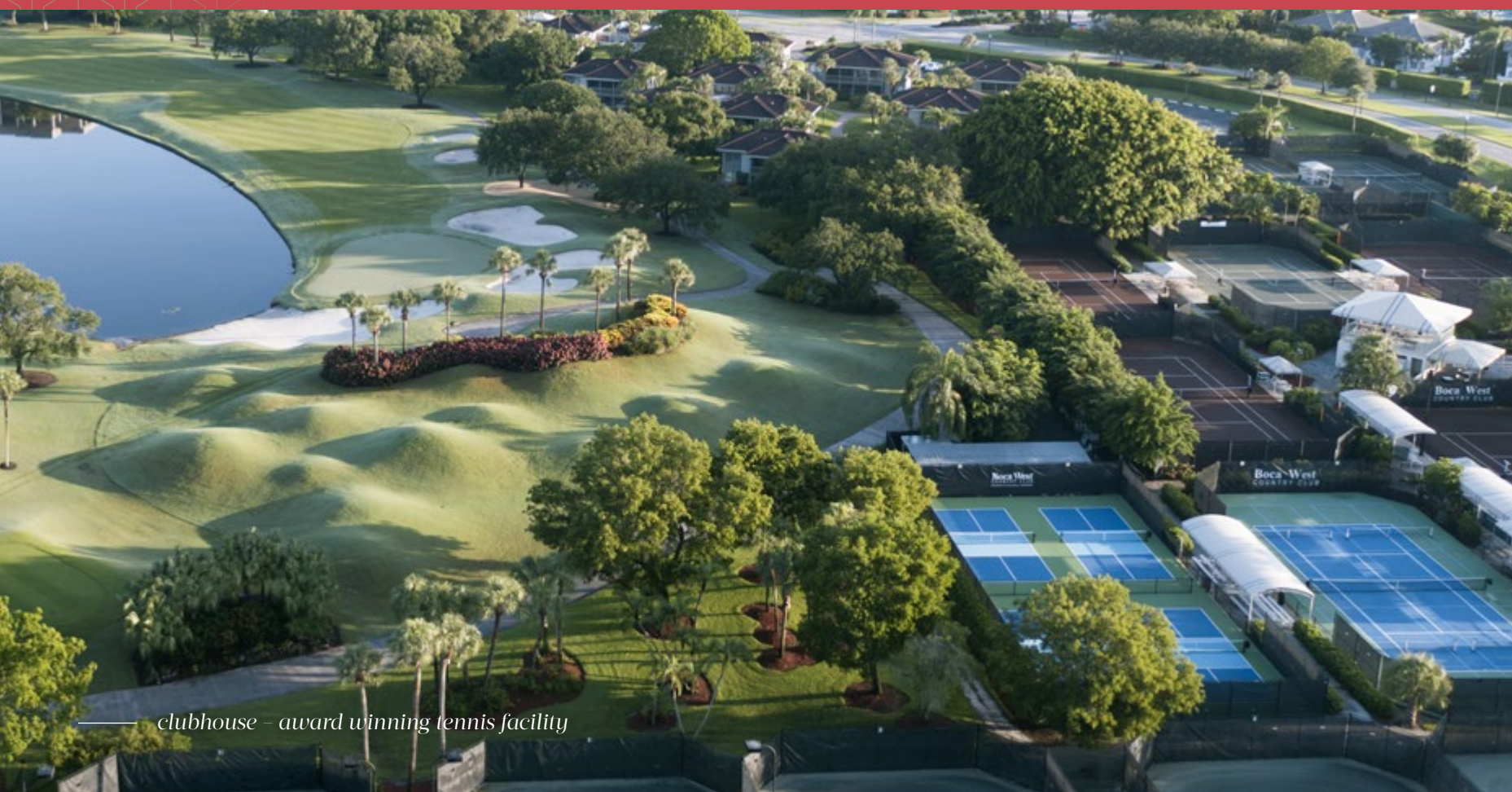
clubhouse — award winning tennis facility