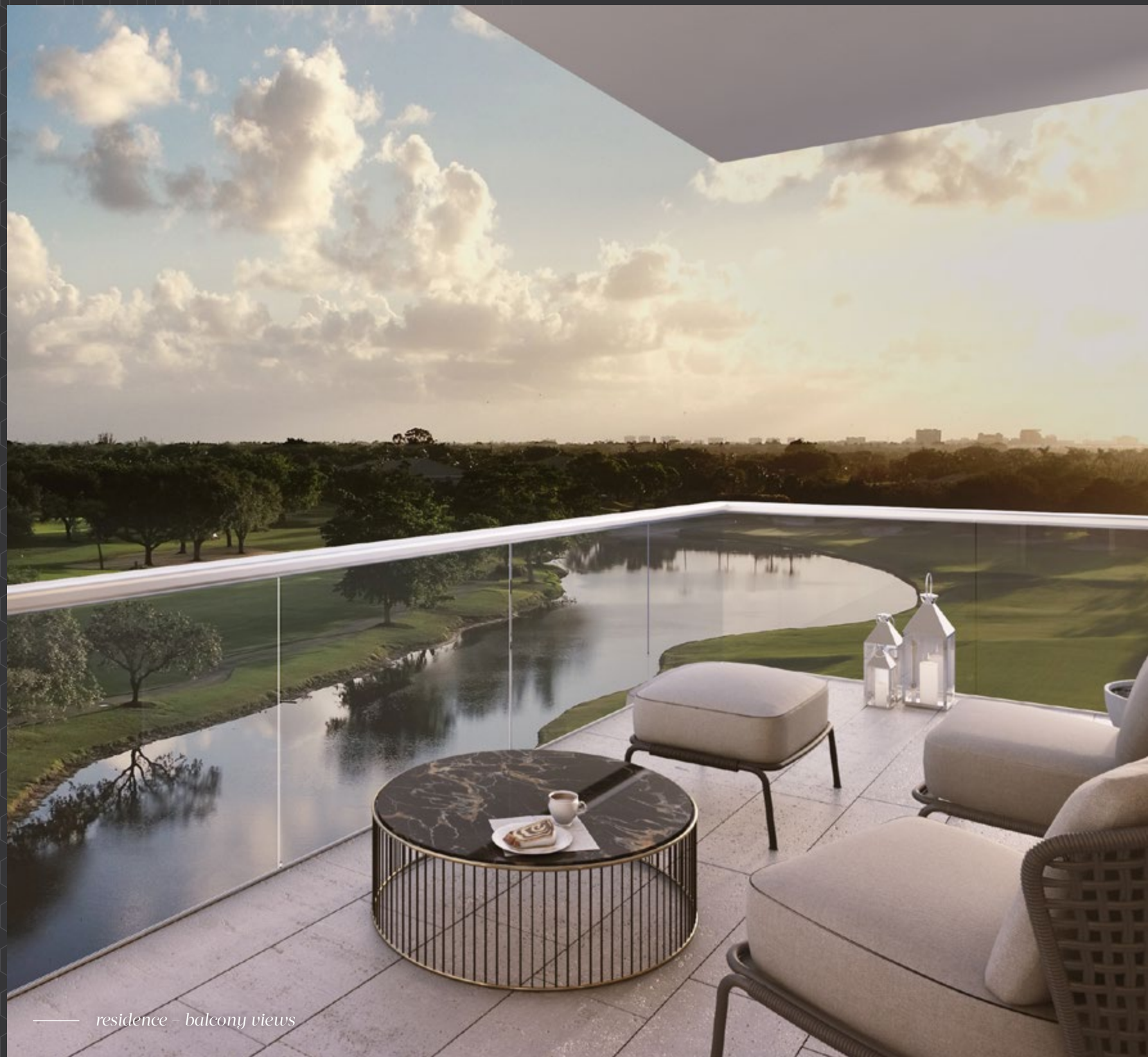
residence - balcony views