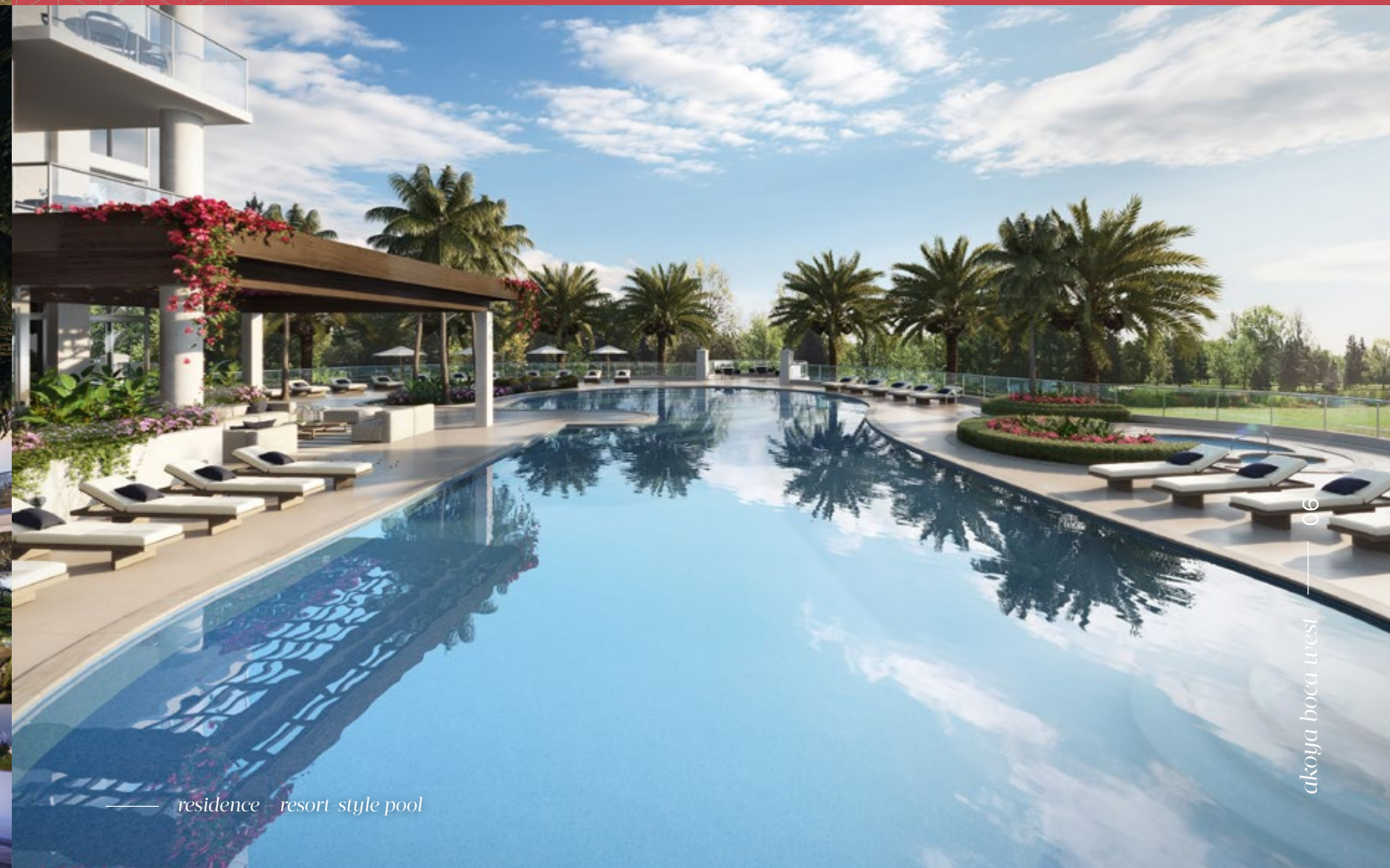
— residence – resort style pool