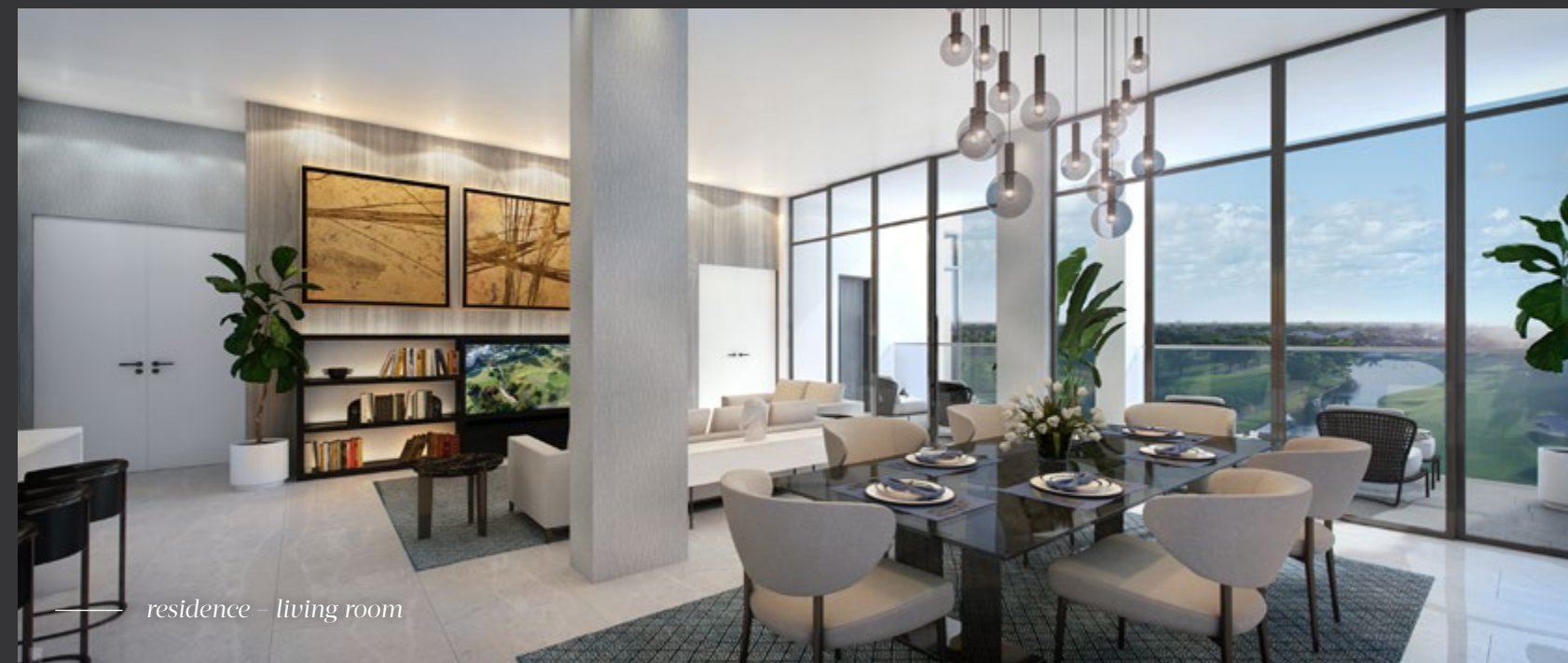
residence - living room