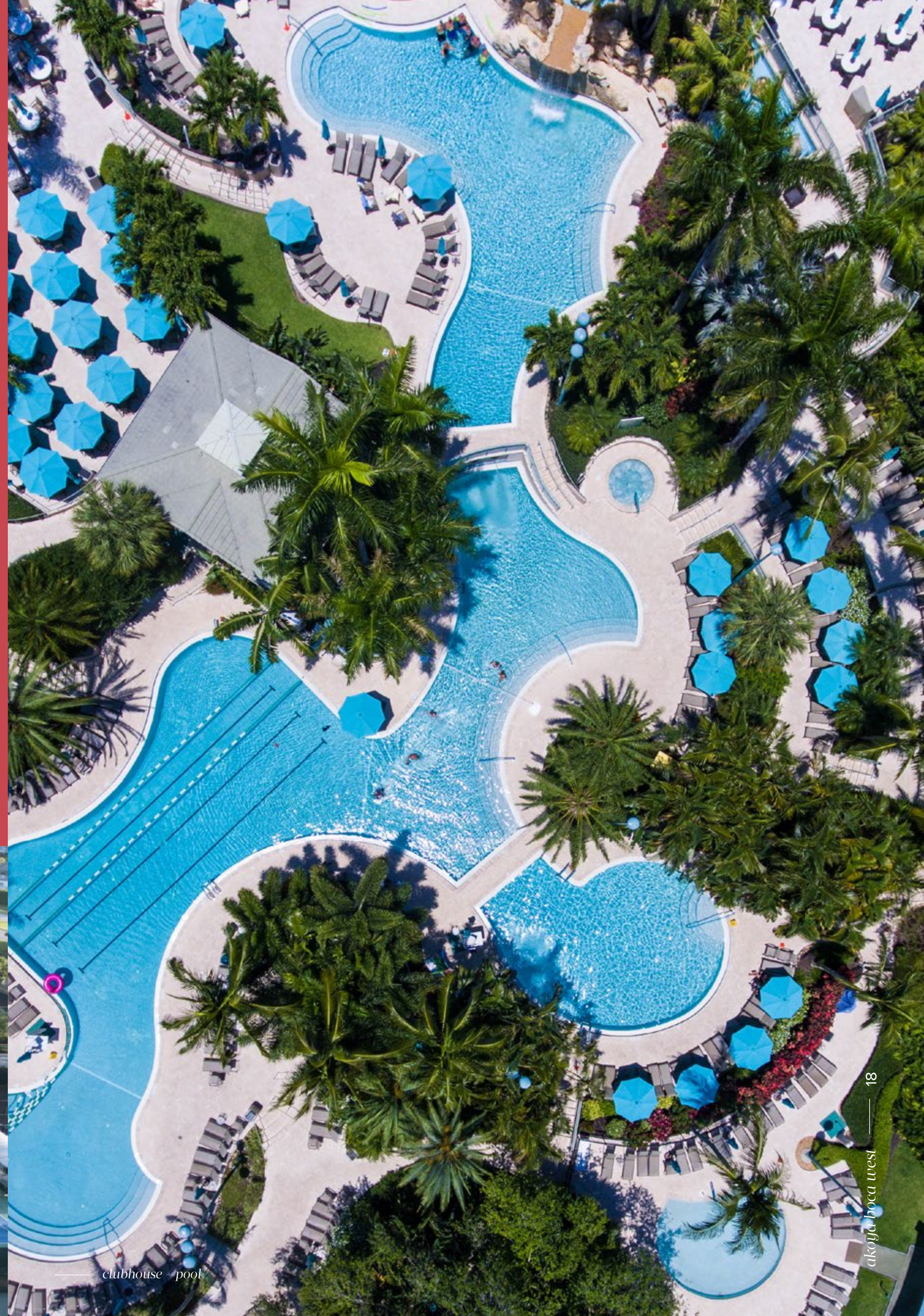
clubhouse — pool