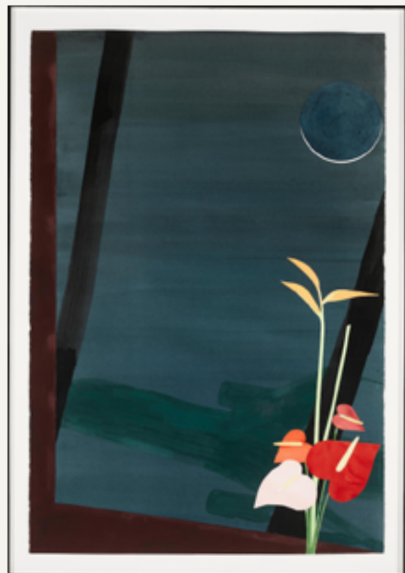
Billy Al Bengston, Ka'ao watercolor (1984) WATERCOLOR AND COLLAGE ON PAPER