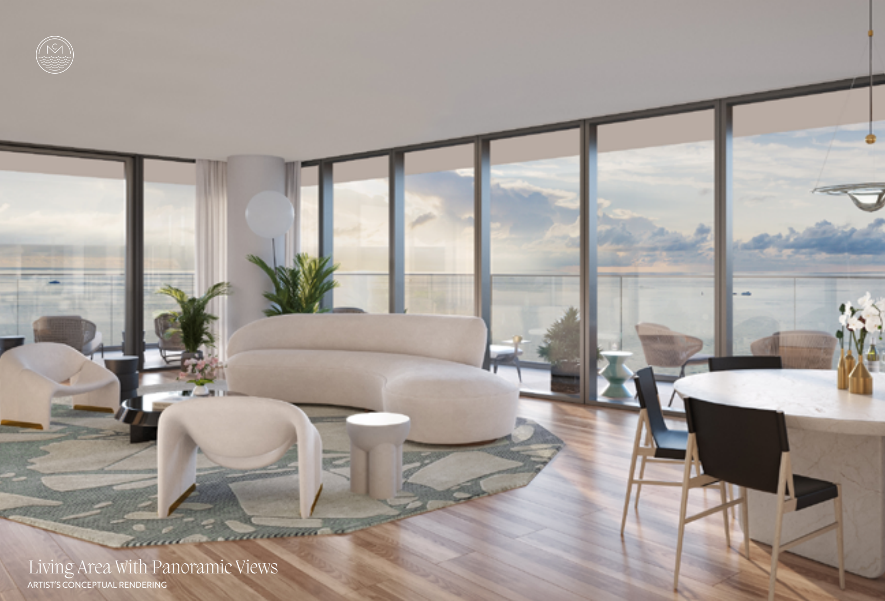
Living Area With Panoramic Views ARTIST'S CONCEPTUAL RENDERING