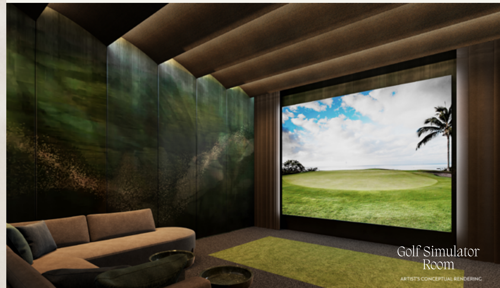
Golf Simulator Room