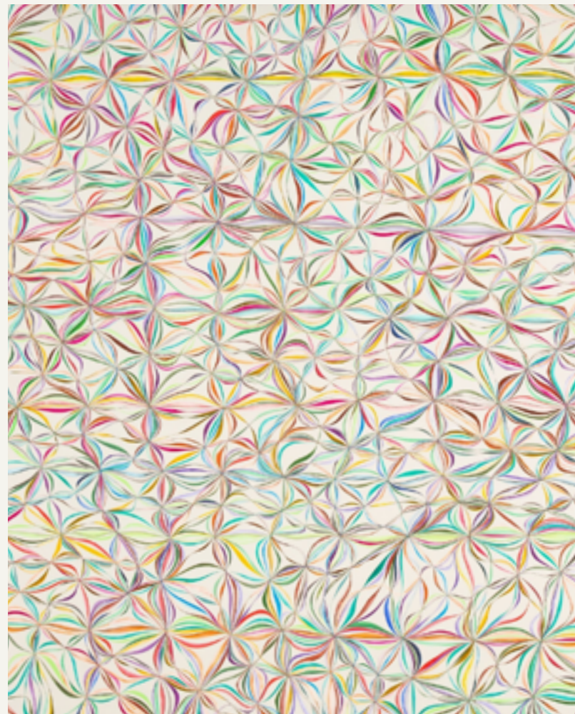
Caetano de Almeida, Murta (2016) ACRYLIC ON CANVAS