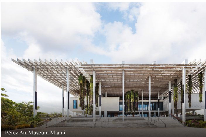
Pérez Art Museum Miami