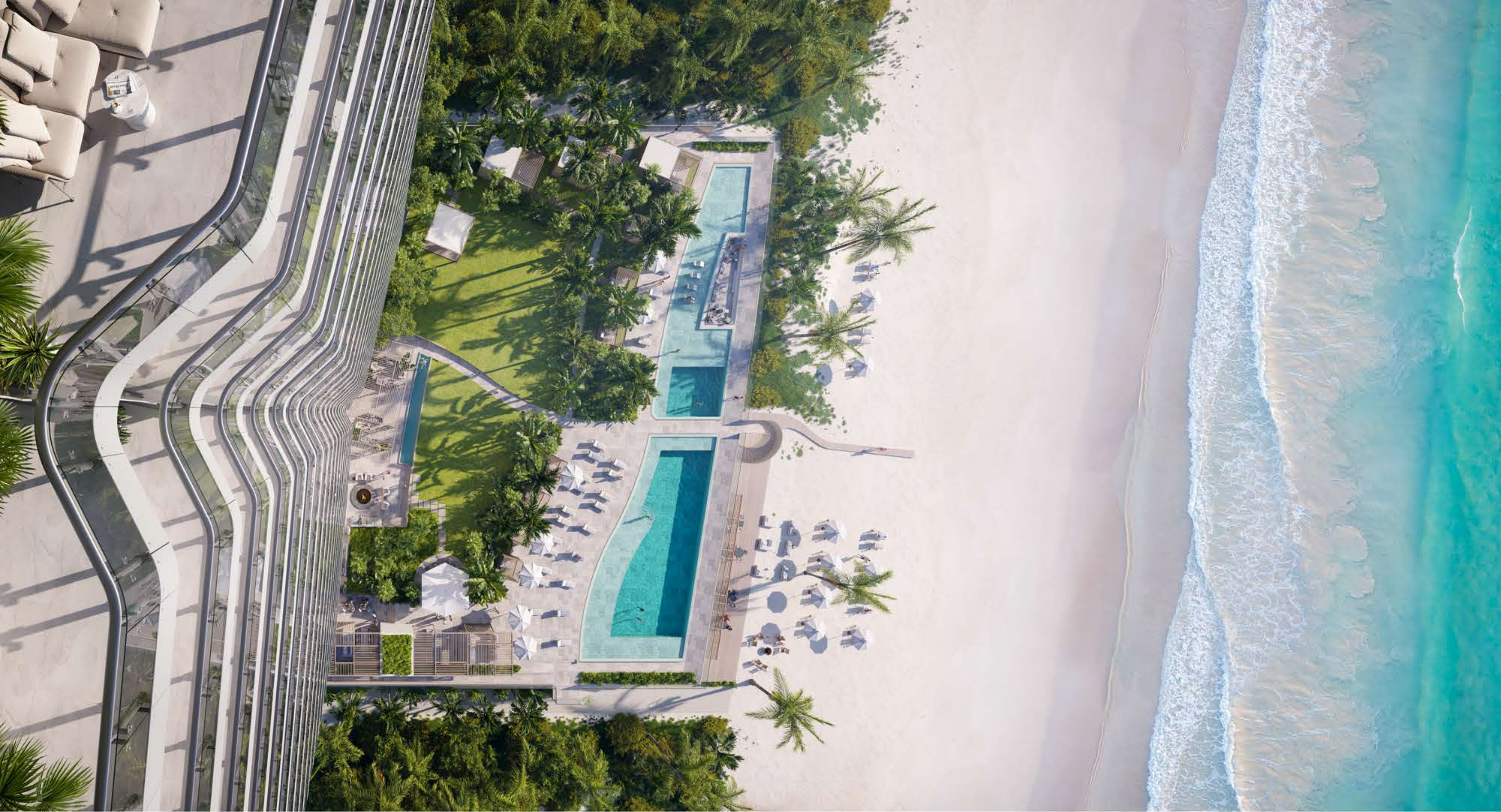
Soaring above the pristine white sands of Pompano Beach, The Beach Tower presides over a veritable playground of exquisite outdoor amenities, opening onto 250-linear feet of Atlantic shoreline.