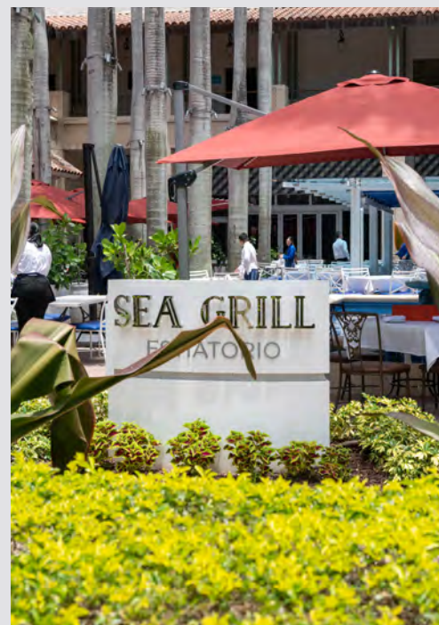
THE SHOPS AT MERRICK PARK