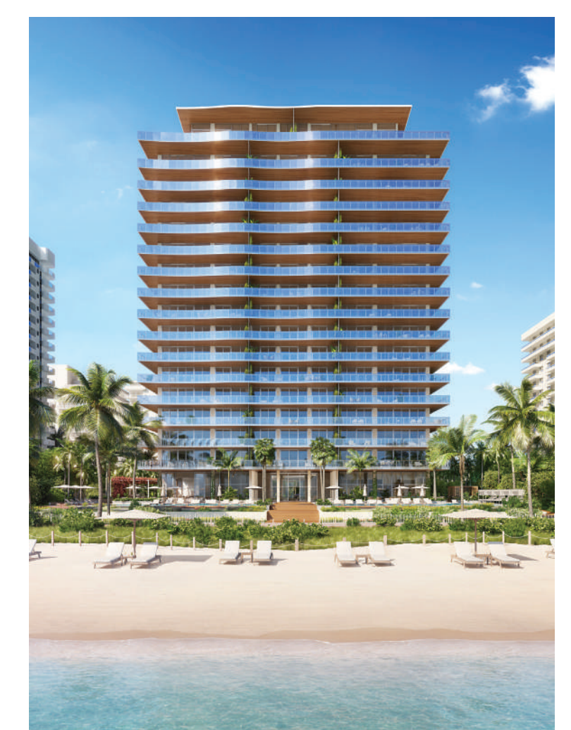
57 Ocean 5775 Collins Avenue, Miami Beach