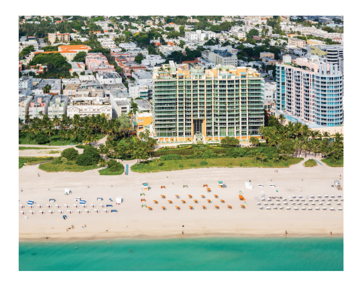
Il Villaggio 1455 Ocean Drive, Miami Beach