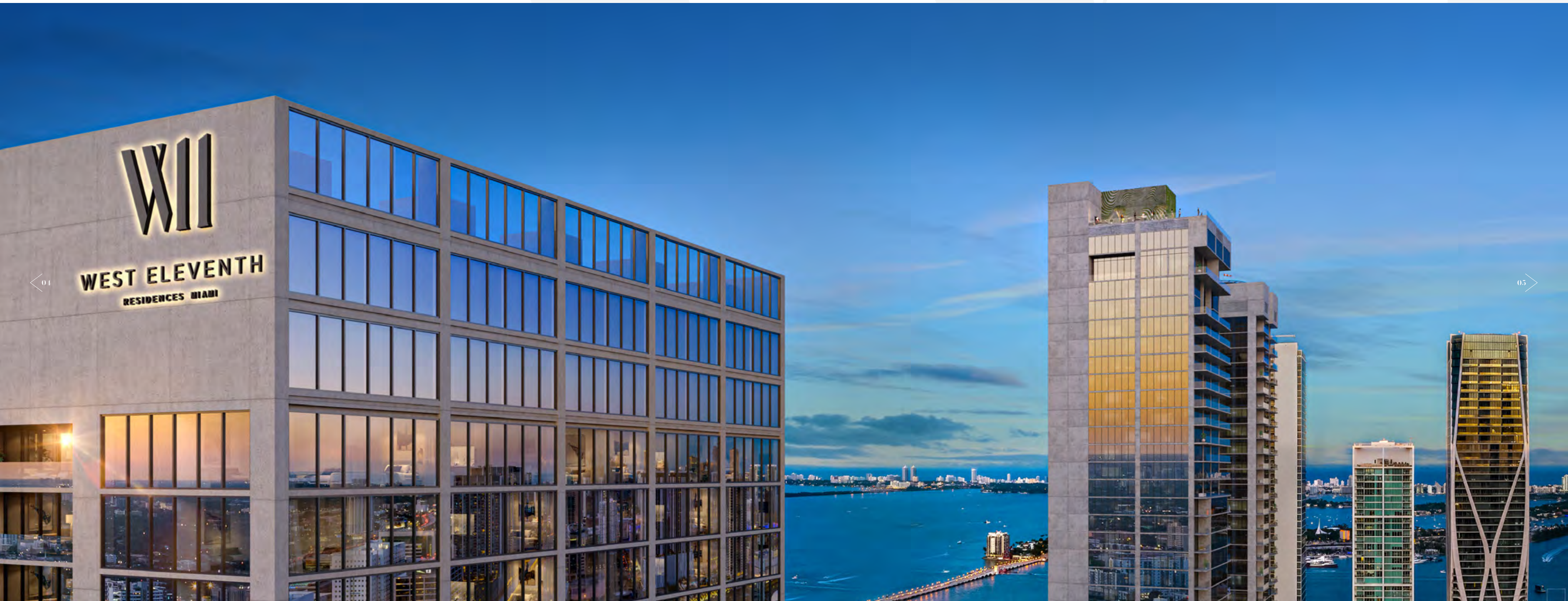
ARTIST CONCEPTUAL RENDERING

This 44-story luxury tower, was designed by internationally renowned architecture firm Sieger Suarez Architects and infused with a artistic attention throughout. From the high design lobby and state-of-the-art fitness and wellness center to the 20,000 square foot amenity level with a resort style pool and private lounges.