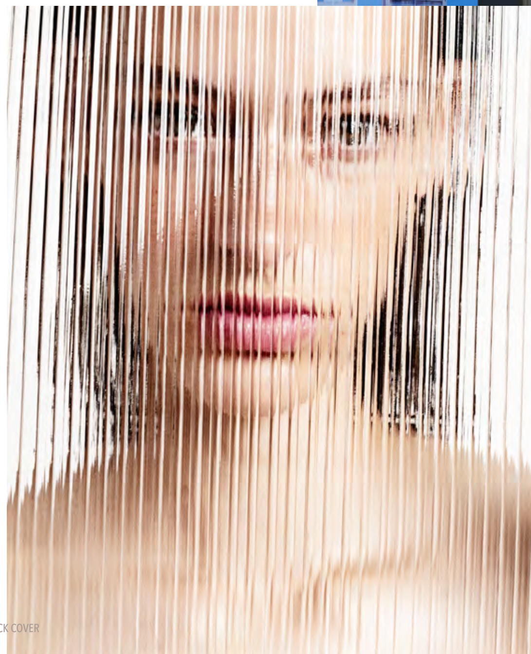
ARTIST CONCEPTUAL RENDERING