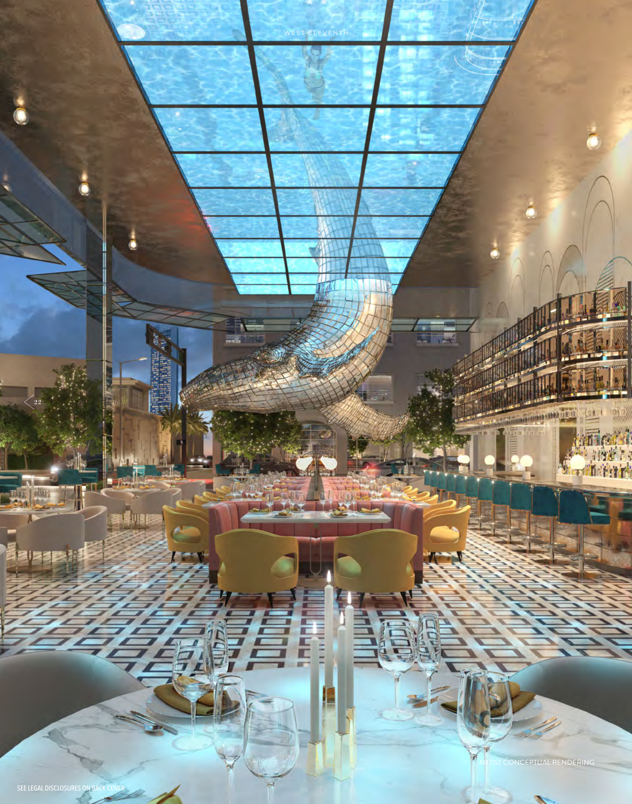
ARTIST CONCEPTUAL RENDERING