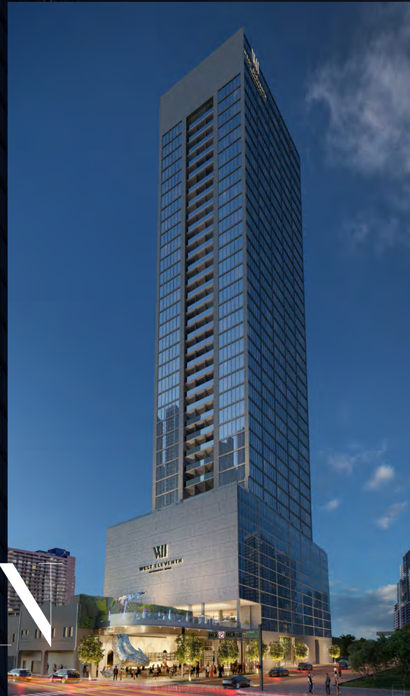
ARTIST CONCEPTUAL RENDERING