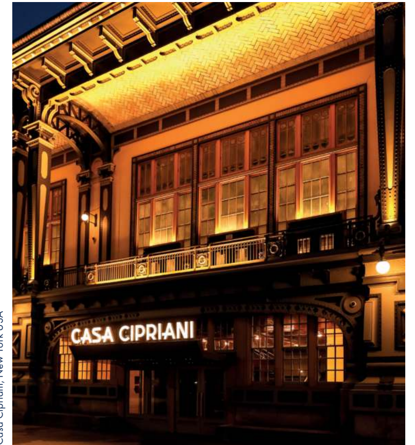
Casa Cipriani, New York USA