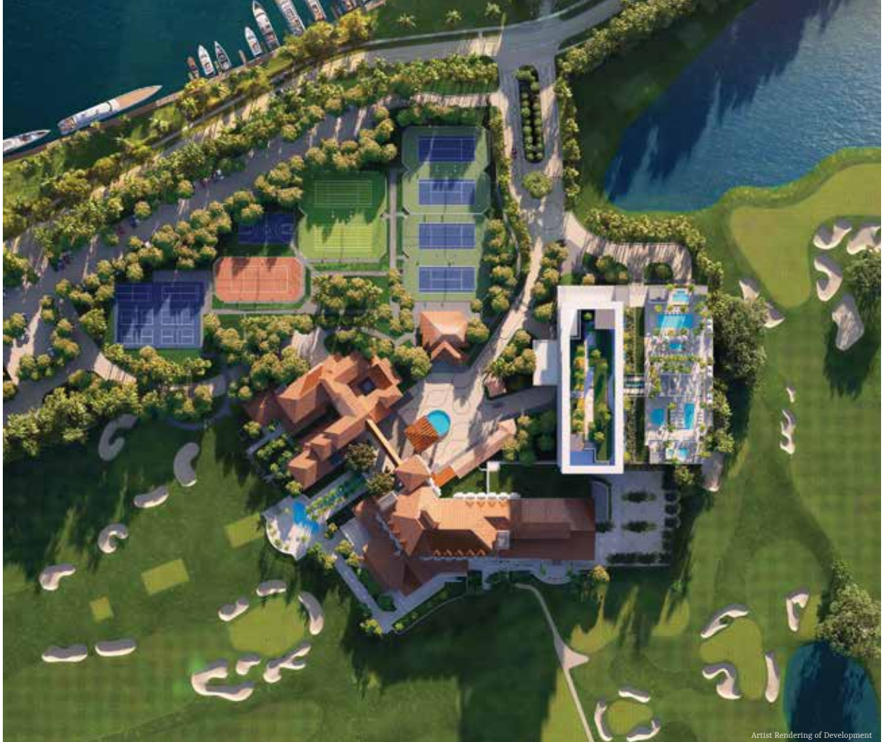
Artist Rendering of Development

Developer The Witkoff Group, PPG Development