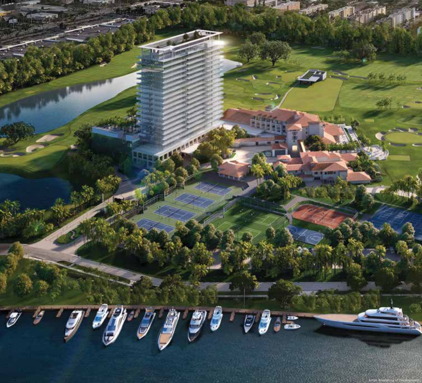
Artist Rendering of Development