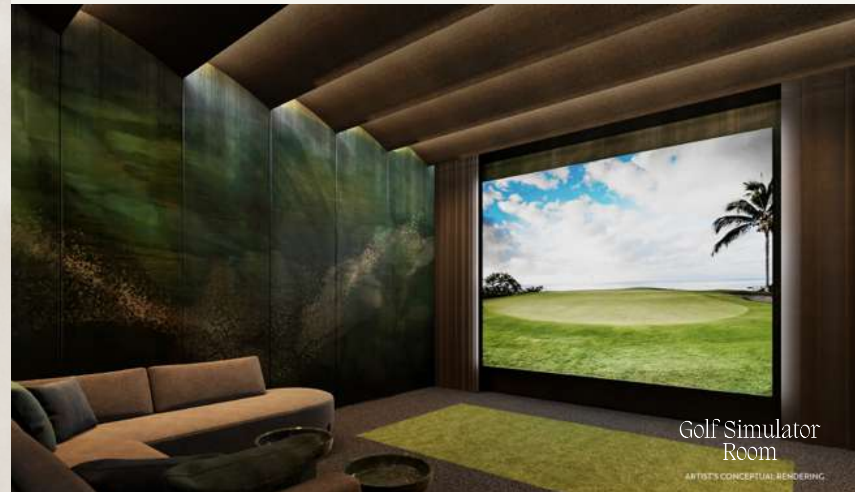
Golf Simulator Room