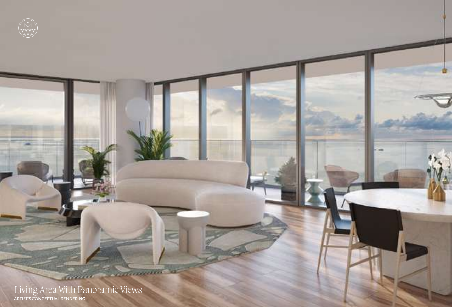
Living Area With Panoramic Views ARTIST'S CONCEPTUAL RENDERING