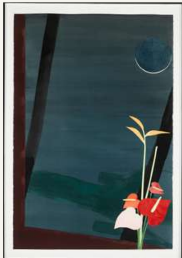
Billy Al Bengston, Ka'ao watercolor (1984) WATERCOLOR AND COLLAGE ON PAPER