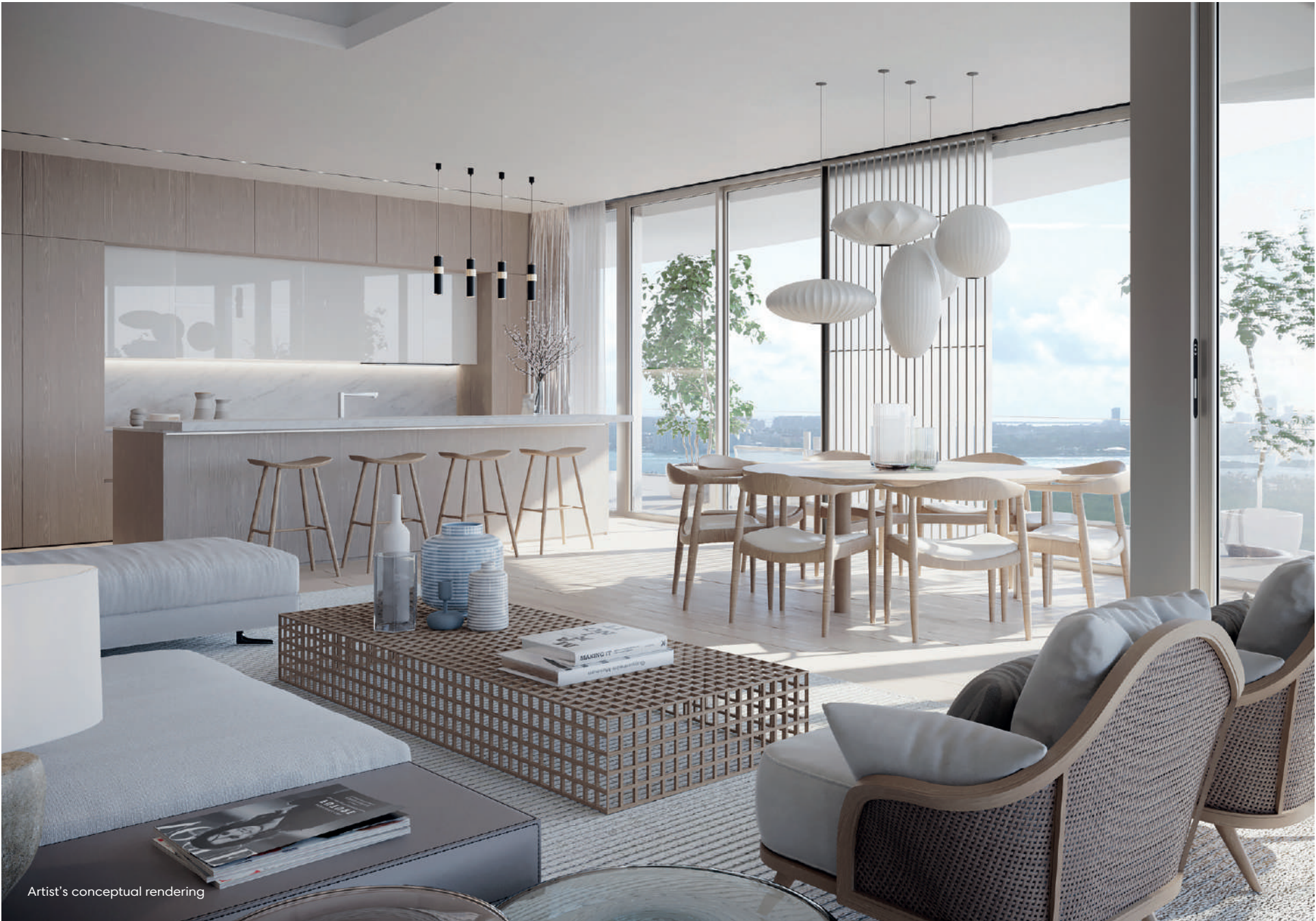
Artist's conceptual rendering