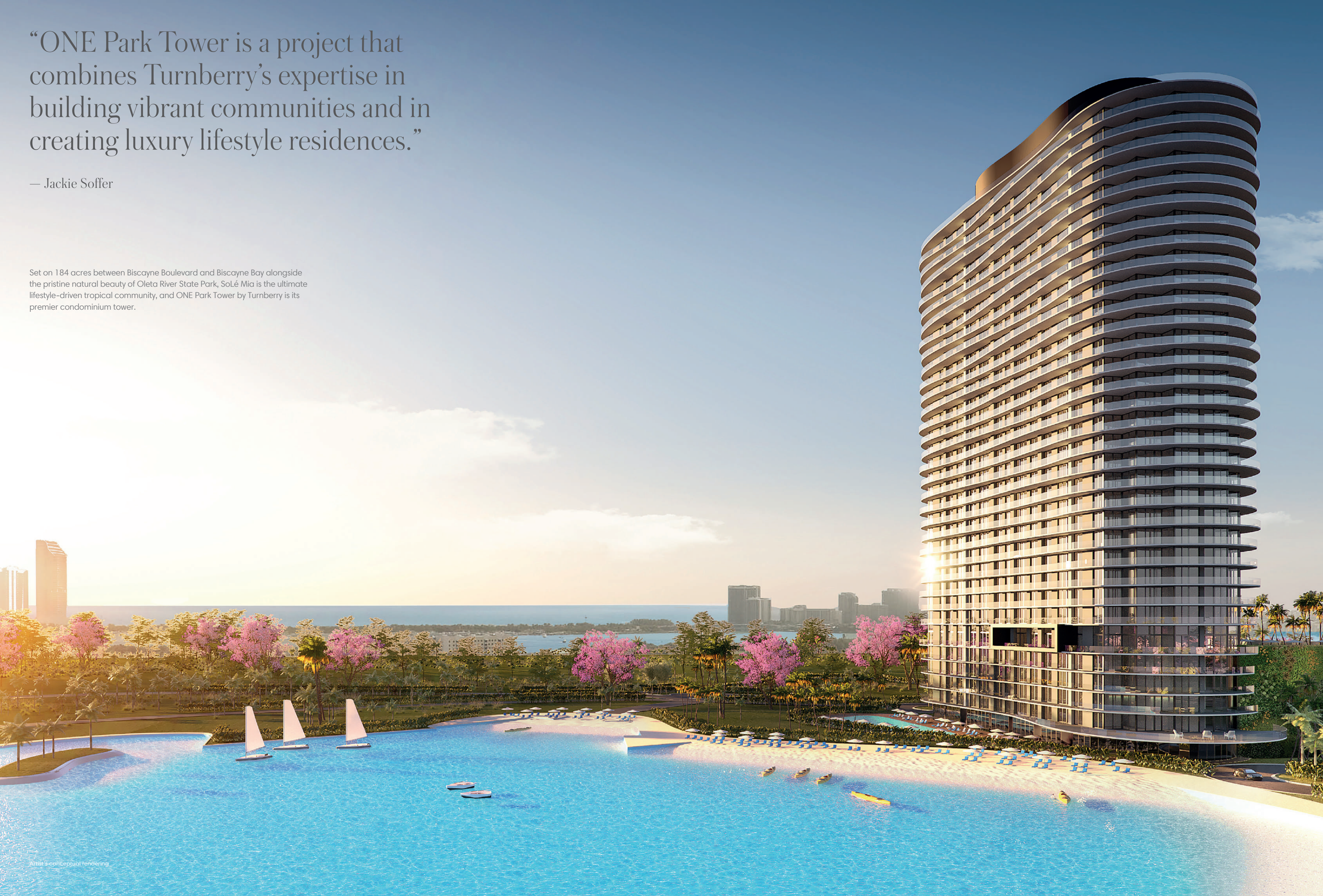
Artist's conceptual rendering

Set on 184 acres between Biscayne Boulevard and Biscayne Bay alongside the pristine natural beauty of Oleta River State Park, SoLé Mia is the ultimate lifestyle-driven tropical community, and ONE Park Tower by Turnberry is its premier condominium tower.