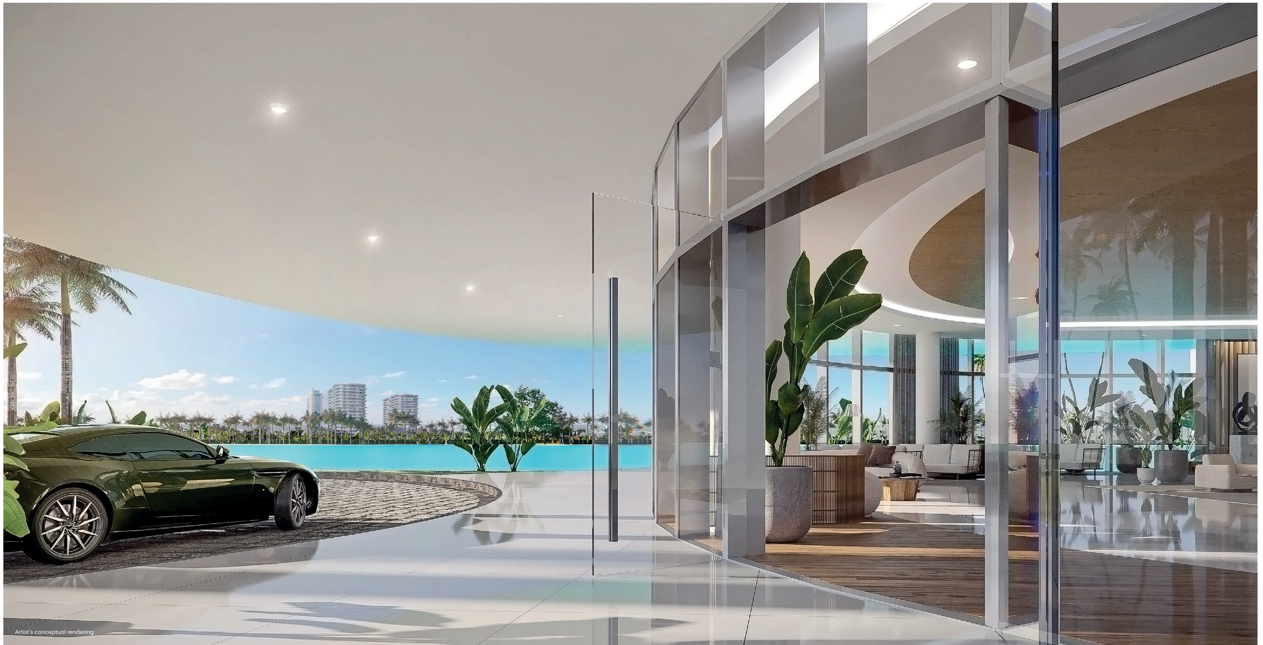
Artist's conceptual rendering