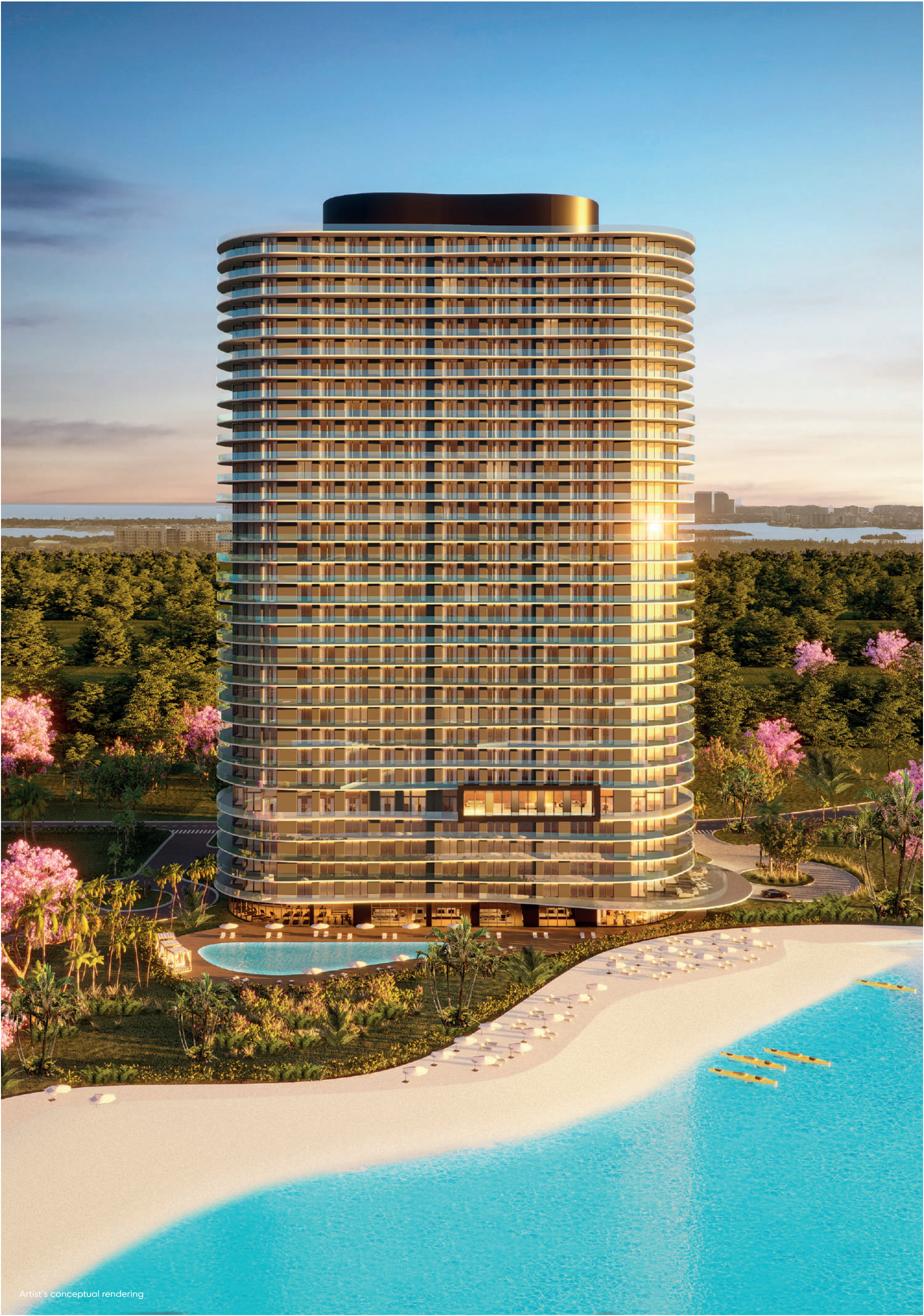
Artist's conceptual rendering