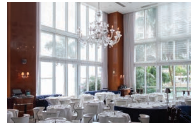
Right Page: Pérez Art Museum, Brickell Shopping, Cipriani Downtown Miami