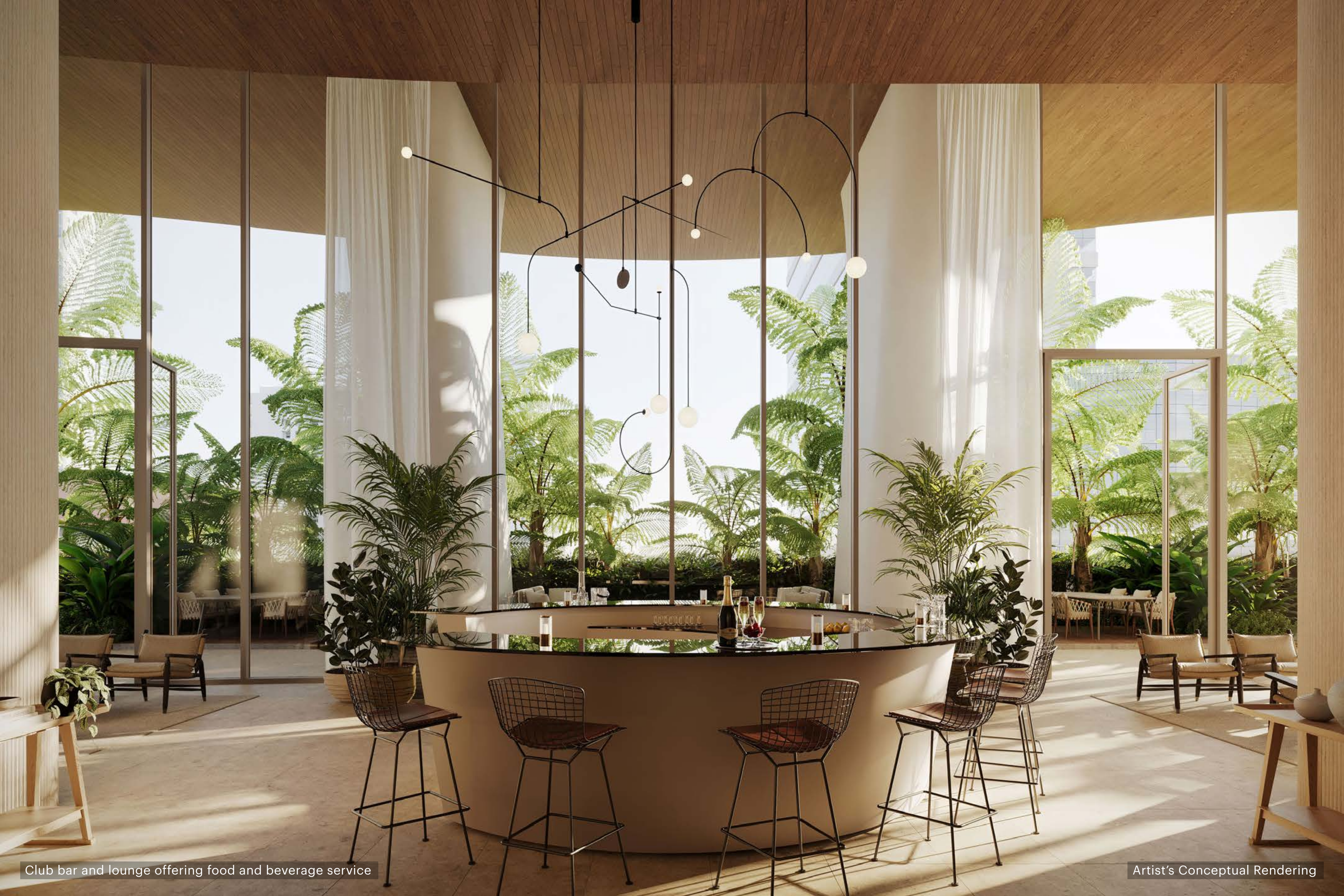
Club bar and lounge offering food and beverage service