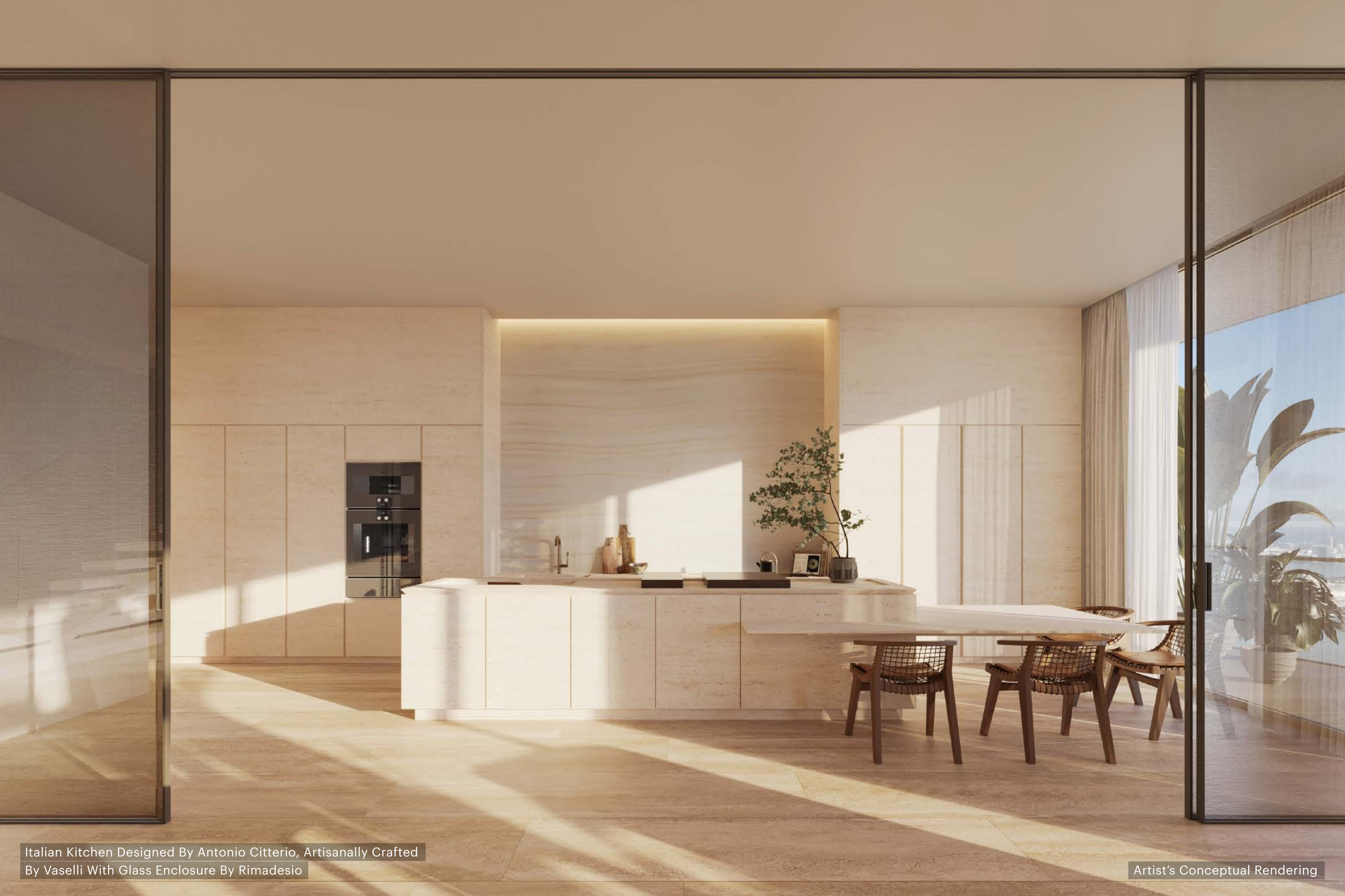
Italian Kitchen Designed By Antonio Citterio, Artisanally Crafted By Vaselli With Glass Enclosure By Rimadesio