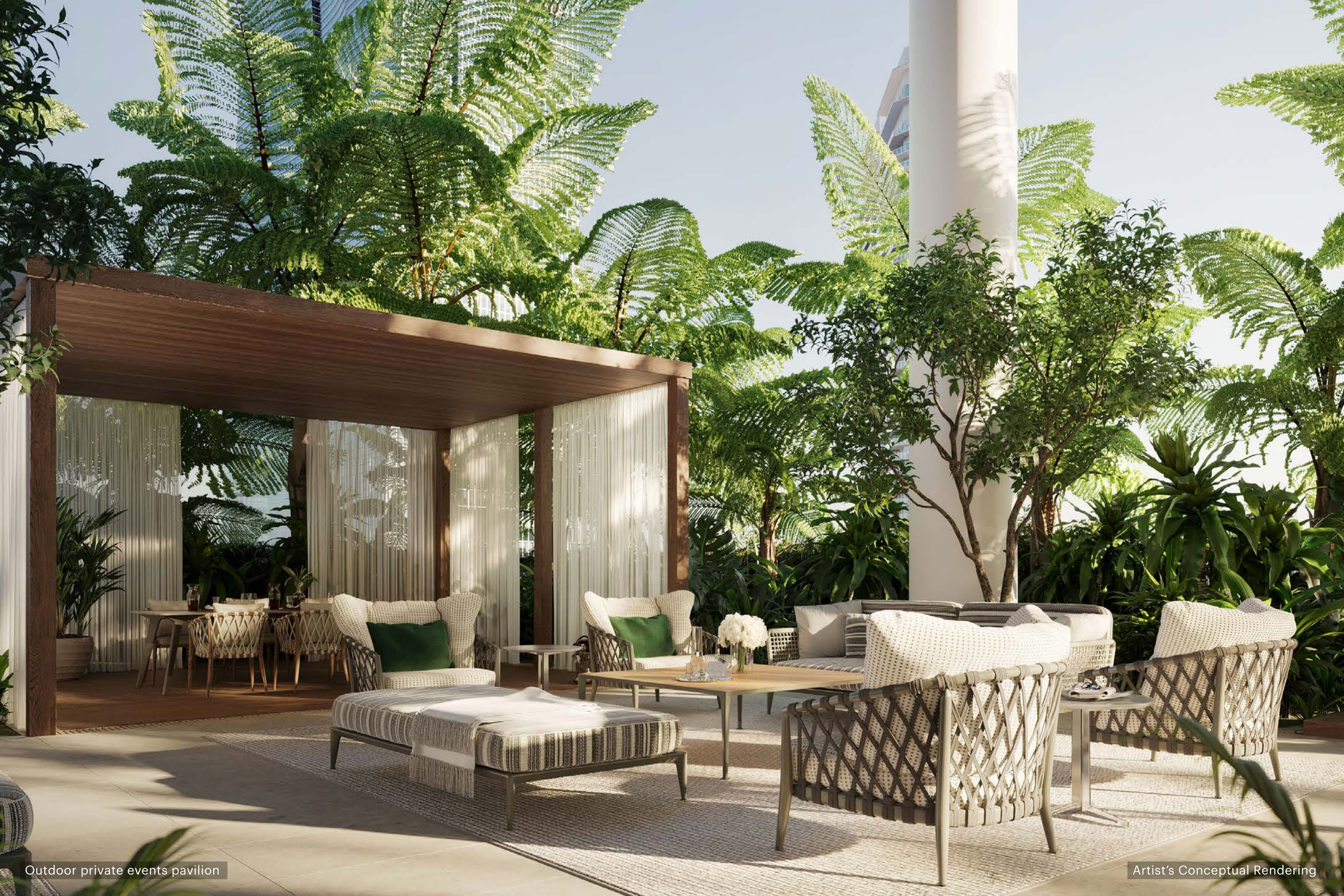
Outdoor private events pavilion