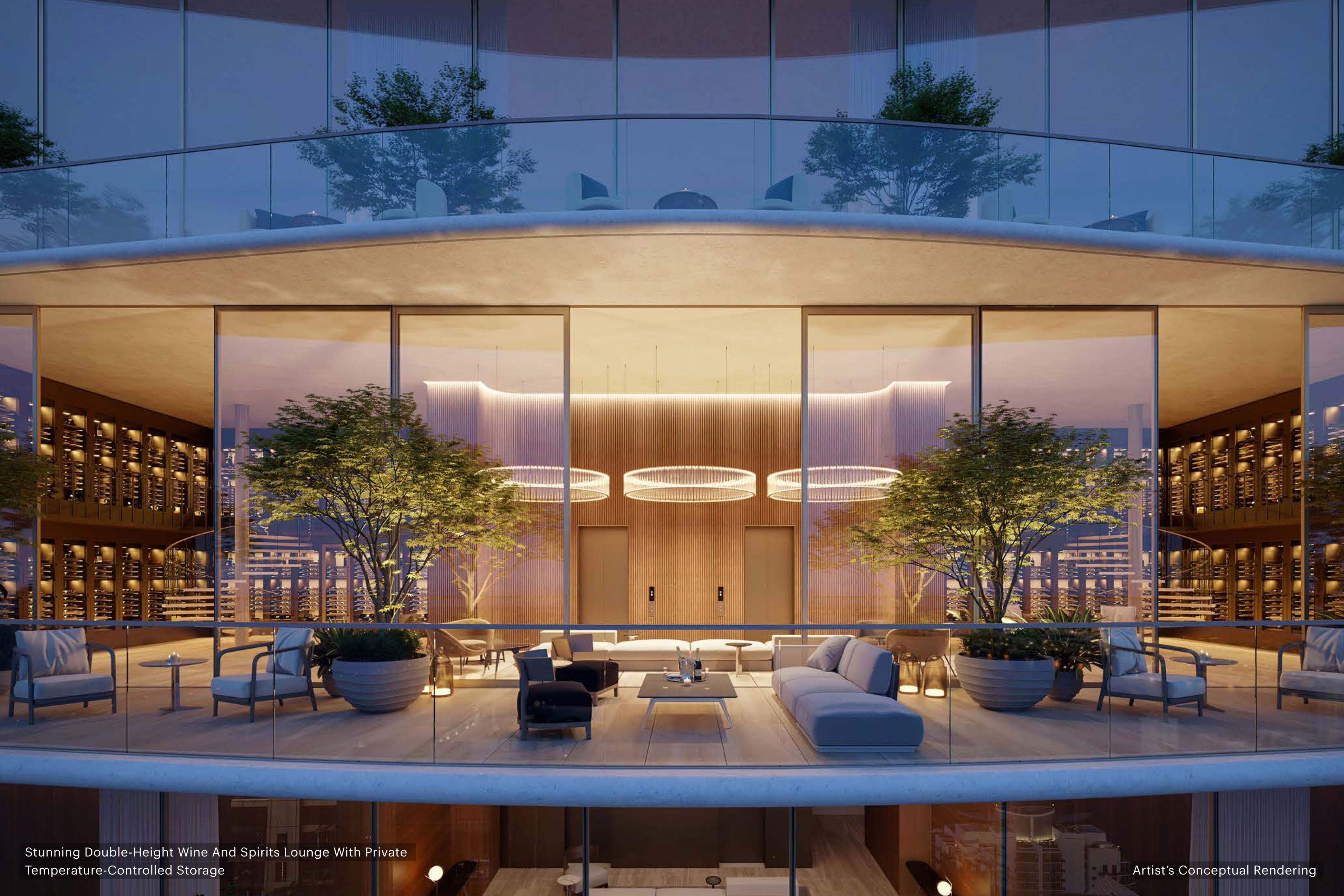
Stunning Double-Height Wine And Spirits Lounge With Private Temperature-Controlled Storage