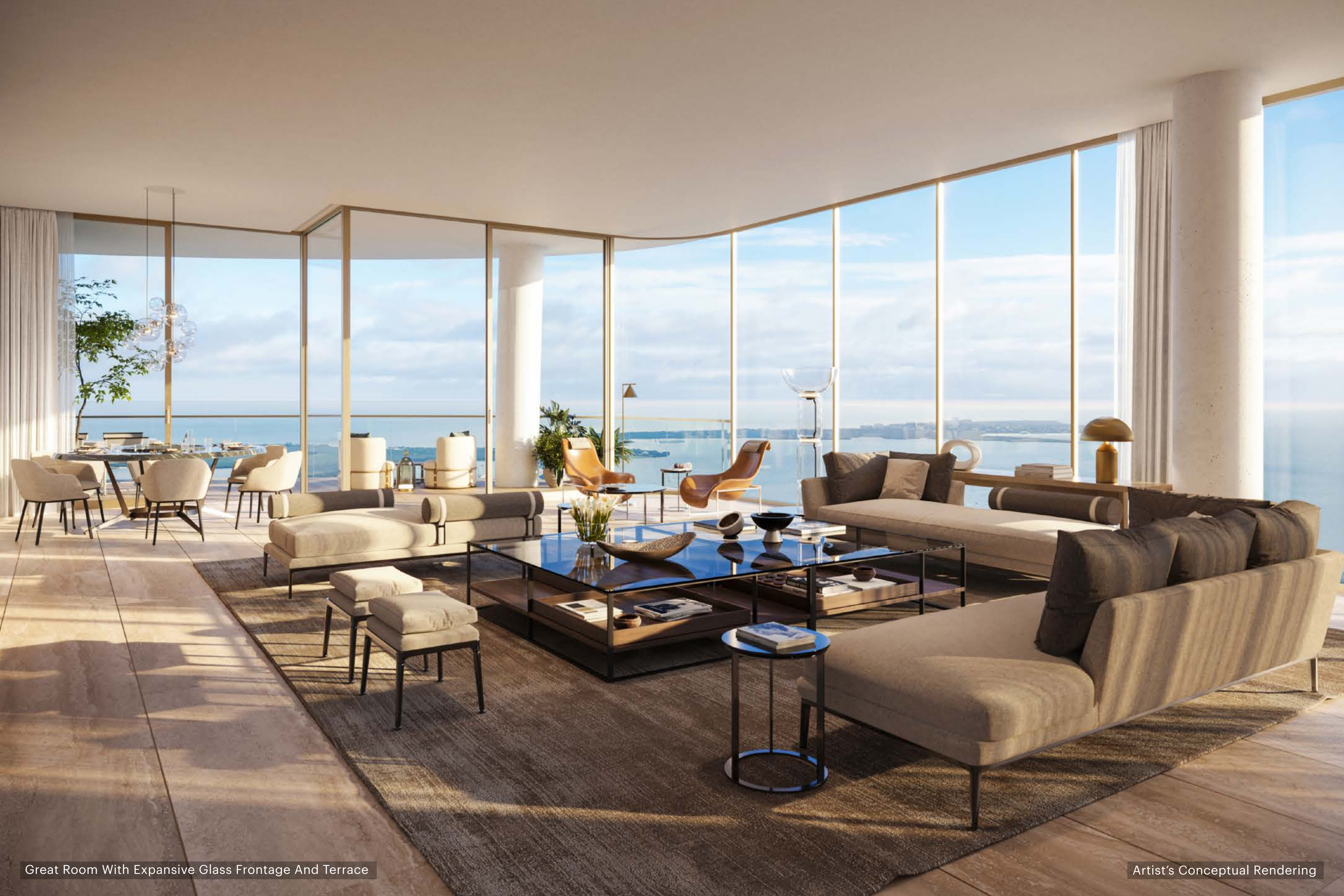
Great Room With Expansive Glass Frontage And Terrace