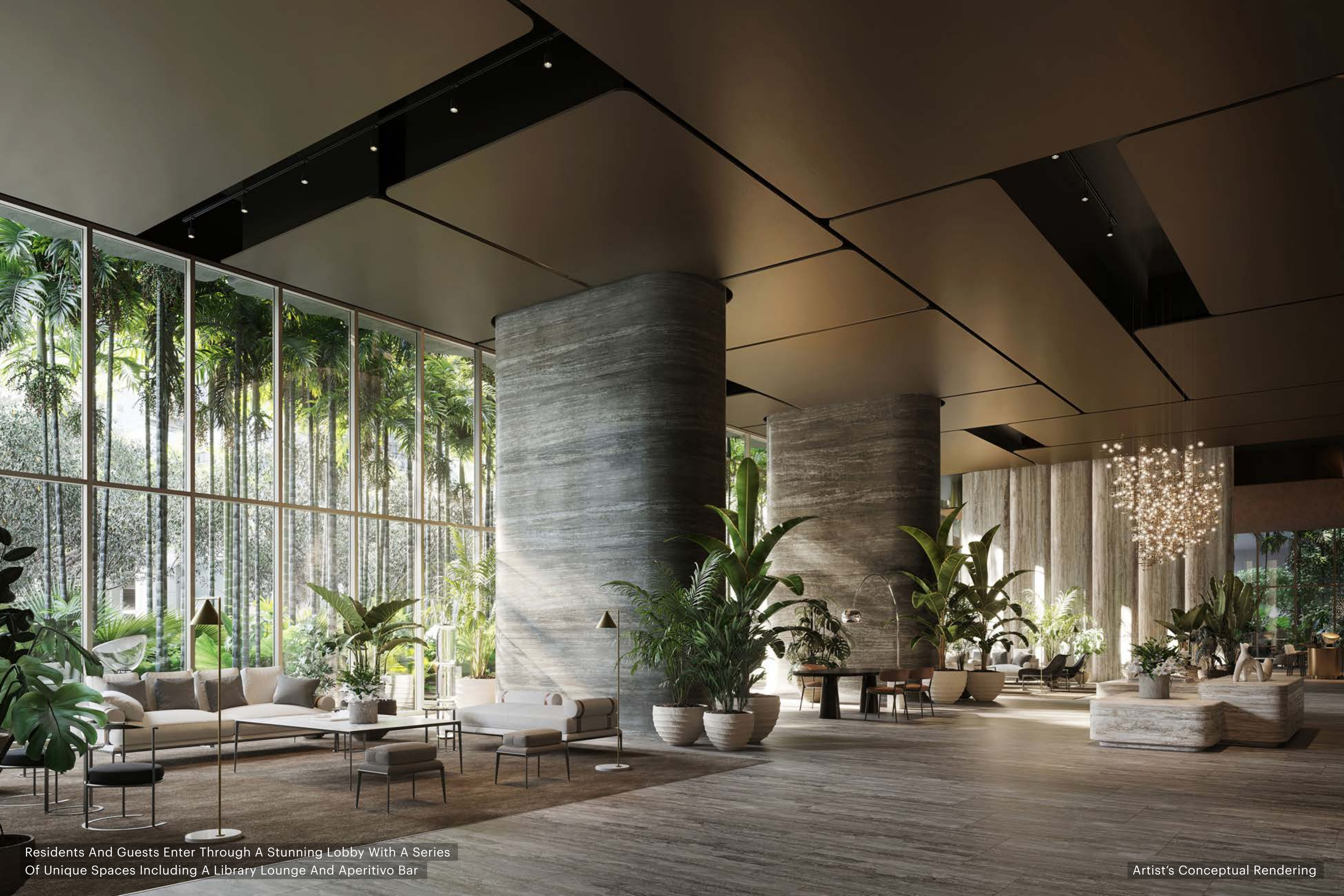
Residents And Guests Enter Through A Stunning Lobby With A Series Of Unique Spaces Including A Library Lounge And Aperitivo Bar