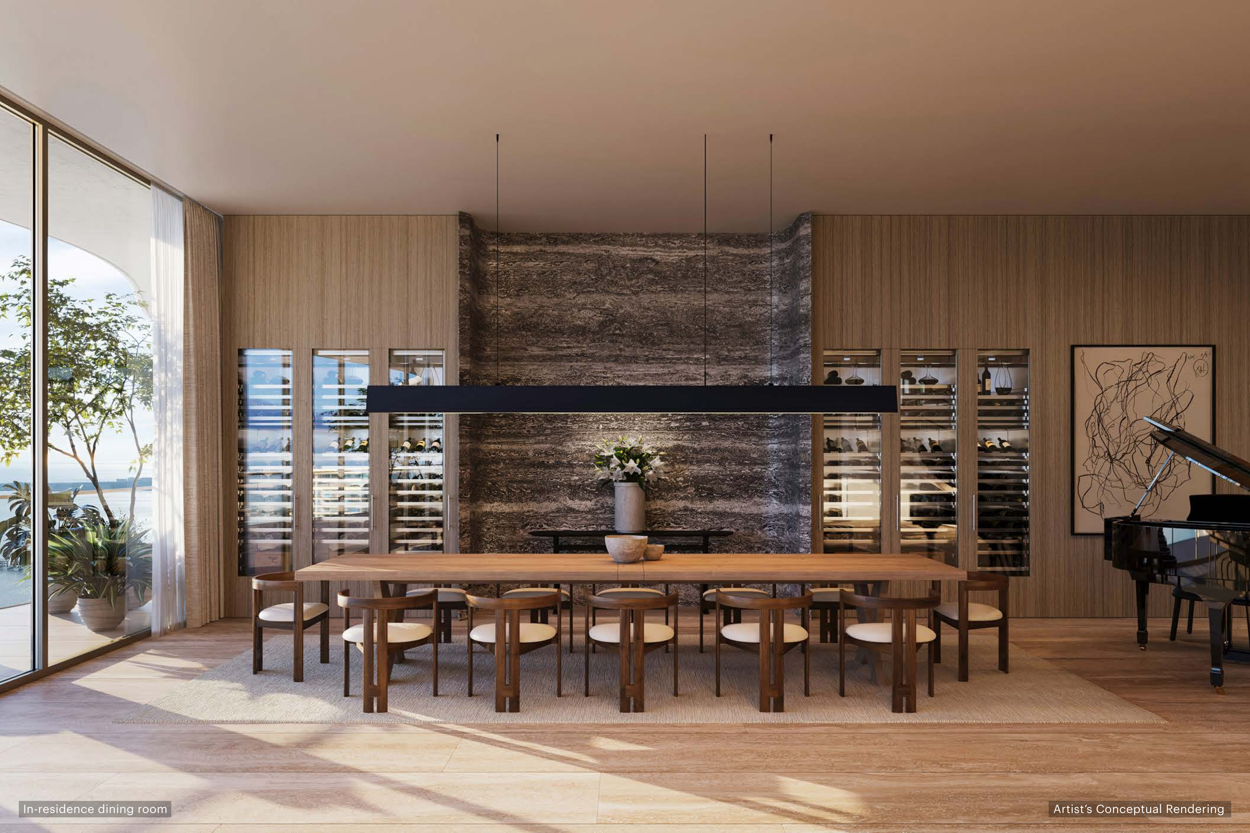
In-residence dining room