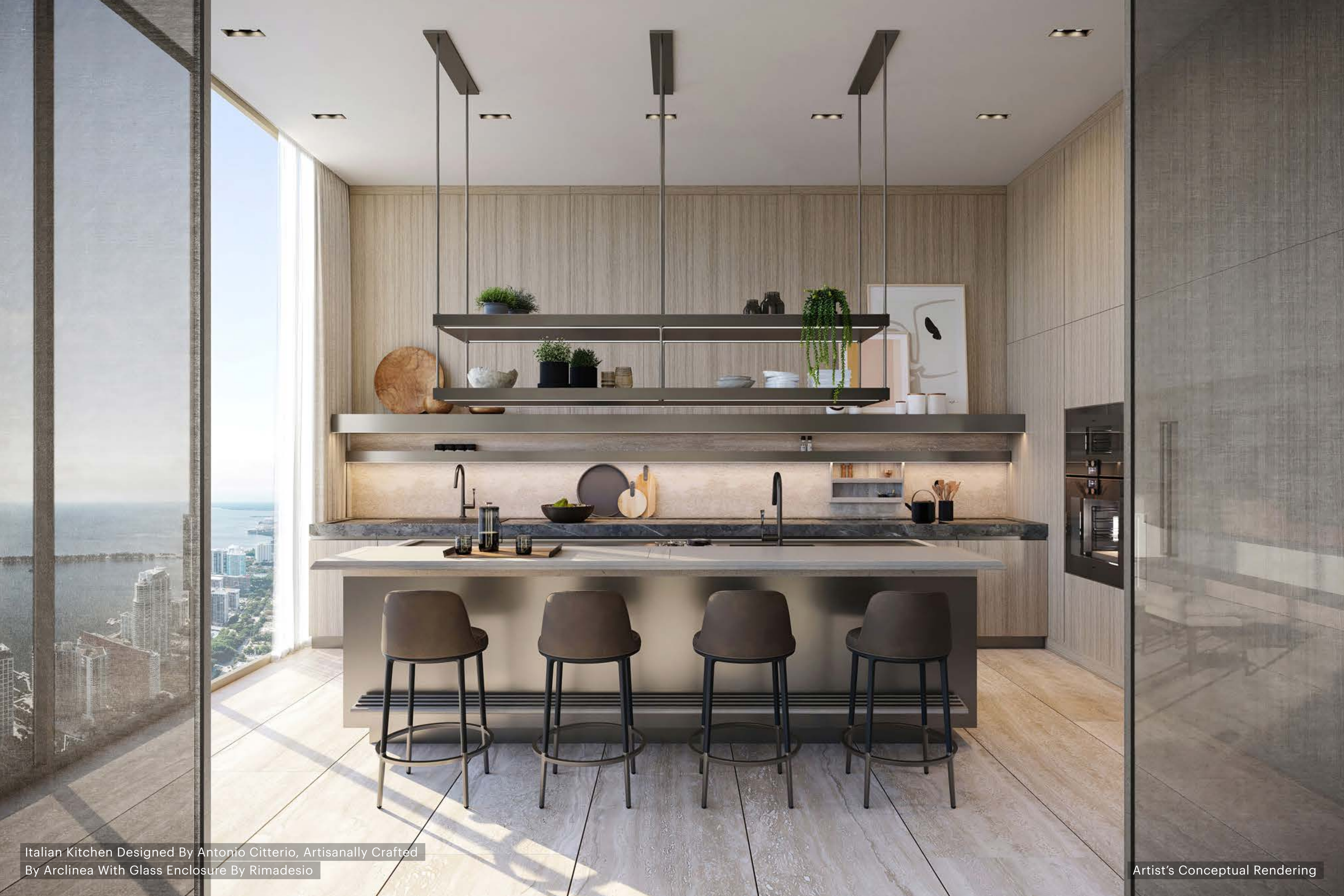
Italian Kitchen Designed By Antonio Citterio, Artisanally Crafted By Arclinea With Glass Enclosure By Rimadesio