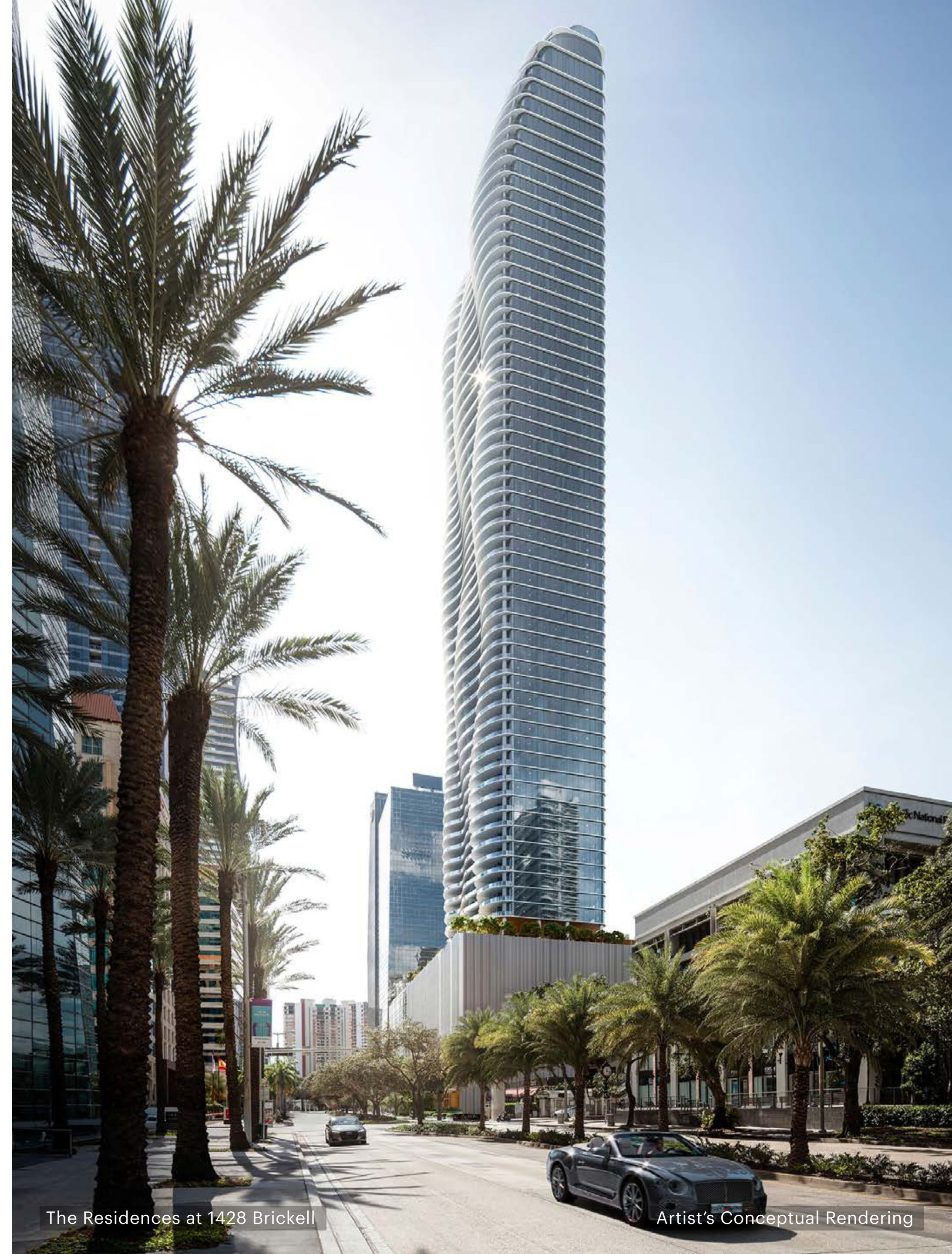
The Residences at 1428 Brickell