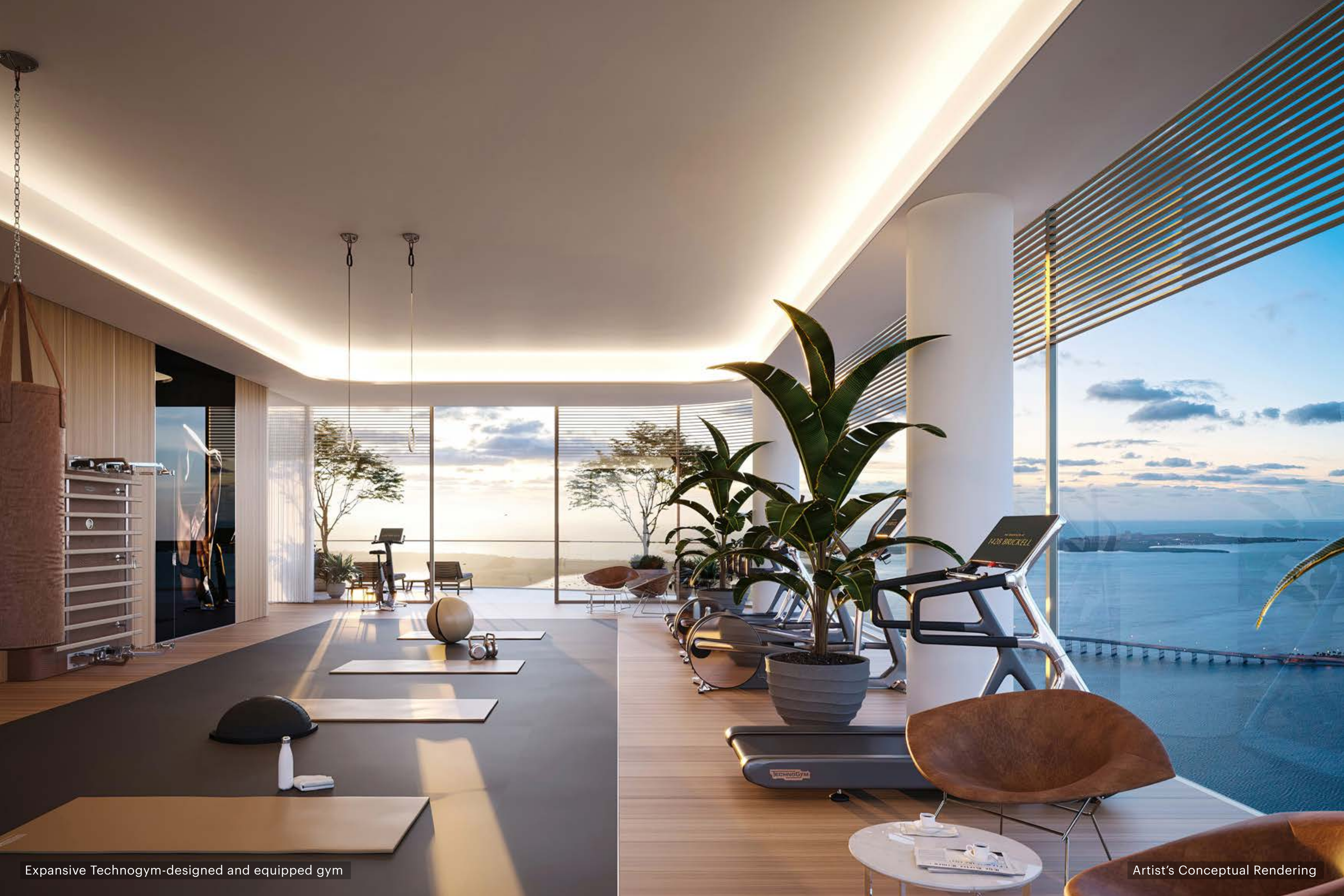
Expansive Technogym-designed and equipped gym