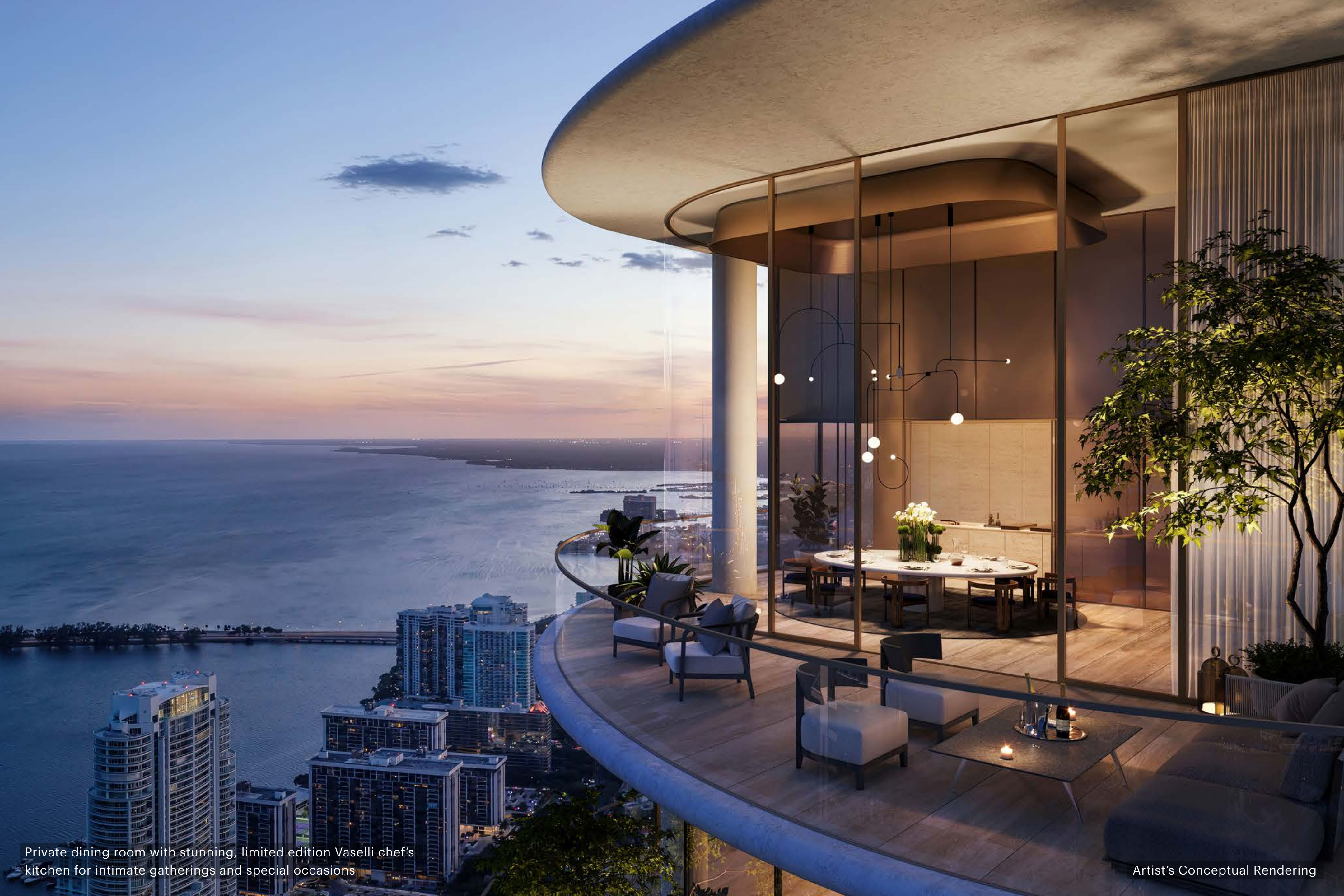
Private dining room with stunning, limited edition Vaselli chef's kitchen for intimate gatherings and special occasions