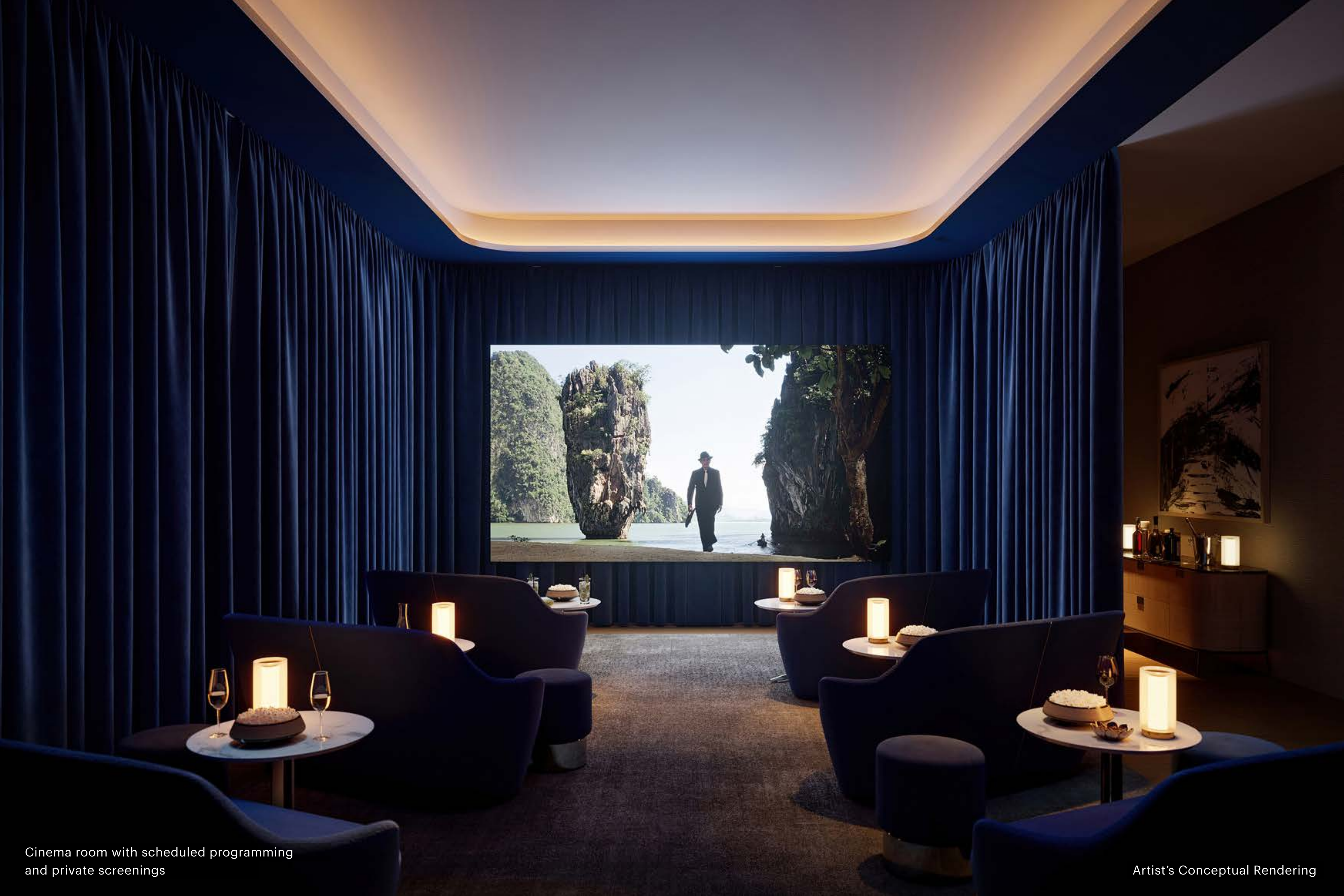
Cinema room with scheduled programming and private screenings