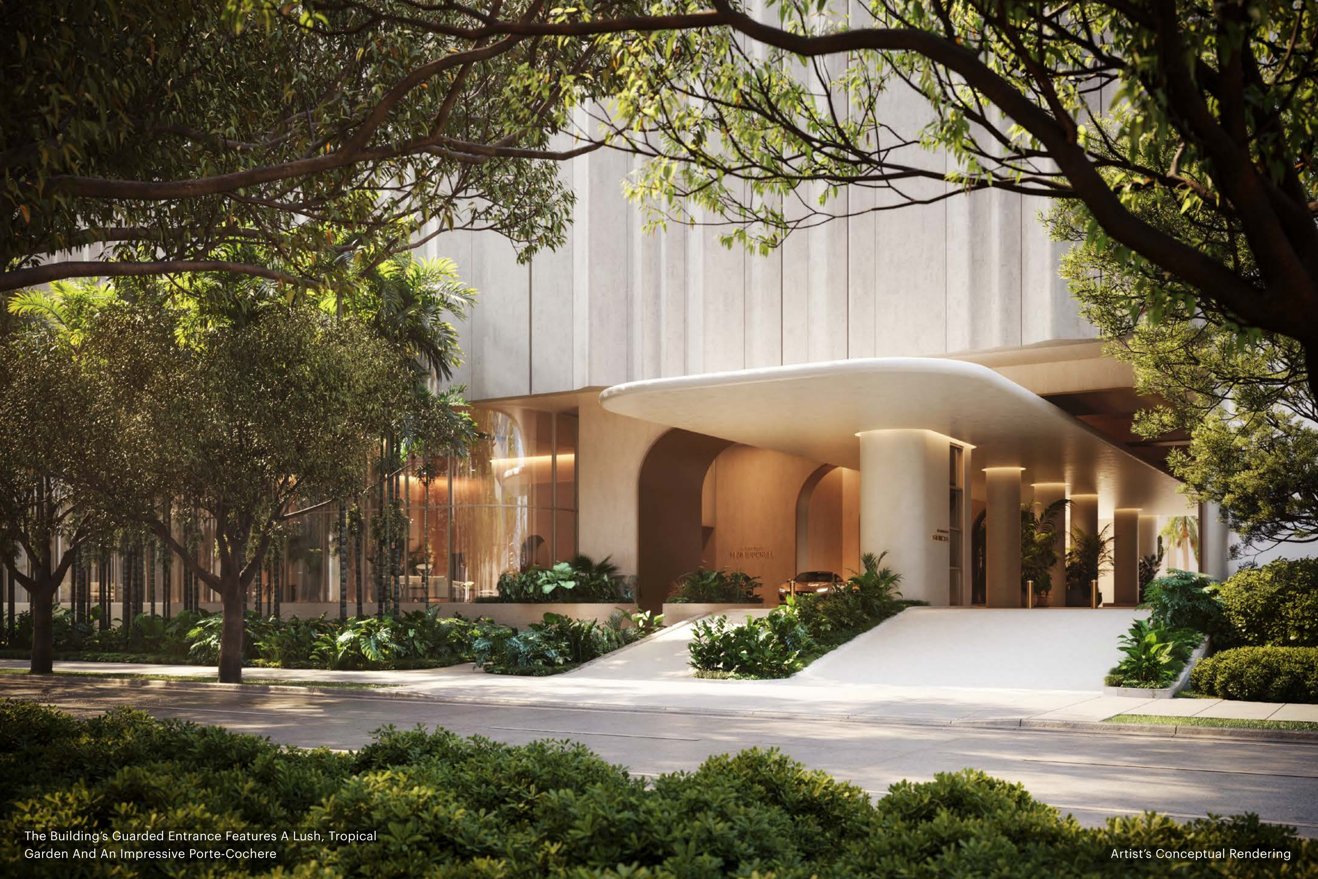
The Building's Guarded Entrance Features A Lush, Tropical Garden And An Impressive Porte-Cochere