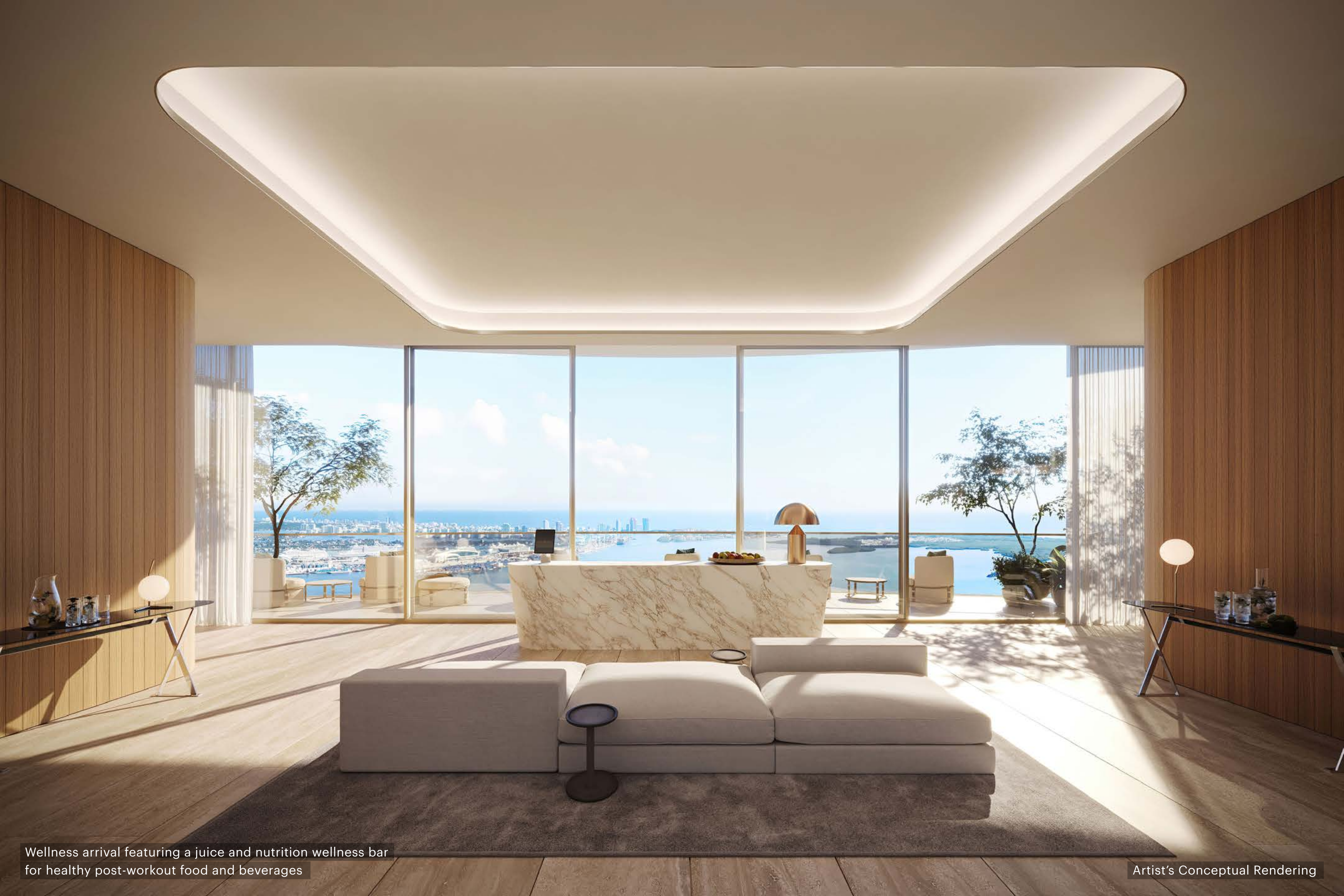
Wellness arrival featuring a juice and nutrition wellness bar for healthy post-workout food and beverages