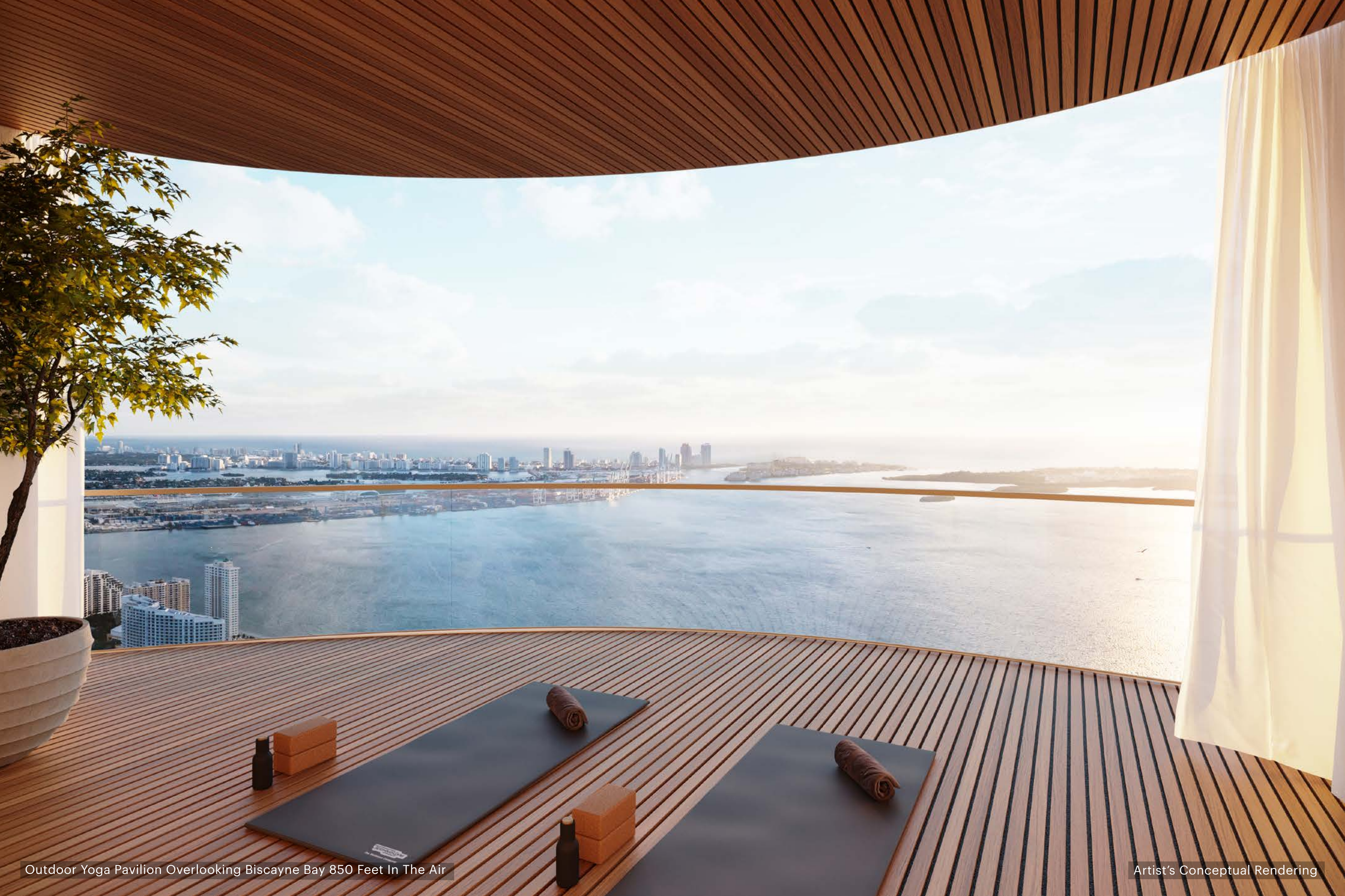
Outdoor Yoga Pavilion Overlooking Biscayne Bay 850 Feet In The Air