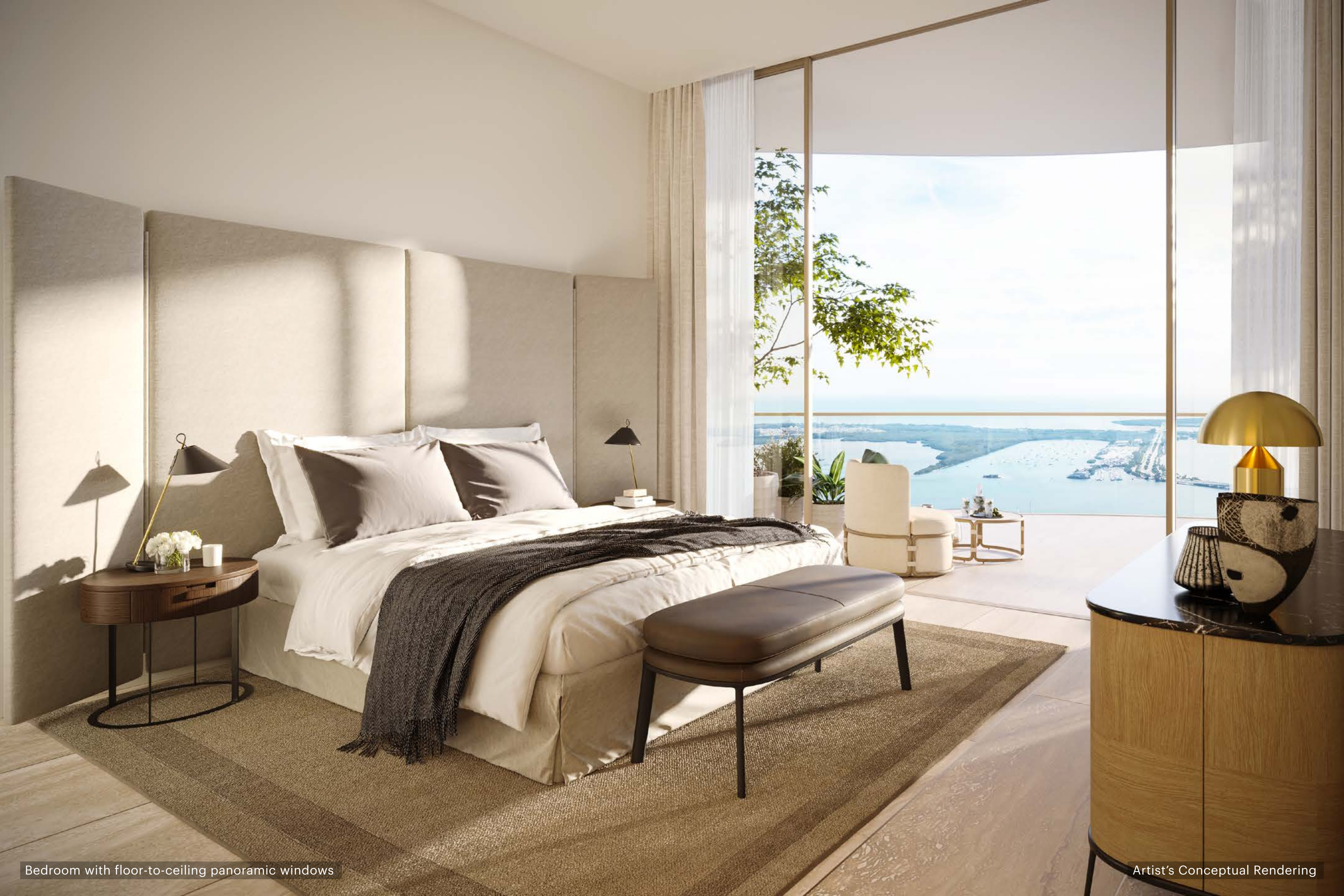
Bedroom with floor-to-ceiling panoramic windows