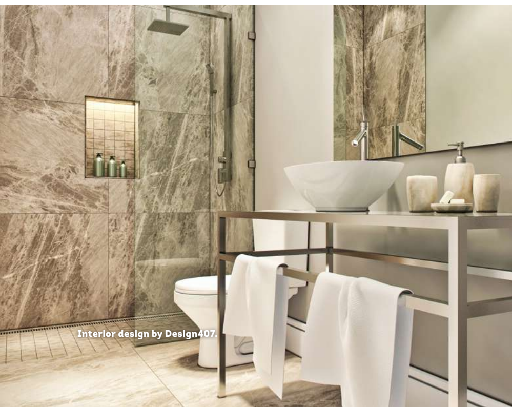
Interior design by Design407.