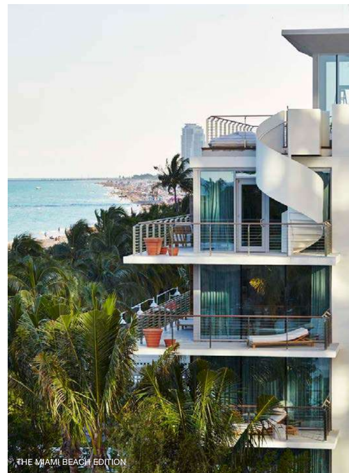
THE MIAMI BEACH EDITION

EDITION HOTELS ARE STUNNING MICROCOSMS OF THE WORLD'S TOP CITIES FEATURING THE BEST IN SERVICE, FOOD, BEVERAGE AND ENTERTAINMENT.