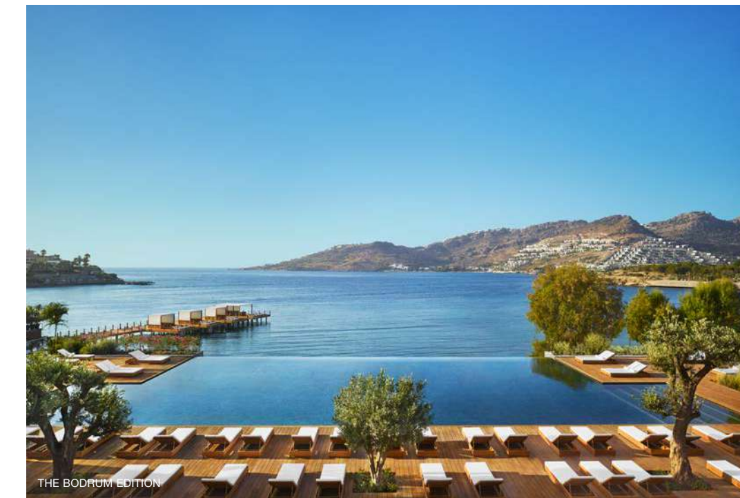
THE BODRUM EDITION

Located in gateway cities throughout the world, these are hotels where you'll find guests rubbing elbows with locals because there's no better place to be in the moment. Hotels that feel different because they make you feel something. Hotels that don't act like hotels.