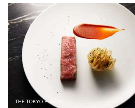
THE TOKYO EDITION