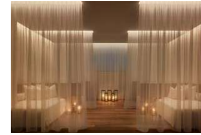
Right top to bottom: The Miami Beach EDITION Spa and The Bodrum EDITION Spa.

From artists and musicians to world-class chefs and designers, the EDITION experience is a collaboration of creativity, leaving no stone unturned to make the guest experience nuanced, enchanting, and truly memorable.