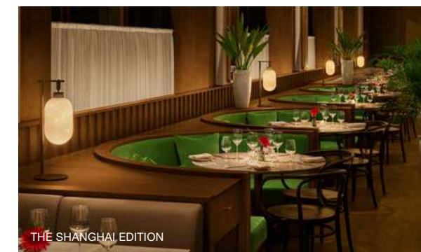
THE SHANGHAI EDITION

Envisioned by Ian Schrager and Marriott International, EDITION is a personal and unique hotel experience, and it is a collaboration that has served us and our guests well.