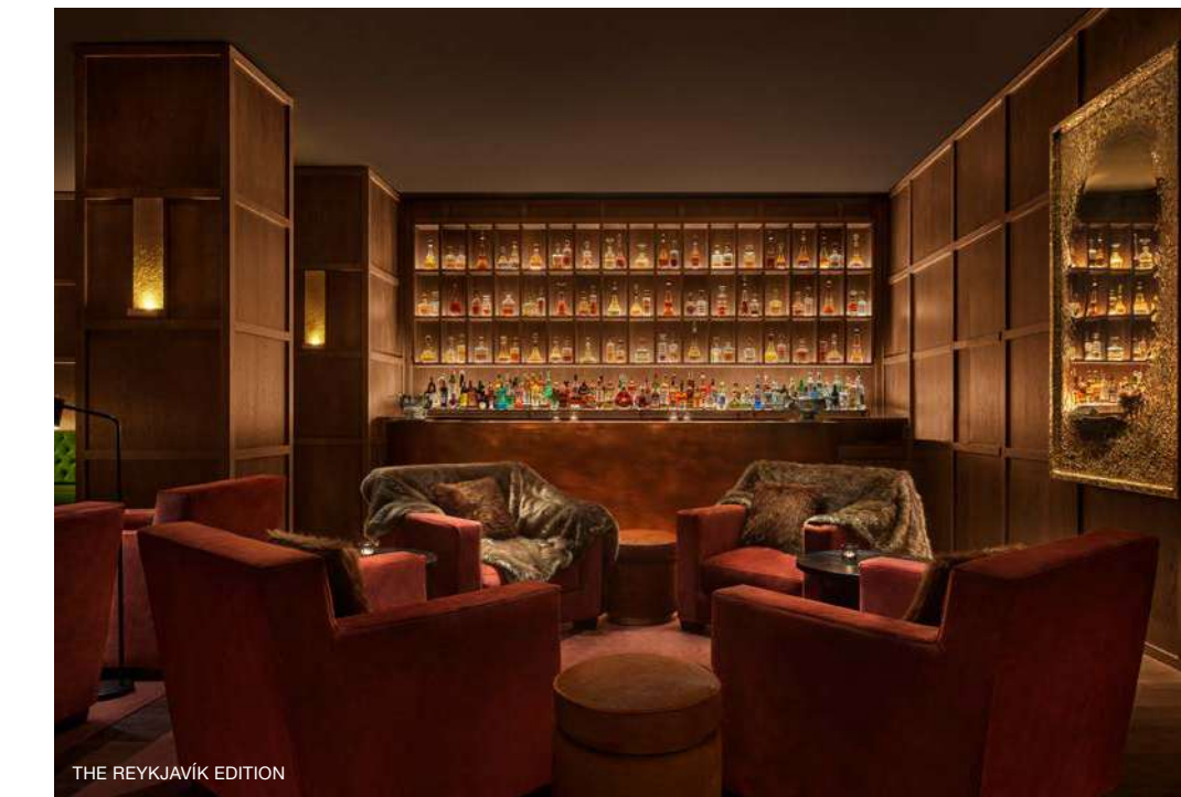
THE REYKJAVIK EDITION

Our desire is to infuse emotion into a check-in/check-out world by bringing each location to life in an intimate, seductive environment.