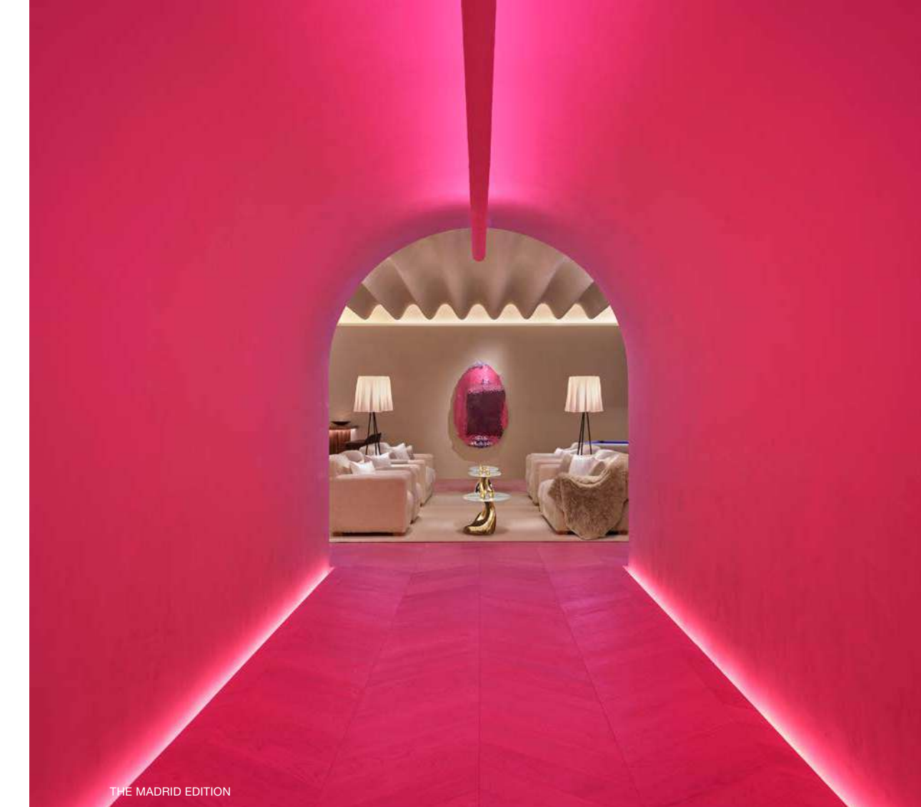
THE MADRID EDITION