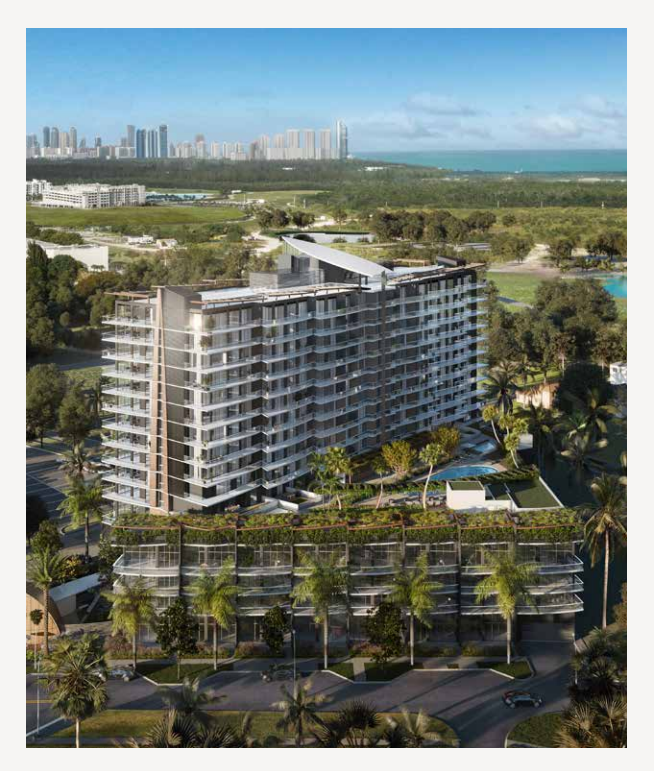
NEXO RESIDENCES IN NORTH MIAMI BEACH, FLORIDA