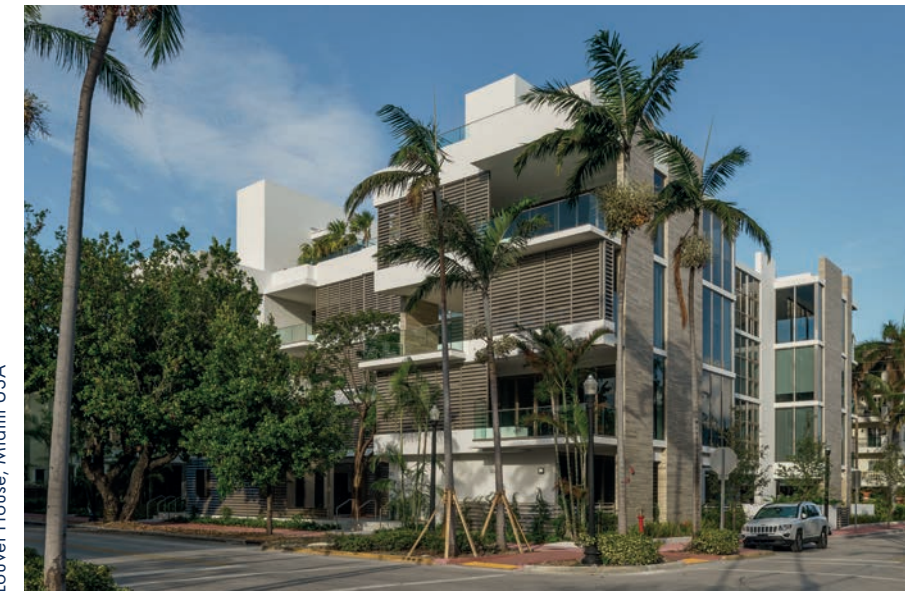
Louver House, Miami USA