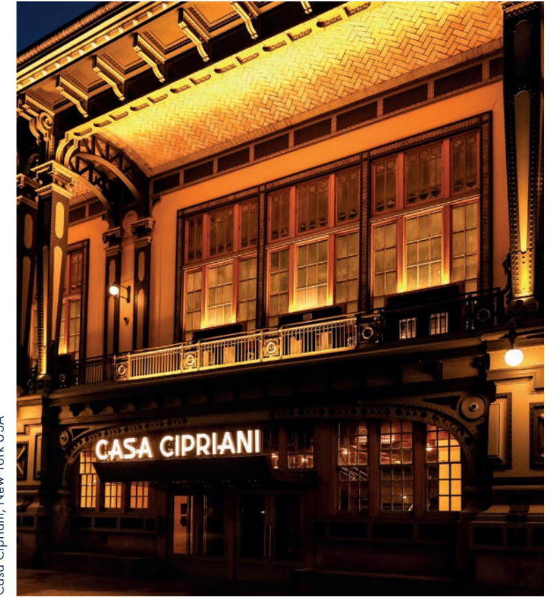
Casa Cipriani, New York USA