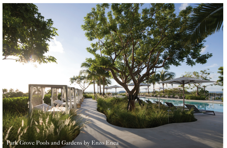
Park Grove Pools and Gardens by Enzo Enea