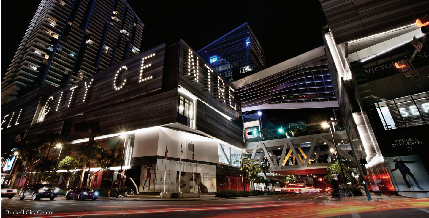
Brickell City Centre

Perfectly positioned at the entrance of Brickell Avenue, where the Miami River meets the beautiful blue waters of Biscayne Bay, and the bustling financial district blends with high-end shopping, top restaurants, cultural hot spots and exiting nightlife — this iconic neighborhood is an all-day all-night lifestyle destination, aptly named the Manhattan of the South.