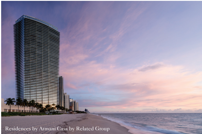
Residences by Armani Casa by Related Group

Renowned Swiss landscape architect Enzo Enea of Zurich-based Enea Garden, is one of the leading landscape architects in the world. A hallmark of Enzo Enea's work is the fusion of indoor and outdoor spaces, the creative intertwining of the soul of the residence with its surroundings.