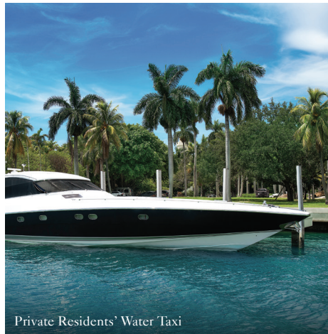
Private Residents' Water Taxi