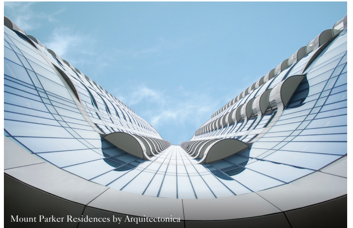
Mount Parker Residences by Arquitectonica