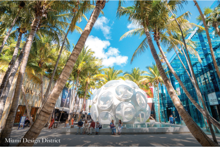
Miami Design District