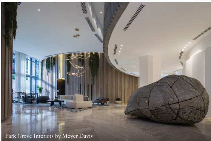
Park Grove Interiors by Meyer Davis