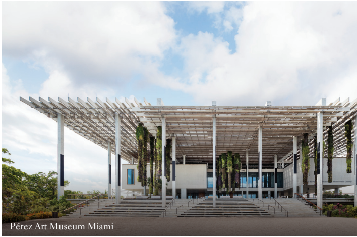
Pérez Art Museum Miami