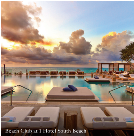
Beach Club at 1 Hotel South Beach

The private marina, planned riverside restaurant and lushly landscaped river promenade invite residents to spend hours and days luxuriating in the infinite energy and organic sparkle of life by the water. Watch the superyachts come and go, take a sunset stroll towards the bay, or head to a number of chic waterside restaurants courtesy of our private water taxi service. Residents can enjoy private membership and exclusive access to the Beach Club at 1 Hotel South Beach, SH Hotels & Resorts sister property. With loungers, beach towel services, cabanas, and seaside snack and beverage services, this waterfront community will cater to leisurely hours under the sun. Take a break from the hustle and bustle of the city and unwind with a cool drink in hand and the sand between your toes.