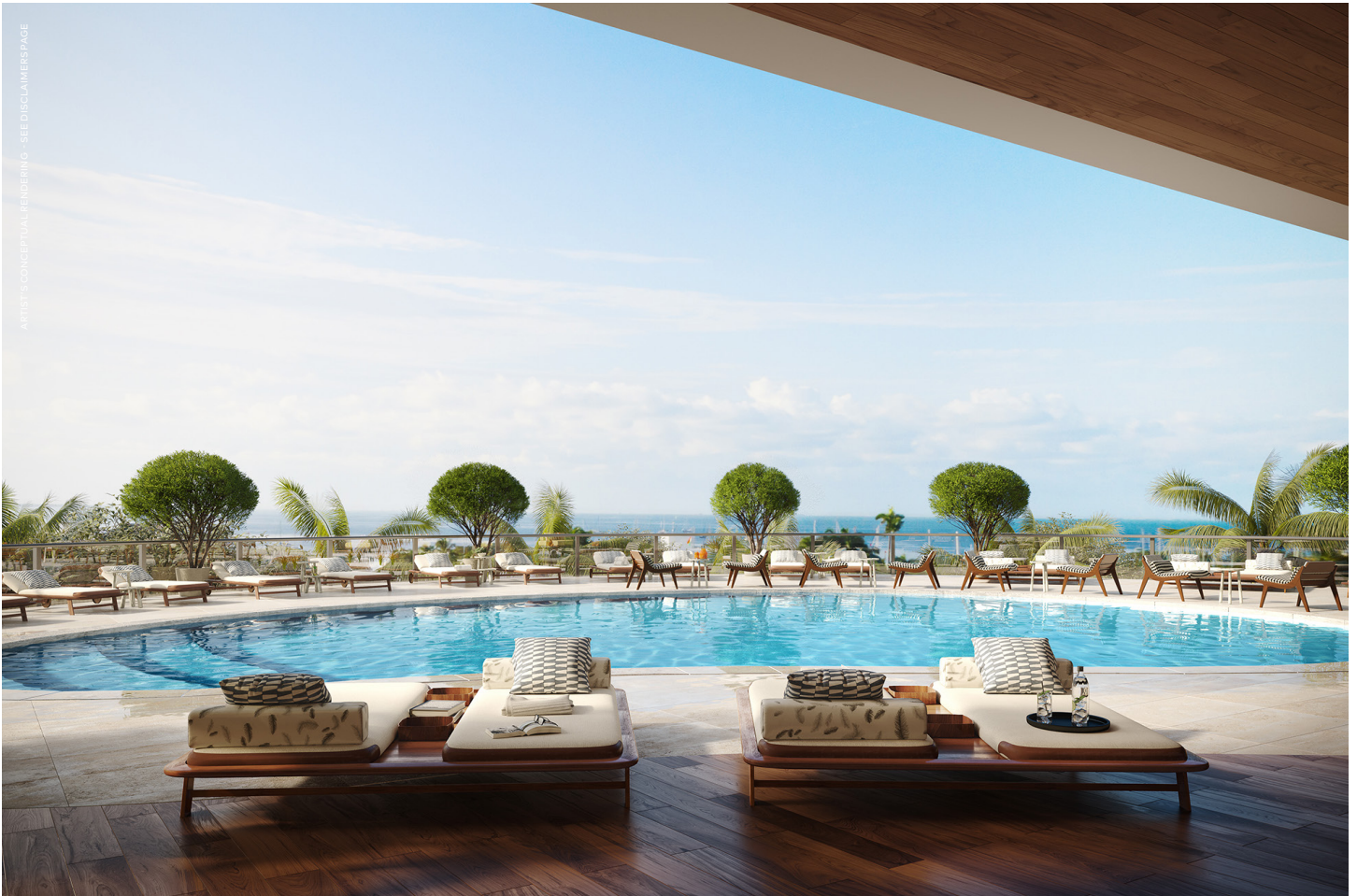
Bayshore Club Pool Deck

Personalized services, including a 24-hour concierge, are complemented by a host of amenities at Mr. C Residences Coconut Grove.